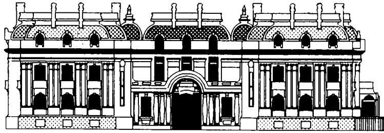
PALACIO SAN MARTÍN