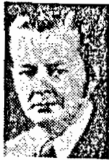
Don Campbell Gannett News Service

The case of Byron Hirst is a typical example of the success the