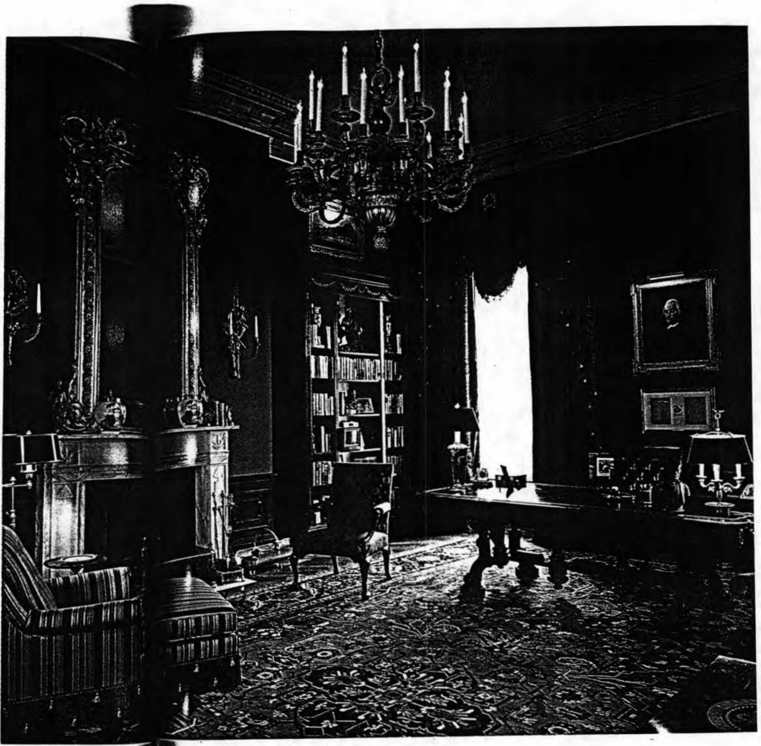
The Treaty Room, a second-floor office and sitting room for the President, now incorporates the conference table that was used when this room was the Cabinet Room in the late 19th century. The ornate gilded overmantel mirror and handsome chandelier were both originally bought for and used on the State Floor.