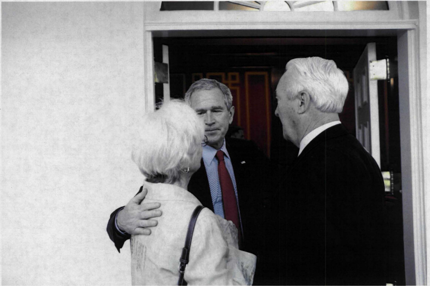
Receiving Line / Dinner. Screening of United 93. Dip Room. Bookseller's Area. Family Theater.