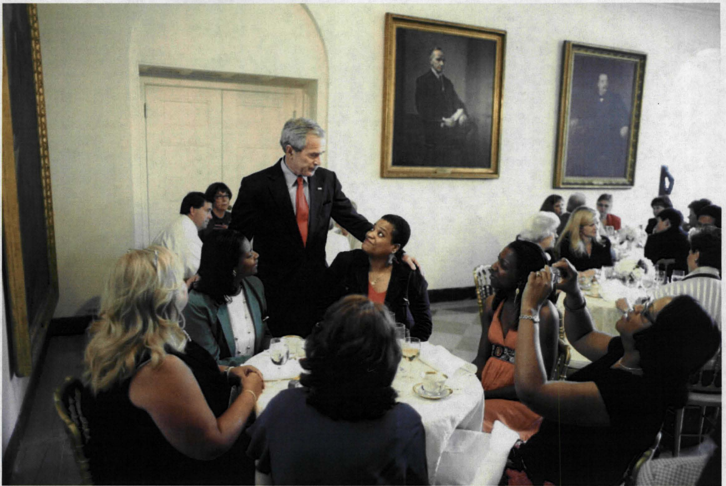
Receiving Line / Dinner. Screening of United 93. Dip Room. Bookseller's Area. Family Theater.