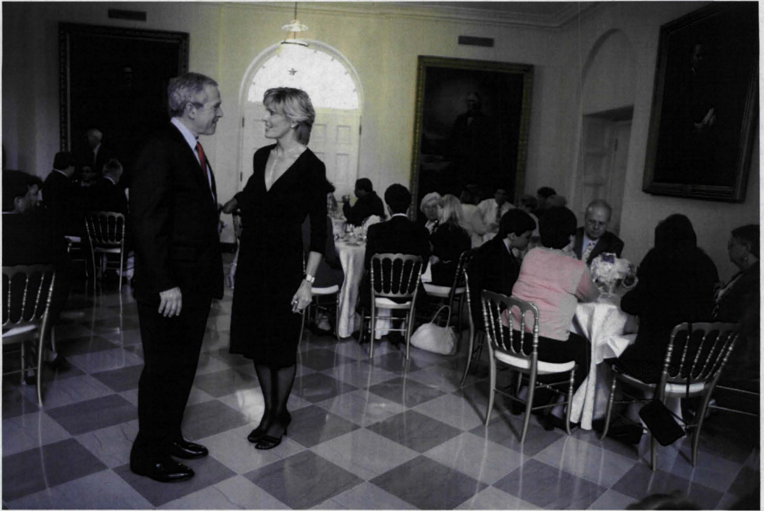
Receiving Line / Dinner. Screening of United 93. Dip Room. Bookseller's Area. Family Theater.