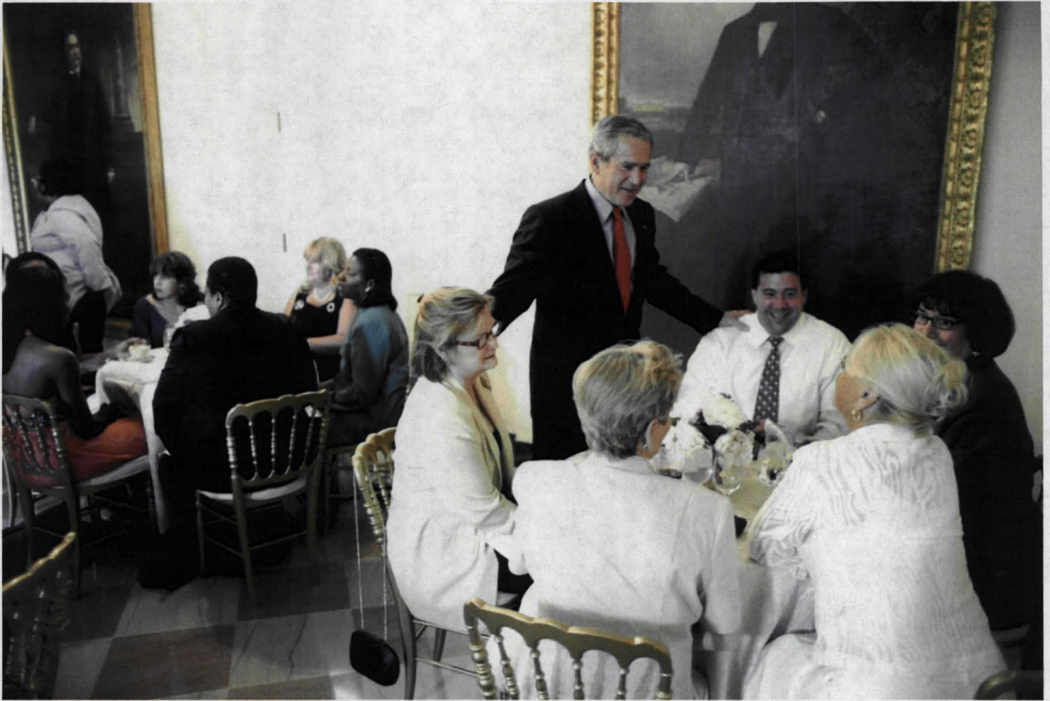
Receiving Line / Dinner. Screening of United 93. Dip Room. Bookseller's Area. Family Theater.