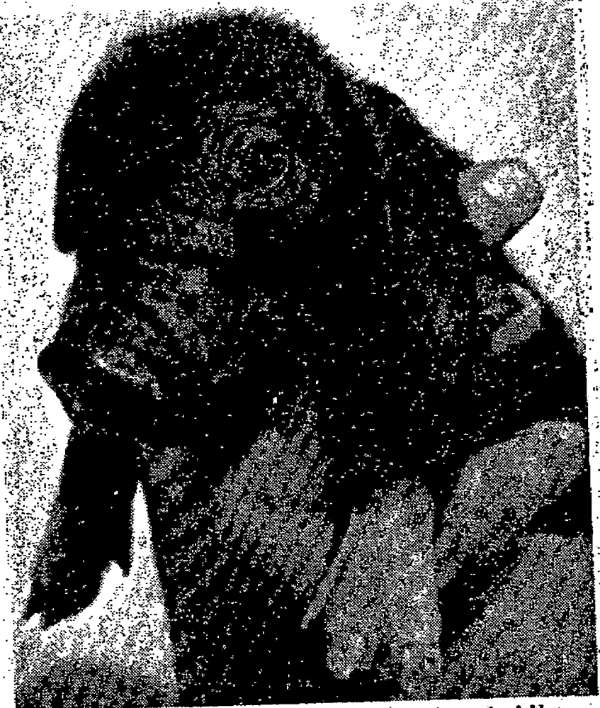
Iowa State University's newborn Chinese pigs feature plenty of wrinkles.

Rothschild, trying to coax one of the listless piglets to eat, placed one skinny young pig close to one of the mother's many outlets in an attempt