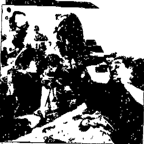
The U.S. armed services' medical personnel in the Persian Gulf are geared up to treat the injured in hospital units set up in the Saudi desert.

Approximately 12,000 DVA beds would be made available within 24 hours of notification. When the DVA system reaches capacity, the NDMS hospitals will be alerted within 48 hours that they may be called upon to