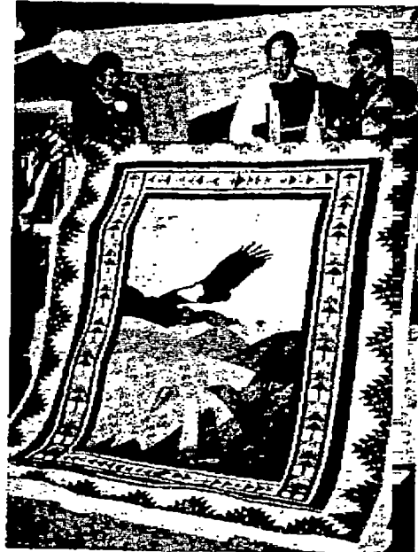
DOLLY presented Bob Hope with a beautiful quilt made especially for him at Dollywood.