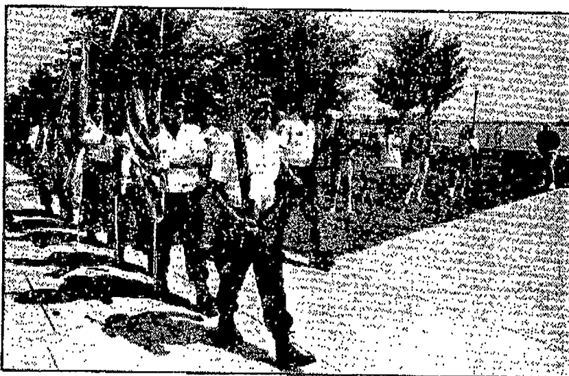
A veterans color guard was part of the groundbreaking ceremony. The memorial will be officially dedicated Oct. 10 following a parade.

Groundbreaking took place Sunday on a memorial dedicated to the memory of 183 Delaware County residents who died in the Vietnam War. Work on the $20,000 bronze-in-granite structure in Market Square Memorial Park in Marcus Hook was made possible by the efforts of the Delaware County Vietnam Veterans Memorial Project, founded by a group of area veterans.