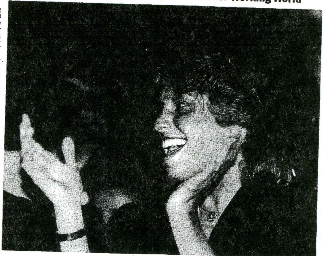
Specter advocates school-to-work transition programs, similar to those in place in Japan and Germany.

This country lacks a systematic approach to preparing the non-college bound for work in our society. Our major competitors