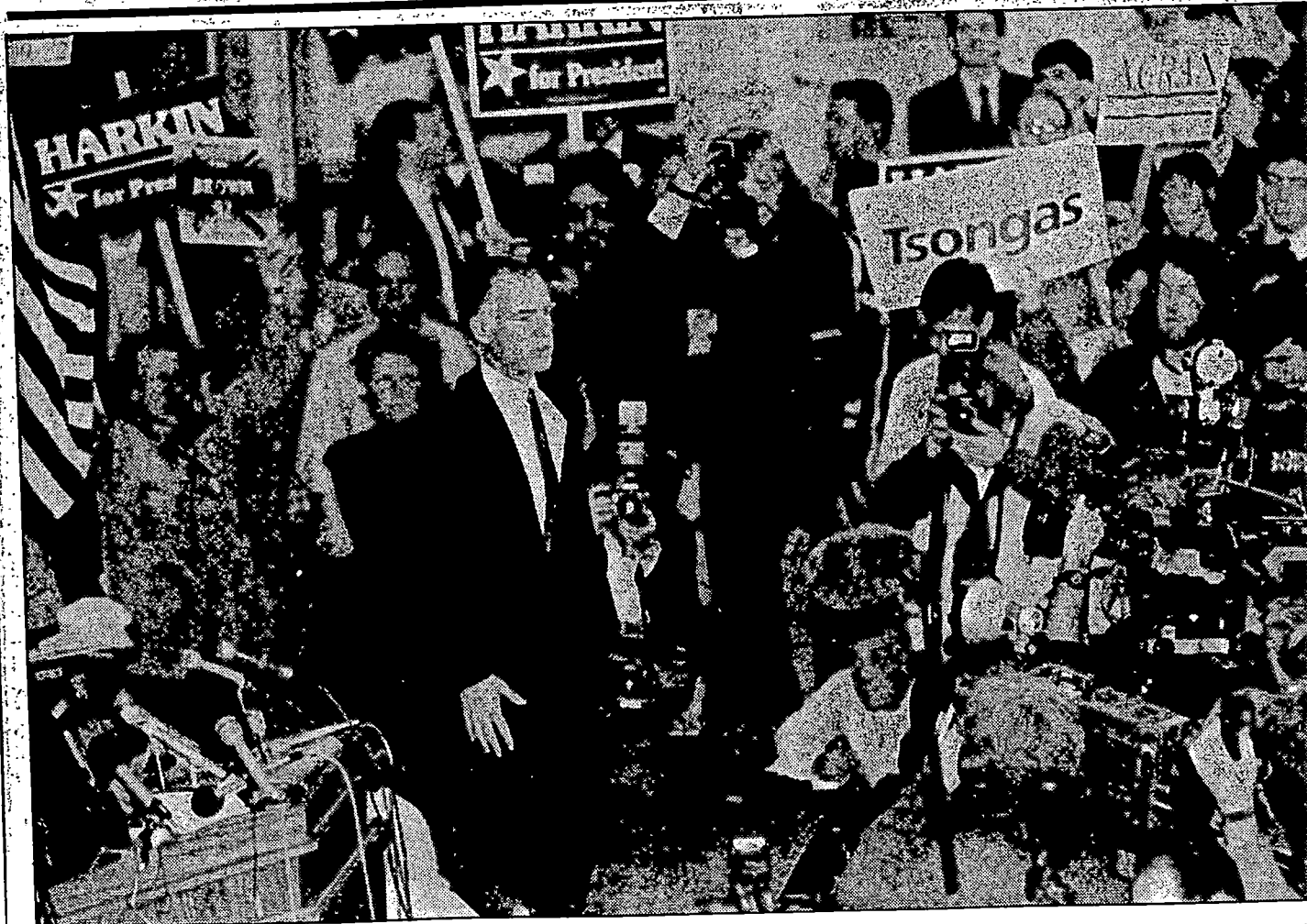
Former California Gov. Jerry Brown speaks to the press and supporters yesterday in Portland after faring well in the Maine Democrat

"You need a second hole in it who has convinced most, and the