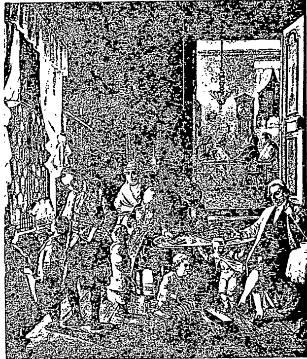
Kindling of Lights. Painting by Moritz Oppenheim, showing a family lighting a Hanukkah lamp at the window of their home.

The Greeks took various steps to achieve their goal, among them the desecration of the Temple in Jerusalem. I Maccabees (4.36-59) reports that the altar had been defiled, the Syrian ruler, Antiochus Epiphanes, having commanded that sacrifices to pagan gods be offered on it. After a three-year struggle, the Maccabees under Judah Maccabee conquered Jerusalem, and demolished and rebuilt the defiled altar. They also produced new vessels for the Temple service, including a candelabrum, an altar for incense, a table, and curtains. According to a talmudic tradition, a small quantity of consecrated oil, for use in the candelabrum (MENORAH), was found within the Temple precincts ( Shab. 21b). Although it was only enough to burn for one day, the oil lasted for eight days, and the festival was established for this length of time to commemorate the miracle. The Books of Maccabees do not record this tradition. In the Second Book of the Maccabees, it is noted that the eight-day festival was instituted by Judah upon his rededicating the Temple, according to the precedent of SOLOMON'S eight-day dedication of the First Temple. Some scholars have advanced the theory that the festival was established for eight days owing to the Jews' inability to observe the eight-day festival of SUKKOT during the fighting. With the Maccabean victory, this omission was rectified, and a celebration was held that