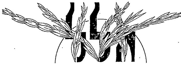
The word Hallel decorated with stylized foliage. From the Saul Raskin Haggadah.

benedictions. This is also the position of the Conservative movement. Reform Judaism makes no distinction between men and women in regard to saying Hallel .