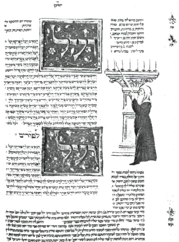
Illustration of Al-ha-Nissim, the thanksgiving prayer recited on the occasion of the festivals of Hanukkah and Purim. Hebrew manuscript, Italy, c. 1470.

AL HA-NISSIM We thank You for the miracles, the redemption, the mighty deeds, and the saving acts You performed, as well as for the wars which You did wage, for our fathers in days of old at this season.