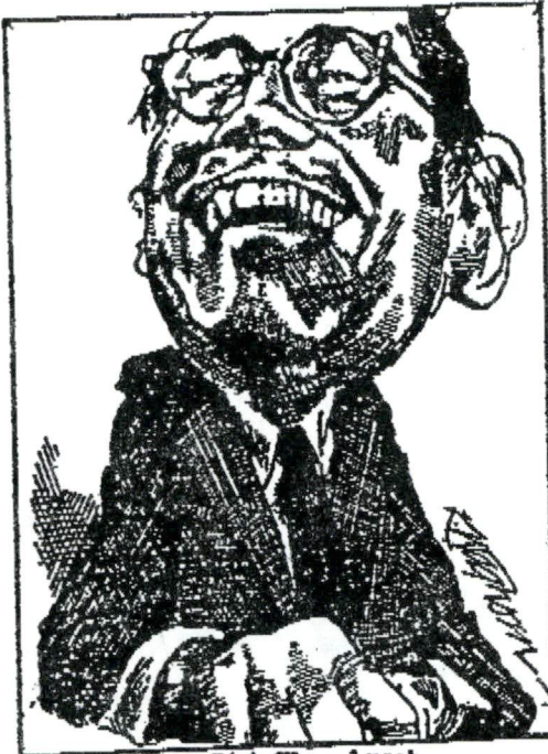
Gov. Dick Thornburgh

When he took office, the state faced a $70 million budget deficit. He leaves with the