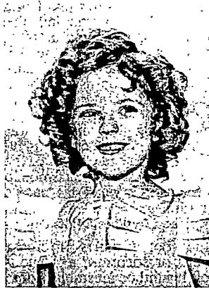
Shirley Temple

As Shirley Temple Black (her married name), she was a civic leader in San Francisco and an active member of the Republican