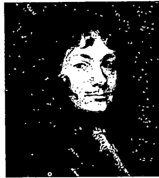
Sir William Temple, detail of a painting attributed to Lely, 1660; in the National Portrait Gallery, London

Temple began his diplomatic career in 1665 as a protégé of Charles II's secretary of state, Henry Bennett (later earl of Arlington). In 1668 Temple negotiated the Triple Alliance between England, the United Provinces (Holland), and Sweden. In spite of this, England declared war on Holland in 1672; he negotiated the treaty ending the Dutch War (1674), and in 1677 he and the King's chief minister, Thomas Osborne, earl of Danby, arranged the marriage between Charles II's niece Princess Mary and William of Orange, stadholder of Holland (later King William III and Queen