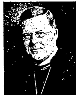
William Temple

Temple, William (b. Oct. 15, 1881, Exeter, Devonshire—d. Oct. 26, 1944, Westgate-on-Sea, Kent), archbishop of Canterbury who was a leader in the ecumenical movement and in educational and labour reforms. Ordained in 1909, Temple lectured in philosophy at Queen's College, Oxford (1904-10). Headmaster of Repton School (1910-14) and rector of St. James's, Piccadilly, London (1914-17), he became the leader of the Life and Liberty movement, an unofficial body designed to stimulate change in the governance of the Church of England. He was successively a canon of Westminster (1919-21), bishop of Manchester (1921-29), archbishop of York (1929-42), and archbishop of Canterbury (1942-44). Temple was a man of considerable energy and intellectual ability and wrote constantly, completing his largest philosophical work, Mens Creatrix (1917; "The Creative Mind"), the night before his marriage. Among other works are a volume of Gifford Lectures, Nature, Man and God (1934), Christianity and Social Order (1942), and The Church Looks Forward (1944). Temple's sympathetic attitude toward the Labour movement led him to join the Labour Party (1918-25); he was also