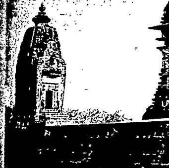
INDI on a

TEMPLE , a structure made sacred to a deity or holy symbol. The term from which the word "temple" is derived signifies a sacred enclosure; the element of sanctity is there but not the building. Yet the word "temple" in common usage is an image of a building at once monumental, and holy, preeminent in Jerusalem, described in the Bible as the place of the Lord. A full account not only of a social and economic factors.