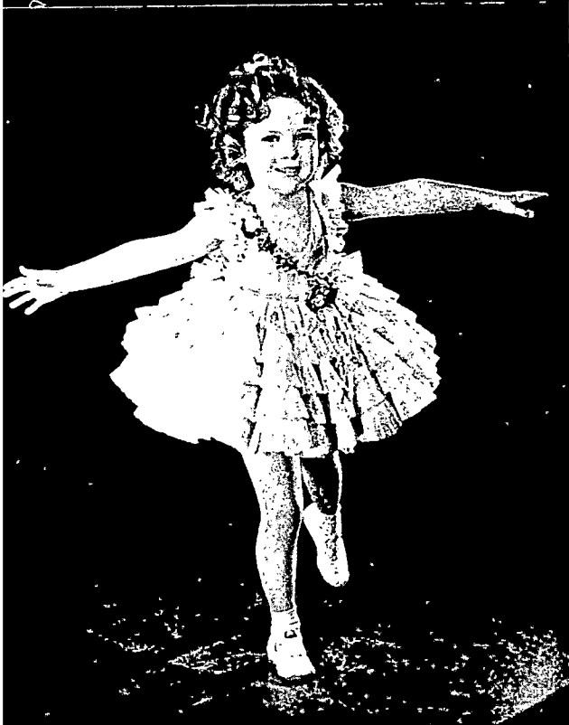
SHIRLEY TEMPLE BLACK

SHIRLEY TEMPLE in the 1934 film Baby Take a Bow , at the height of her career as a leading child star.