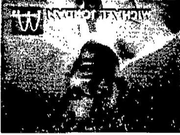
9. and so do I.