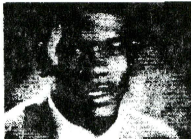
8. Listen, you've got at least 3/4 of your life to go. That's three more lifetimes to you.