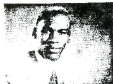
10. Get some help. McDonald's wants you to give yourself a chance.