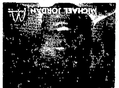
1. M. JORDAN: I'm Michael Jordan, McDonald's restaurants has given me this time--