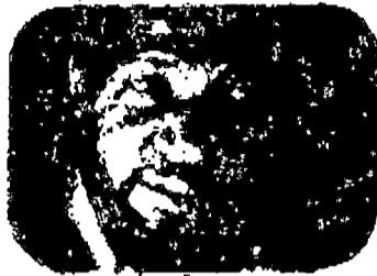
And then I got busted. As a result of my lust for cocaine...