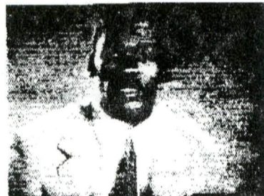
7. And believe me, if you don't use drugs, you can just about be anything you want to be.