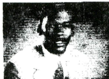
11. A chance to find out all the wonderful things you really can be...