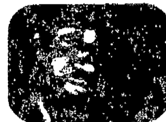
MERCURY MORRIS: Some of you know exactly what I'm talking about,