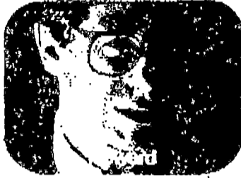
HOWARD: I was totally out of control and I didn't even realize it.