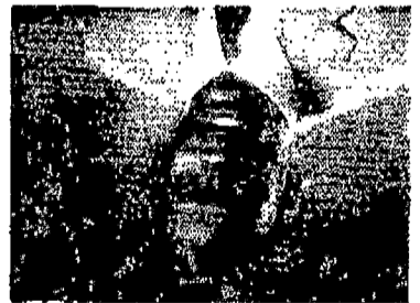
4. Do you realize that at eighteen, you have lived only one fourth of your life?