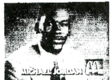
12. and so do I.