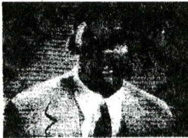
5. Do you realize, that at eighteen you have lived only one fourth of your life?