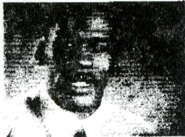
4. Think about this. Many of you using drugs out there now are under eighteen.