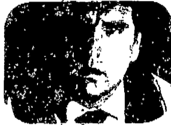
Then, I got into cocaine. And I almost lost it all.