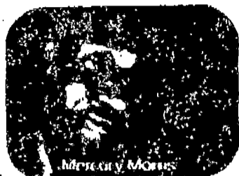
MERCURY MORRIS: There was this guy, a nationally known sports hero.