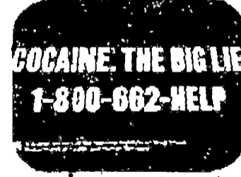
ANNCR: (VO) Cocaine. The big lie. Call 1-800-662-HELP.