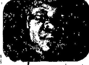
That wasn't me. It was somebody else.