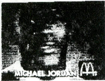
1. M. JORDAN: I'm Michael Jordan, McDonald's restaurants have given me this time...

AS FILMED AND RECORDED (2/87) "Drug Knot Program/Version II Revised" :60 MCSP0538