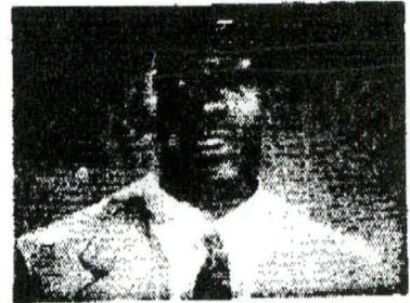
3. Kids are the reason McDonald's sponsors their "Get It Straight Program." A national drug awareness effort.