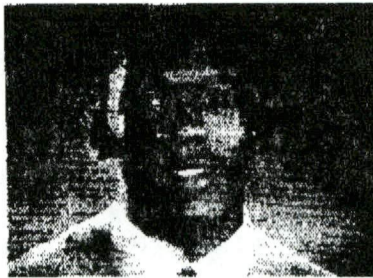
2. to talk to you about something we both really care about...kids.