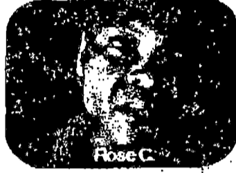
ROSE C: I was crazy from cocaine. I couldn't live without it.