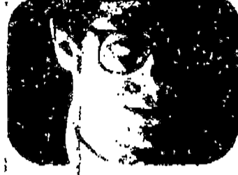
That's what's crazy about cocaine.