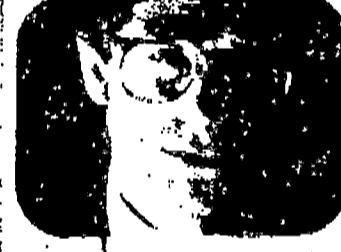
I risked my health, jail, and the people who loved me.