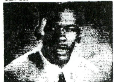
9. So don't blow it. Don't do drugs. If you're doing it, stop it.