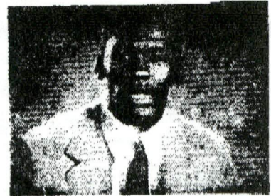
6. When you're using drugs, you're only cheating yourself out of the chance to find out who you really can be.