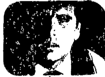
I didn't choose to be an addict. Quitting cocaine...