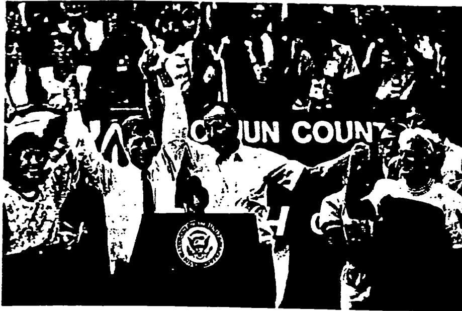
George Bush and Barbara Bush, right; Dan Quayle and his wife Marilyn.

same reasons, more than 40 percent of the U.S. Air Force and Navy combat aircraft were not fully mission-capable.