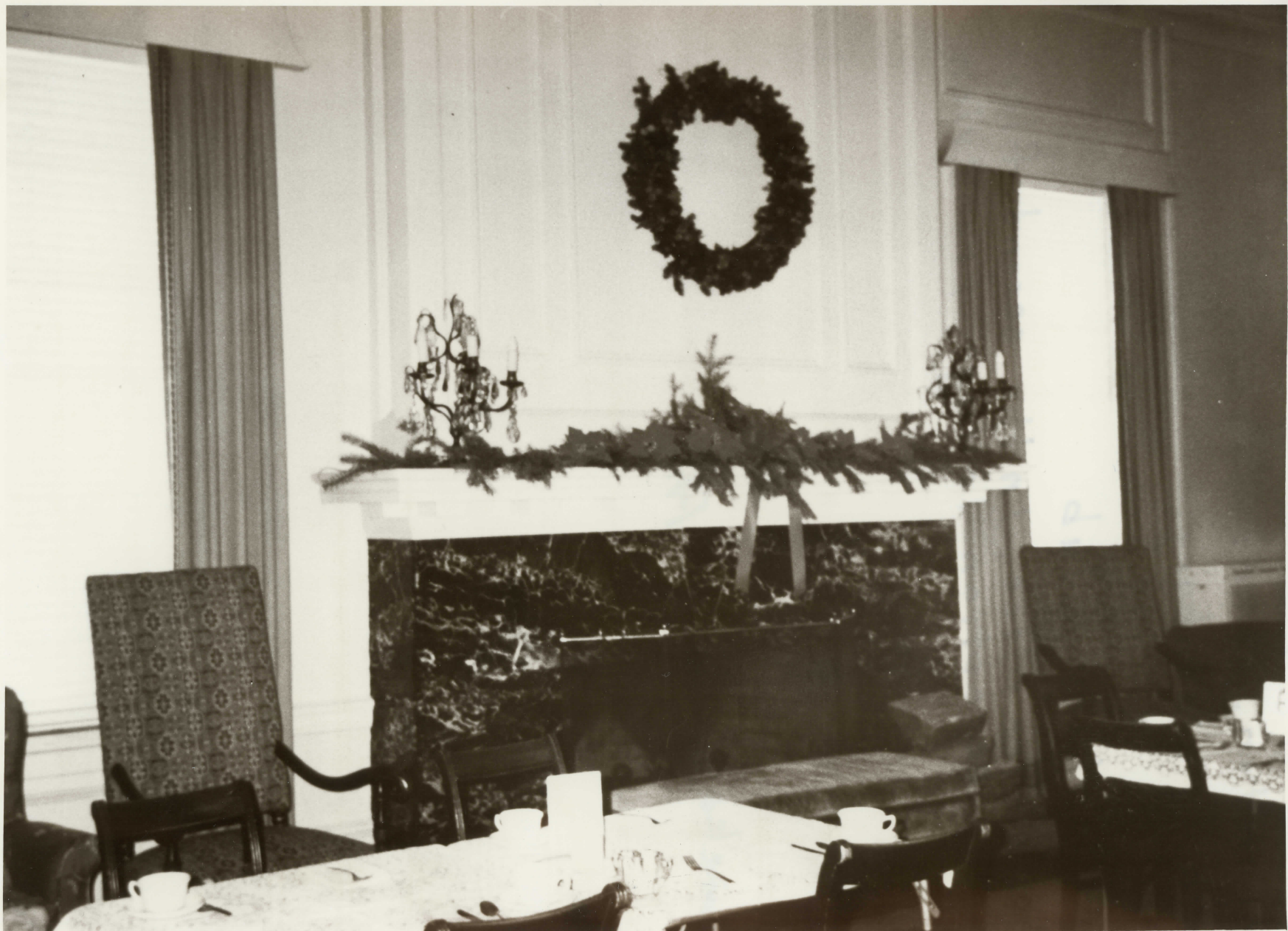
The Century Club of Scranton Lackawanna, Pennsylvania #6