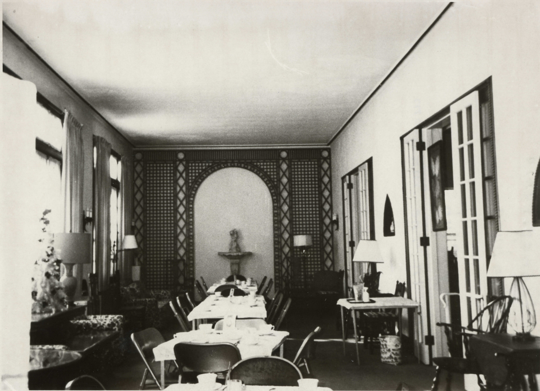
The Century Club of Scranton Lackawanna, Pennsylvania #7