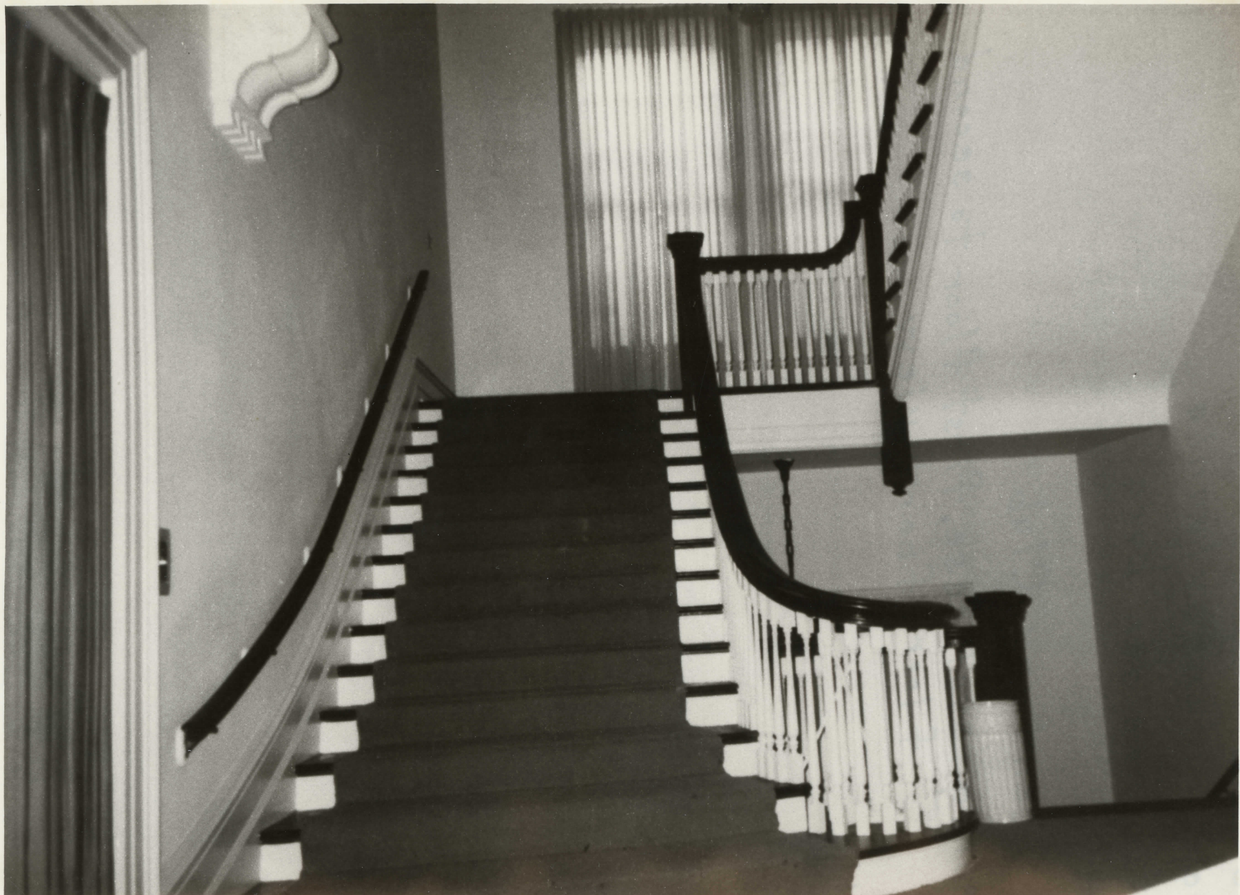
The Century Club of Scranton Lackawanna, Pennsylvania #4