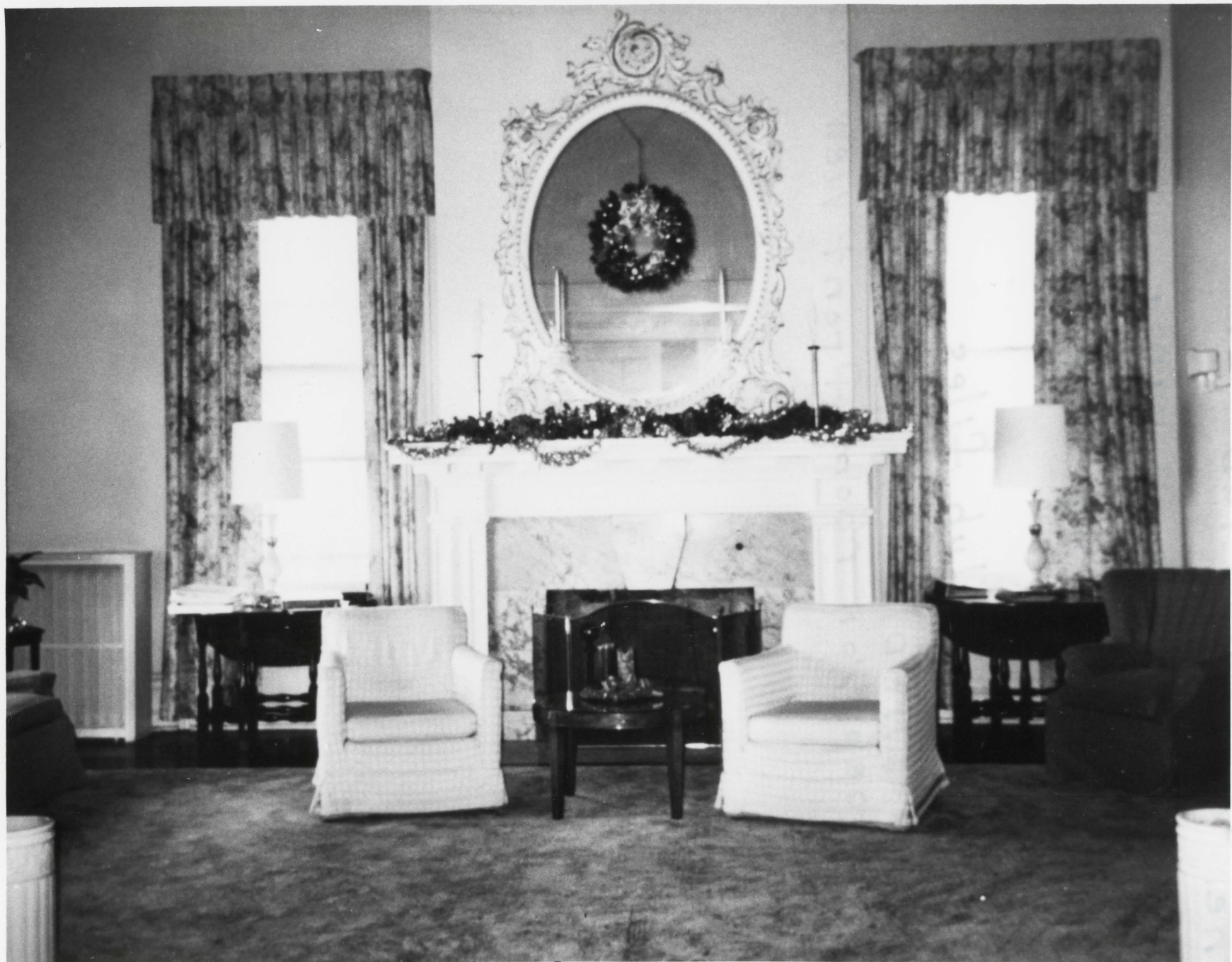
The Century Club of Scranton Lackawanna, Pennsylvania #3