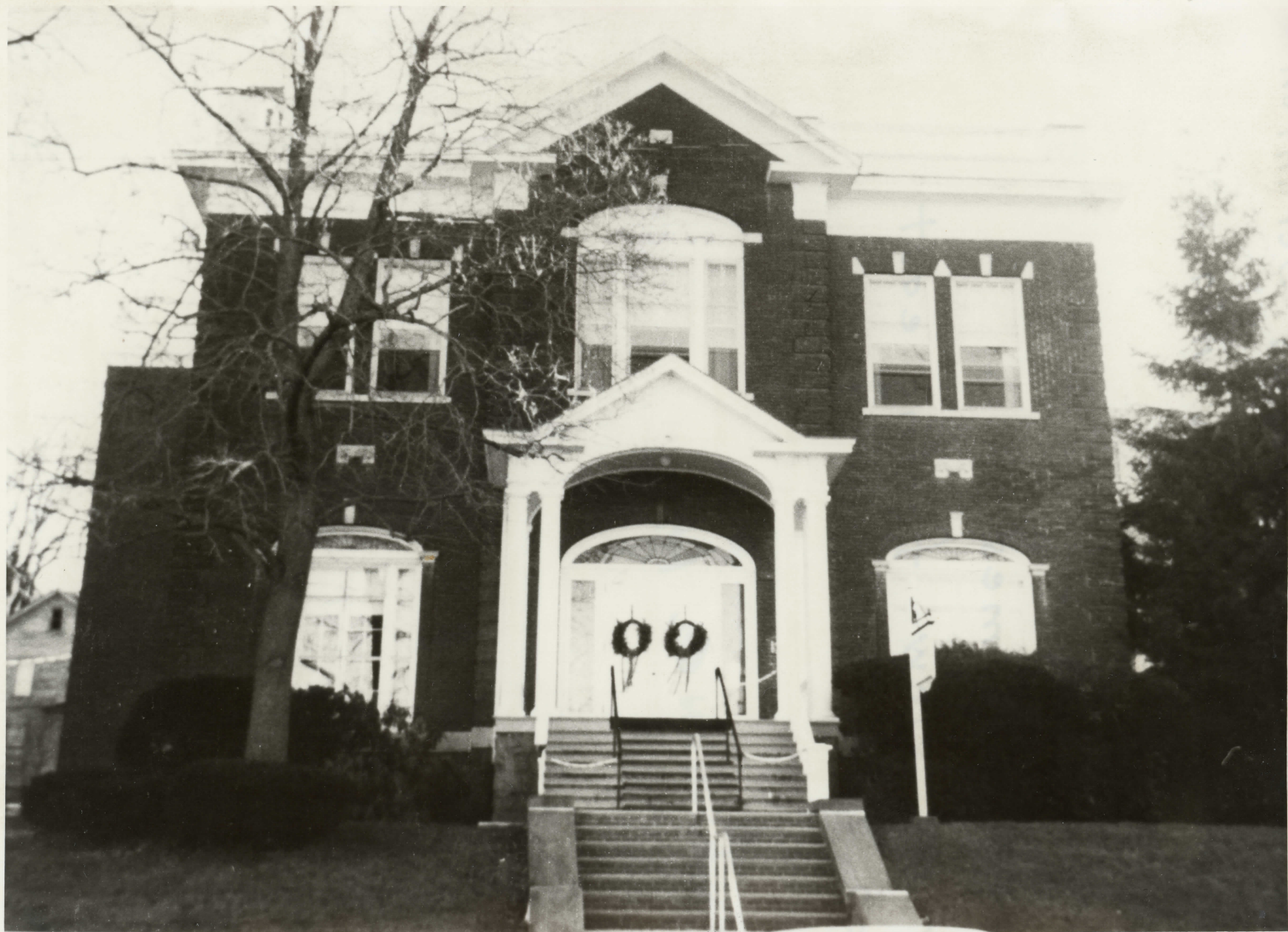
The Century Club of Scranton Lackawanna, Pennsylvania #2