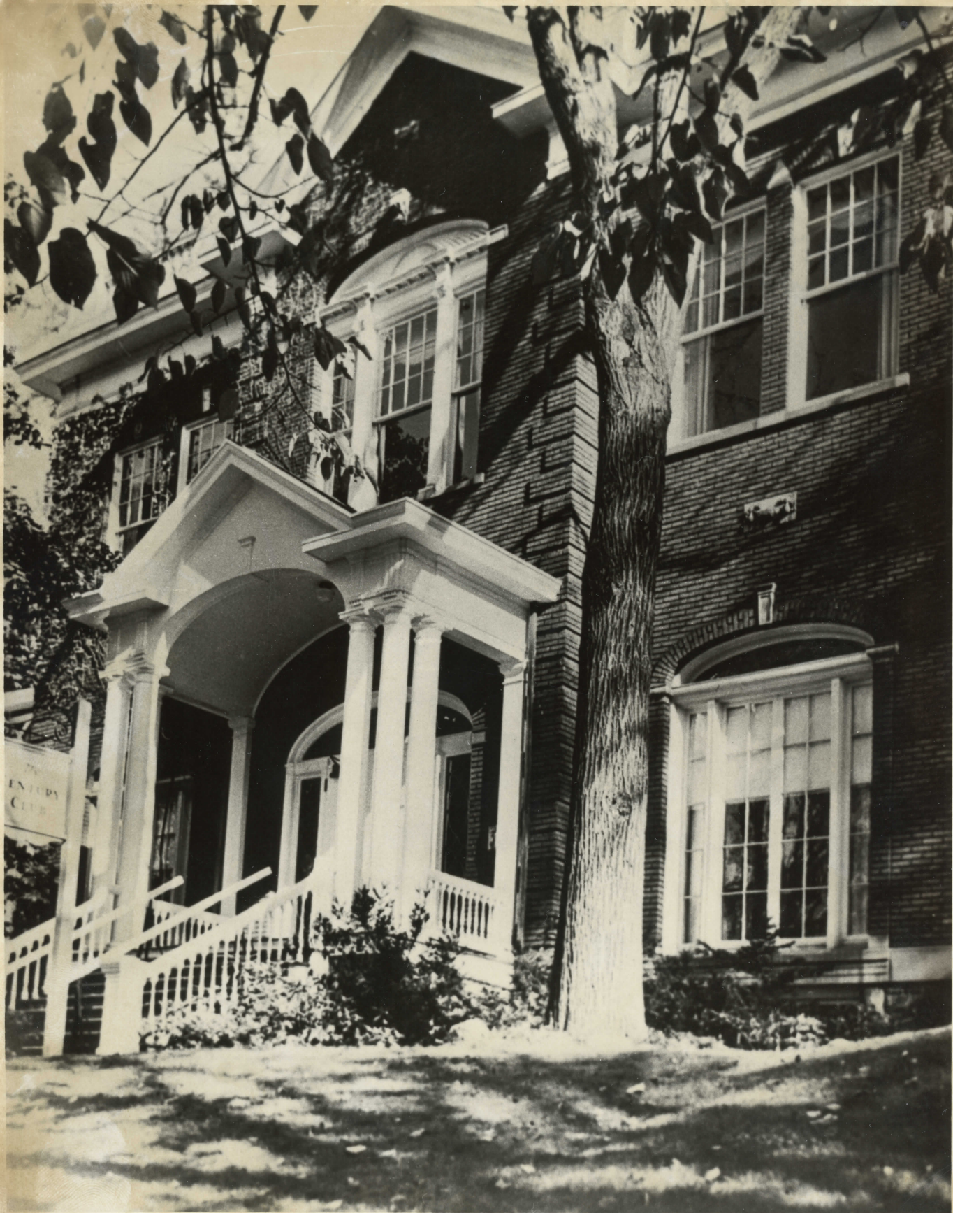
The Century Club of Scranton Lackawanna, Pennsylvania #1