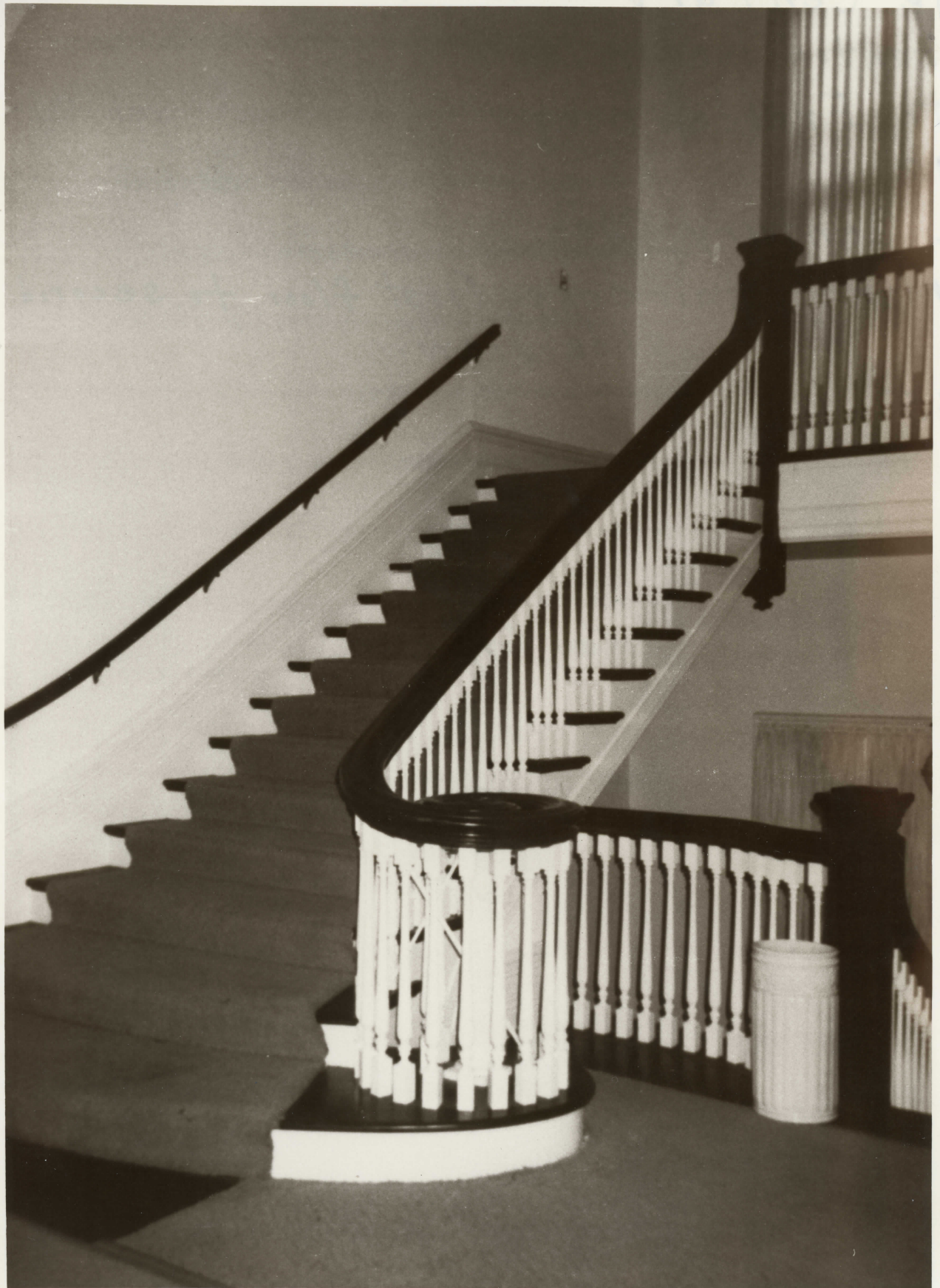
The Century Club of Scranton Lackawanna, Pennsylvania #5