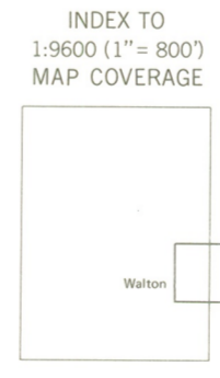
INDEX TO 1:9600 (1" = 800') MAP COVERAGE