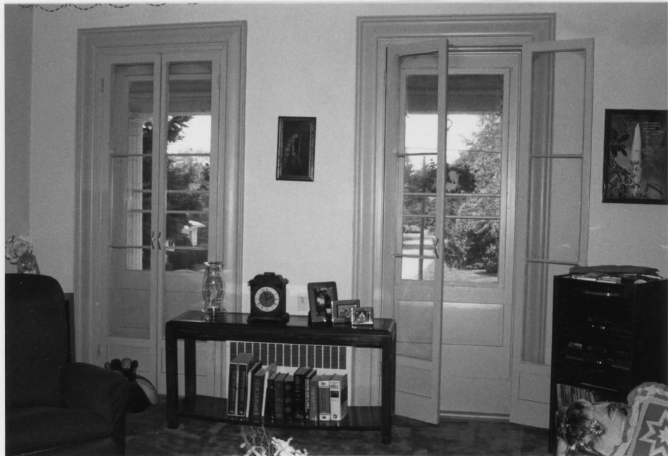
Parlor, French doors