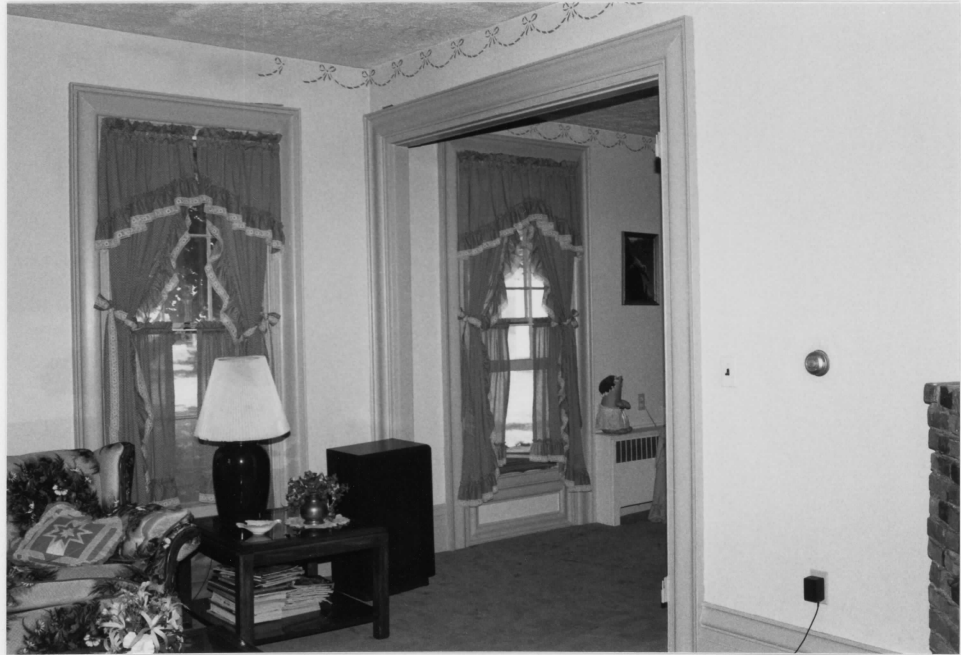
Parlor and sitting room