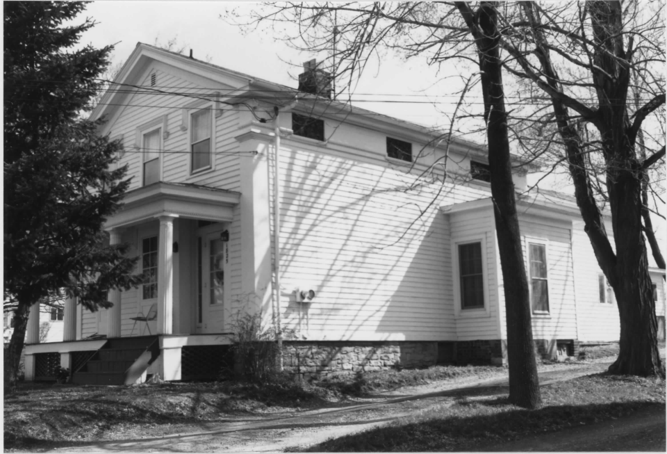
West and south elevations