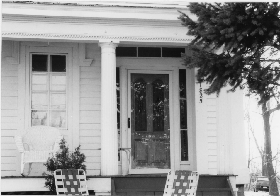
Front (west) entrance detail