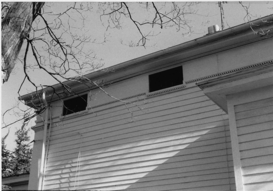
Detail of entablature with iron grilles