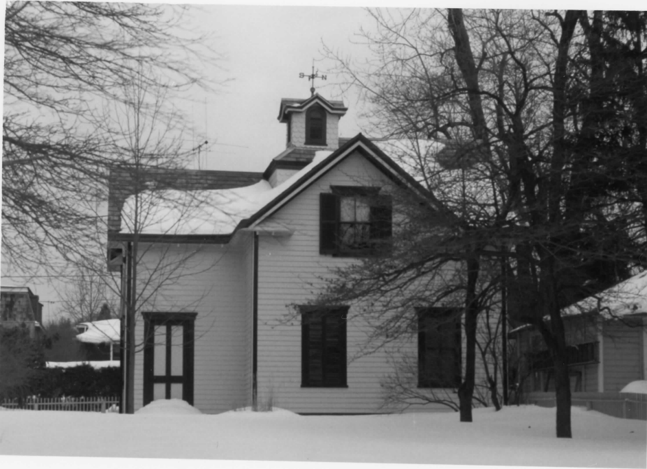
Sea Cliff Summer Resort Thematic Group, Sea Cliff, Nassau Co., NY View: 18 17th Avenue Barn 28 of 36