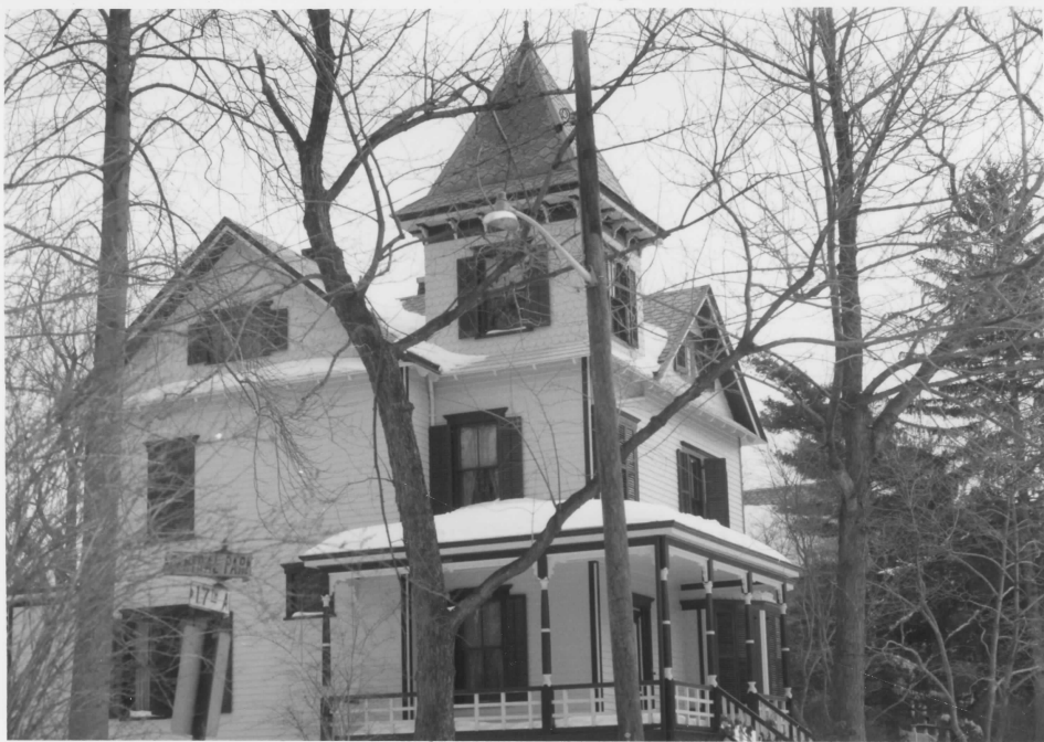
Sea Cliff Summer Resort Thematic Group, Sea Cliff, Nassau Co., NY Neg: Div. for Historic Pres. View: 18 17th Avenue Southwest Side 27 of 36