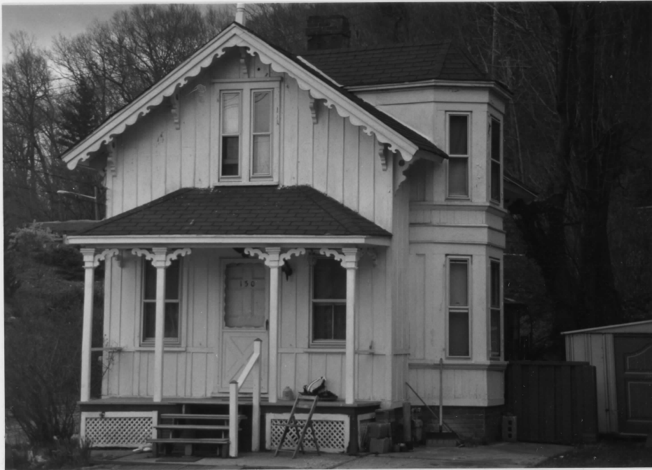
South facade of house viewed north from Mott Avenue.

Roslyn Village Multiple Resource Area Roslyn, Nassau Co., NY Component 4: Eastman Cottage 130 Mott Avenue