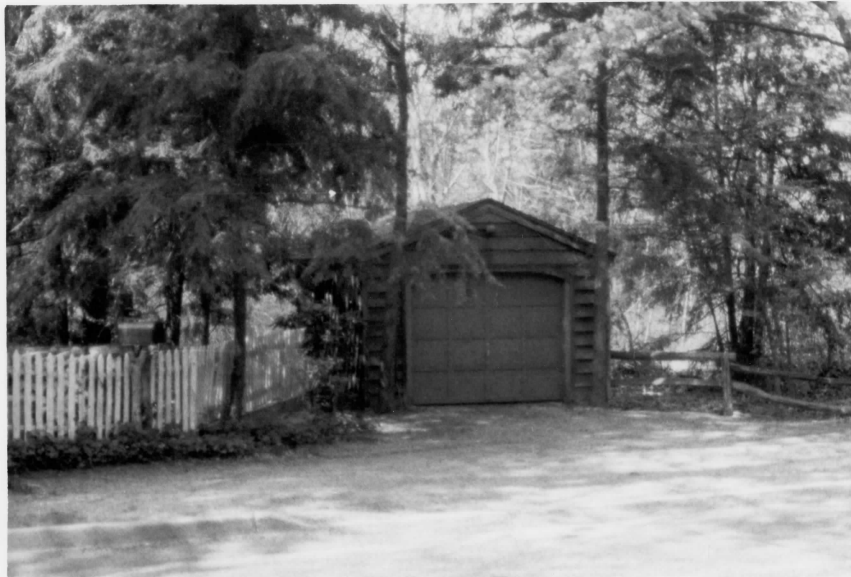
Garage to east