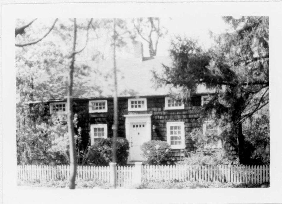
View from south

JOHN ROGERS HOUSE 627 HALF HOLLOW ROAD HALF HOLLOW HILLS