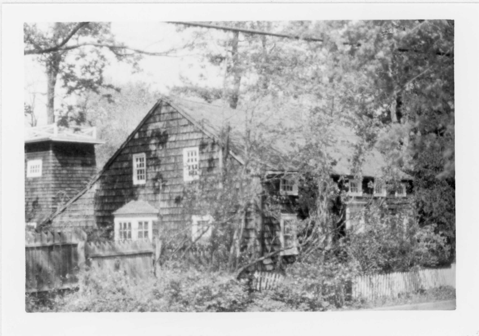
View from southeast