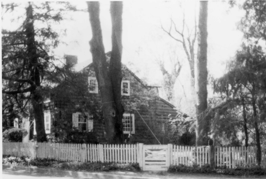
View from southwest

JOHN ROGERS HOUSE/ 627 HALF HOLLOW ROAD HALF HOLLOW HILLS