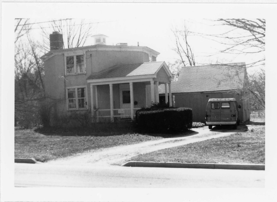
View from southeast