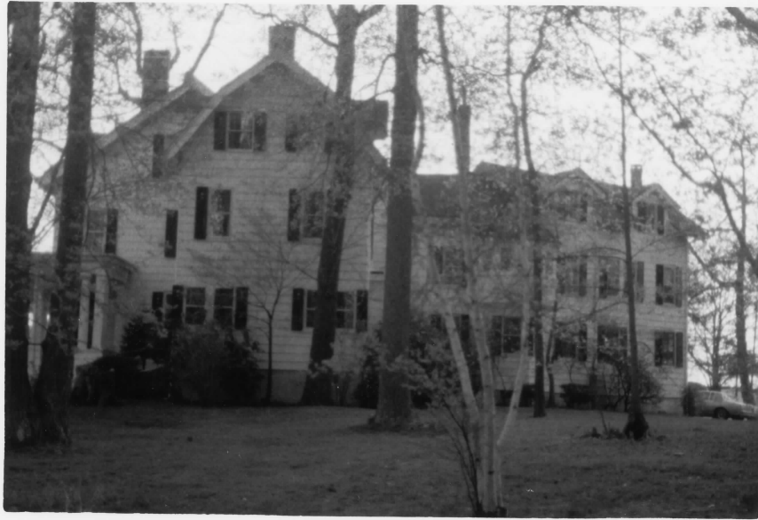
View from east

HUNTINGTON TOWN MULTIPLE RESOURCE AREA SUFFOLK COUNTY, NEW YORK PHOTOS: A.O'BRIEN, 1984 NEGATIVES: OPRHP JOHN GREEN HOUSE 167 EAST SHORE ROAD HUNTINGTON BAY