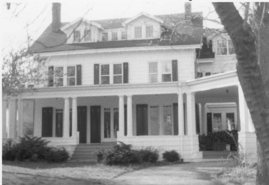
Close-up view of facade