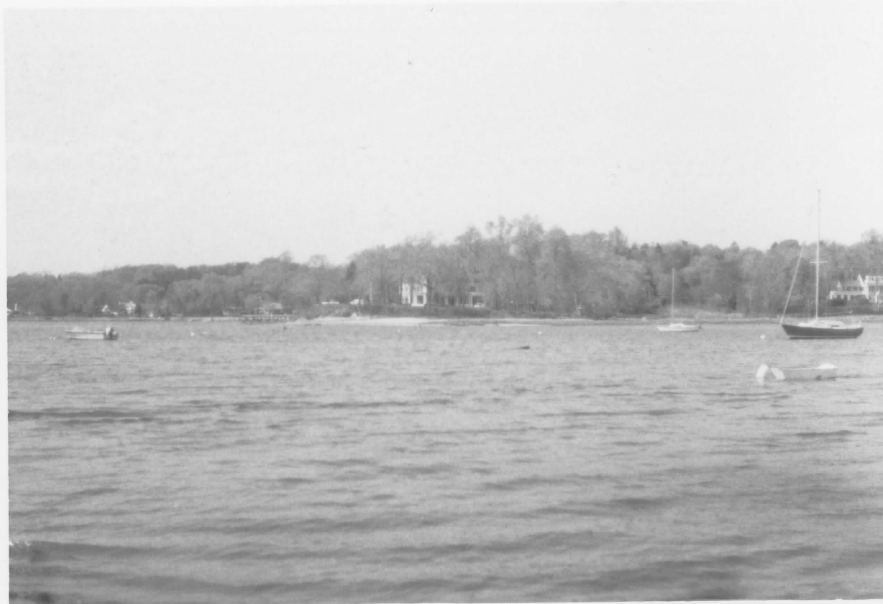
View of property from across Huntington Harbor