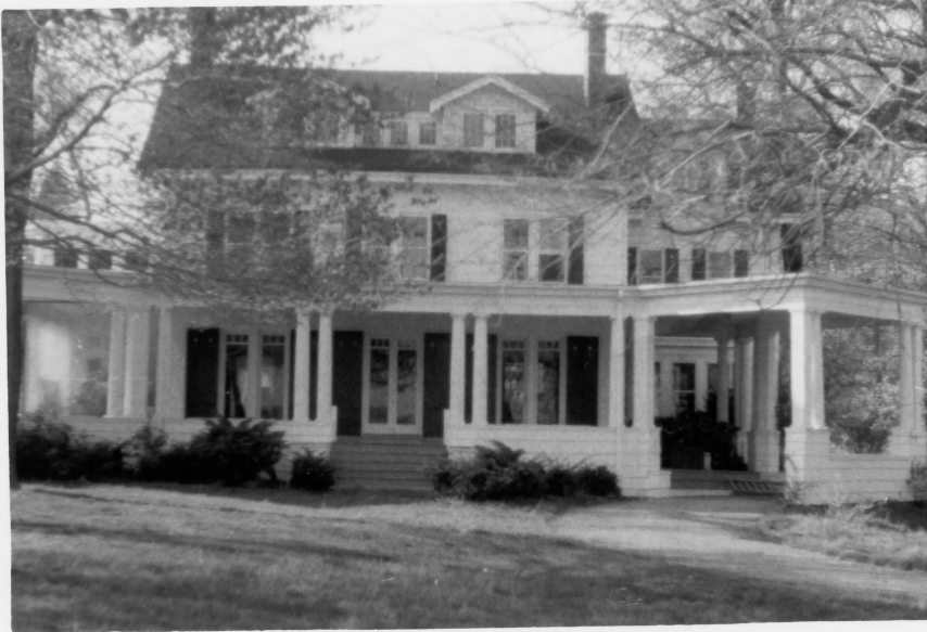
View from south

HUNTINGTON TOWN MULTIPLE RESOURCE AREA SUFFOLK COUNTY, NEW YORK PHOTOS: A.O'BRIEN, 1984 NEGATIVES: OPRHP JOHN GREEN HOUSE 167 EAST SHORE ROAD HUNTINGTON BAY