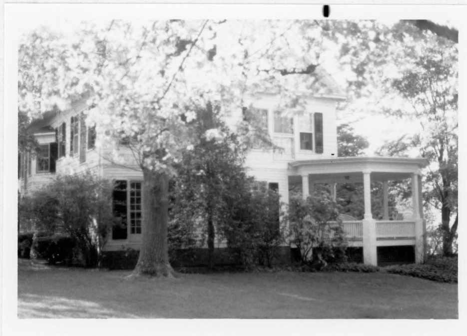
View from east