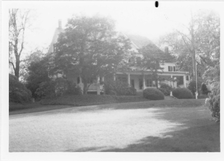
View from northeast

HUNTINGTON TOWN MULTIPLE RESOURCE AREA SUFFOLK COUNTY, NEW YORK PHOTOS: A.O'BRIEN, 1984 NEGATIVES: OPRHP GEOHEGAN HOUSE 9 HARBOR HILL DRIVE HUNTINGTON BAY