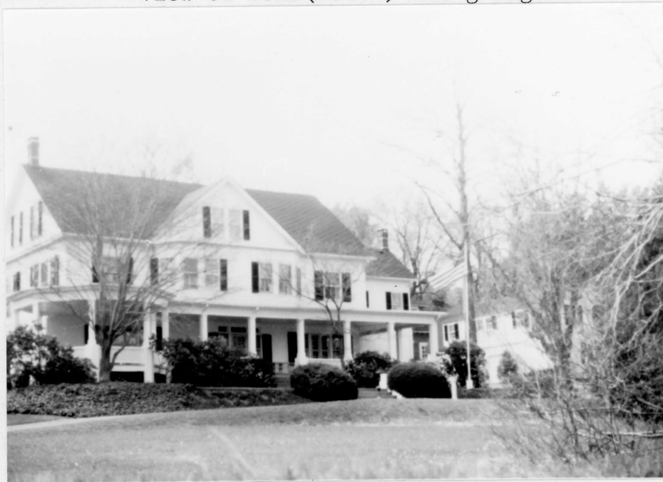
View of facade from northeast