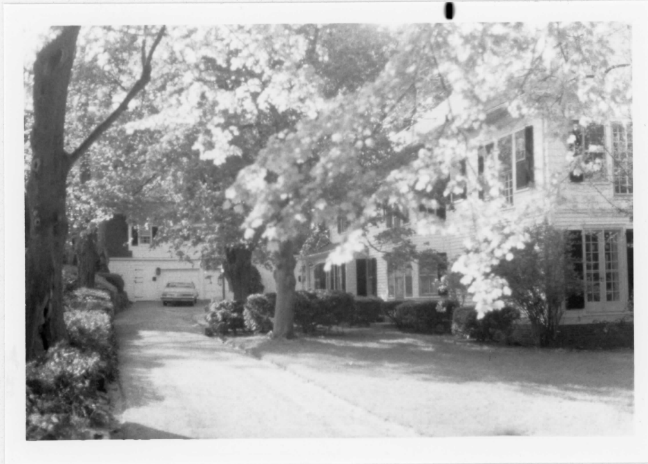
View of rear(south) and garage

HUNTINGTON TOWN MULTIPLE RESOURCE AREA SUFFOLK COUNTY, NEW YORK PHOTOS: A.O'BRIEN, 1984 NEGATIVES: OPRHP GEOHEGAN HOUSE 9 HARBOR HILL DRIVE HUNTINGTON BAY