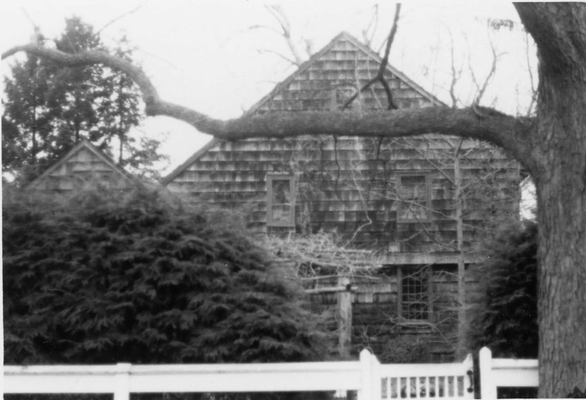
View from south