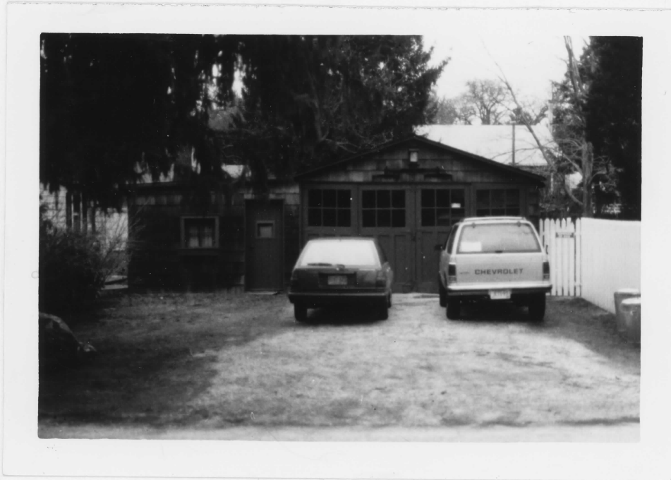
Garage to east

EZRA CARLL HOMESTEAD 49 MELVILLE ROAD HUNTINGTON STATION