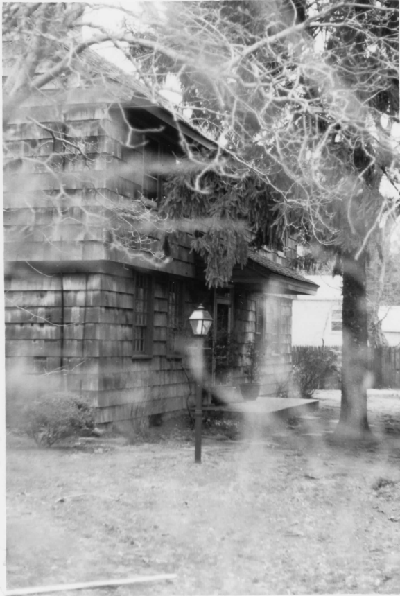
View from southeast

HUNTINGTON TOWN MULTIPLE RESOURCE AREA SUFFOLK COUNTY, NEW YORK EZRA CARLL HOMESTEAD 49 MELVILLE ROAD HUNTINGTON STATION