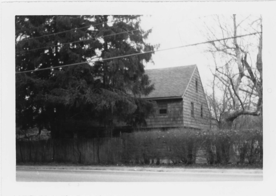
View from east

HUNTINGTON TOWN MULTIPLE RESOURCE AREA SUFFOLK COUNTY, NEW YORK 1984 EZRA CARLL HOMESTEAD 49 MELVILLE ROAD HUNTINGTON STATION