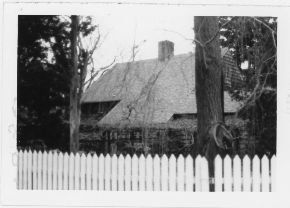
View from west