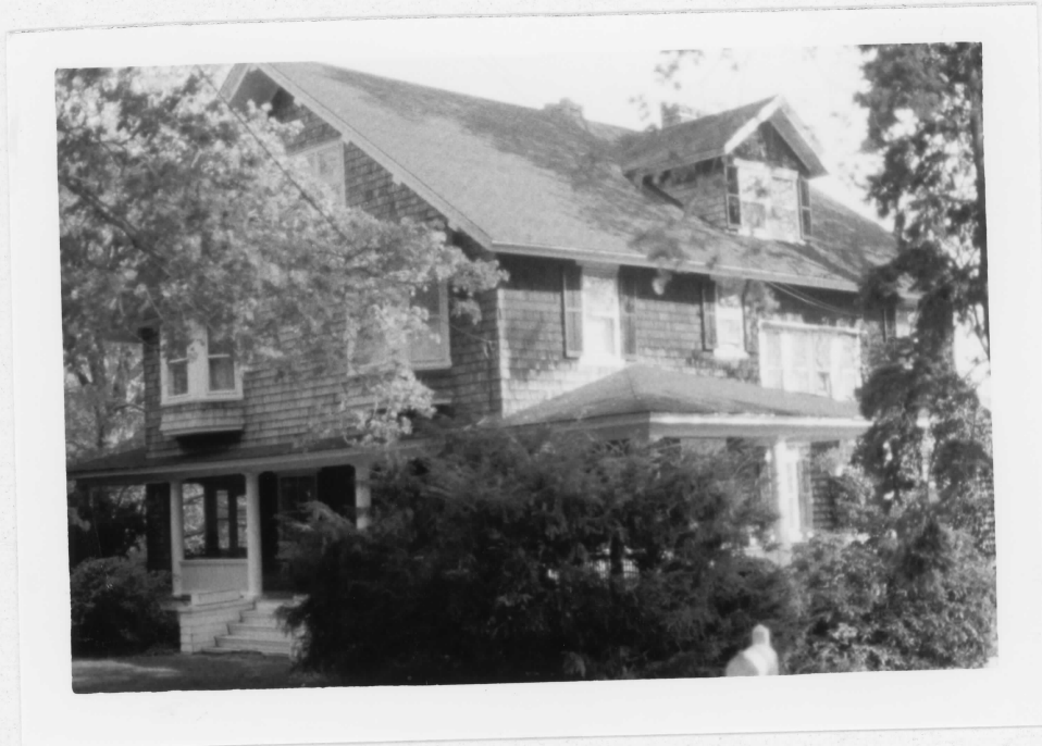
View from northwest