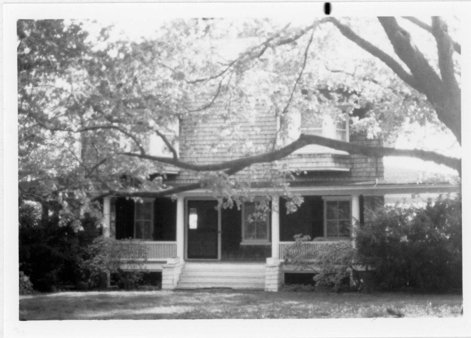
View from north

HUNTINGTON TOWN MULTIPLE RESOURCE AREA SUFFOLK COUNTY, NEW YORK PHOTOS: A.O'BRIEN, 1984 NEGATIVES: OPRHP BOWES HOUSE 15 HARBOR HILL DRIVE HUNTINGTON BAY