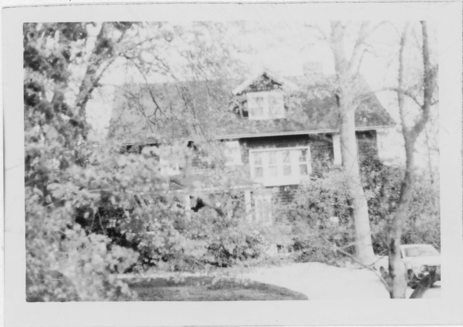
View from west

HUNTINGTON TOWN MULTIPLE RESOURCE AREA SUFFOLK COUNTY, NEW YORK PHOTOS: A.O'BRIEN, 1984 NEGATIVES: OPRHP BOWES HOUSE 15 HARBOR HILL DRIVE HUNTINGTON BAY