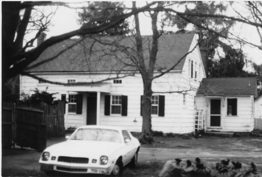
View from west

HUNTINGTON TOWN MULTIPLE RESOURCE AREA SUFFOLK COUNTY, NEW YORK PHOTOS: A.O'BRIEN, 1984 NEGATIVES: OPRHP M. BAYLIS HOUSE 530 SWEET HOLLOW ROAD MELVILLE