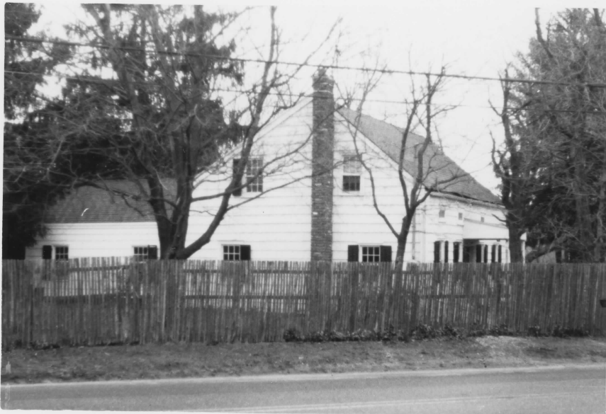
View from southwest