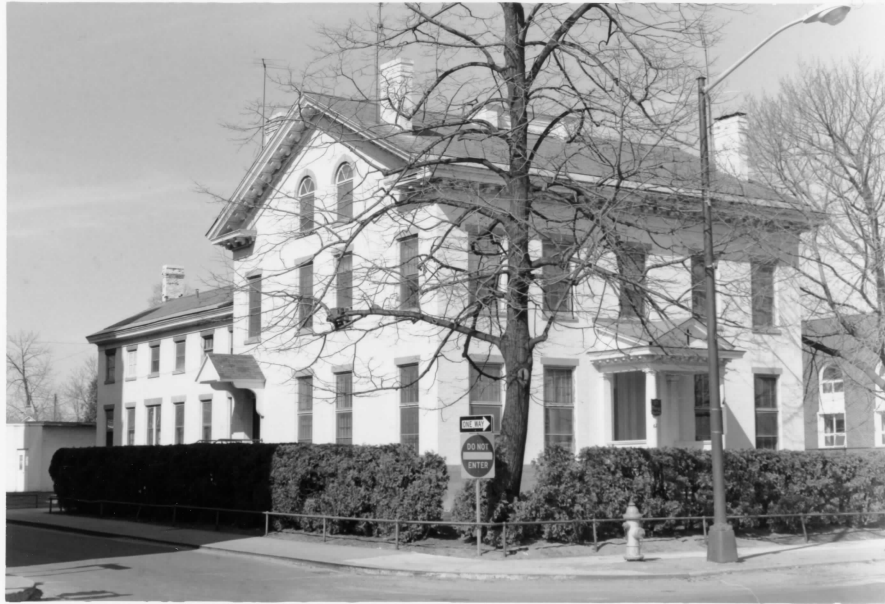
WEST AND SOUTH SIDES, LOOKING NORTH

ENOCH ROSEKRANS HOUSE 62 WARREN STREET Glens Falls MRA Warren Co. NY