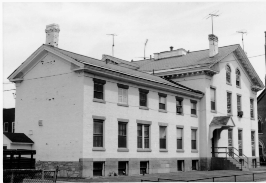
WEST SIDE, LOOKING SOUTHEAST