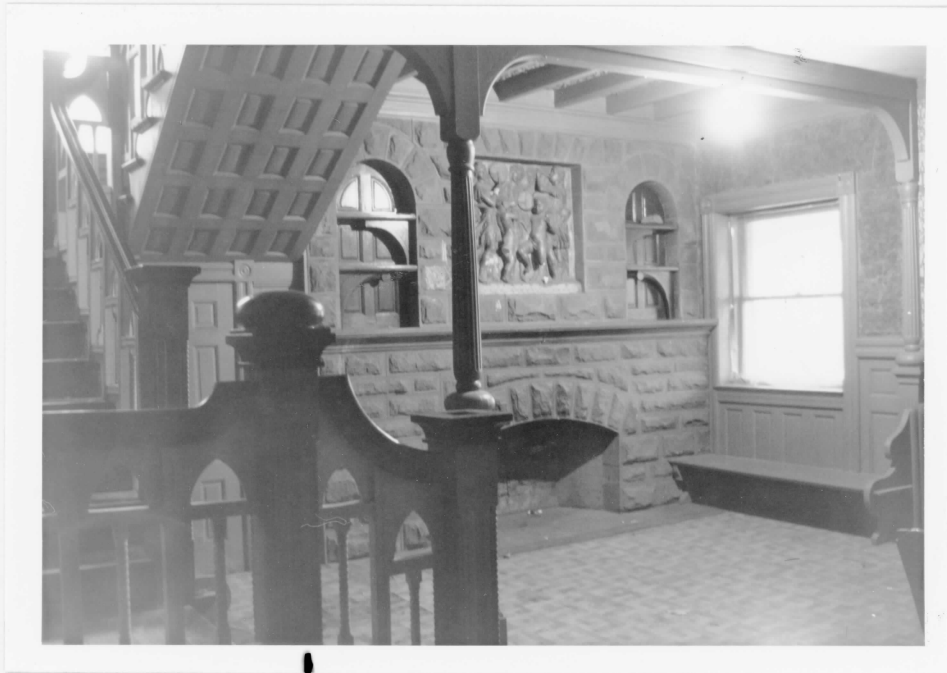
DETAIL, ENTRANCE/STAIR HALL