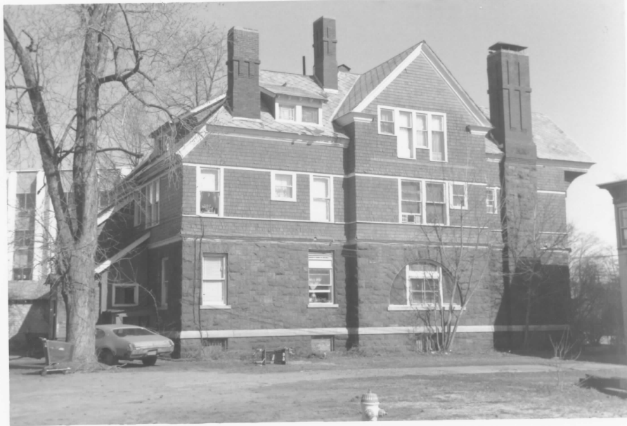
WEST SIDE, LOOKING EAST