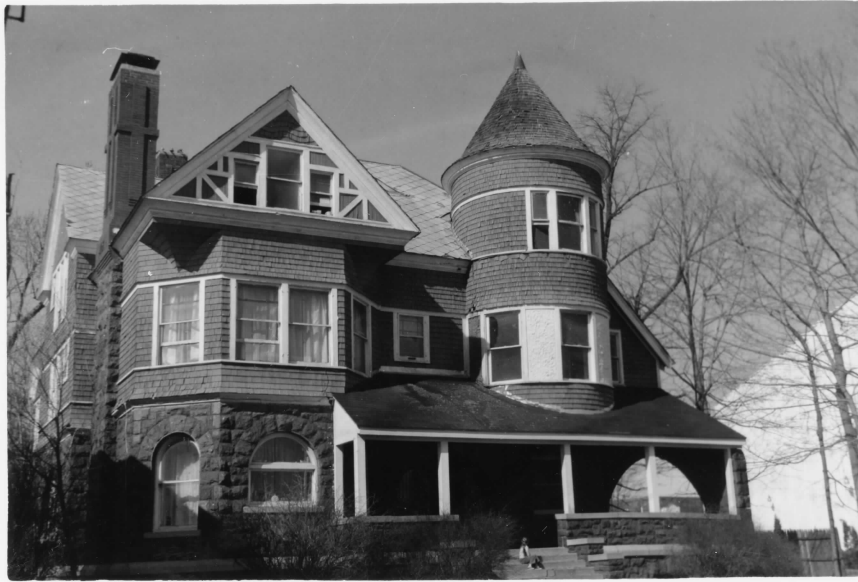
SOUTH ELEVATION, LOOKING NORTHEAST

DR. CHARLES A. FOSTER HOUSE 162-164 WARREN ST.