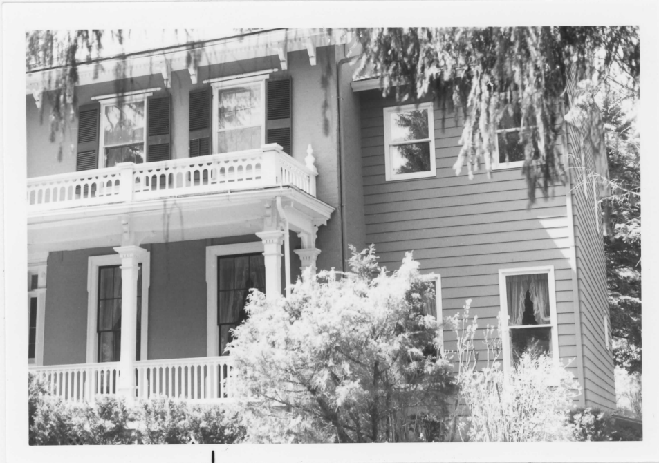
Detail of porch and rear wing