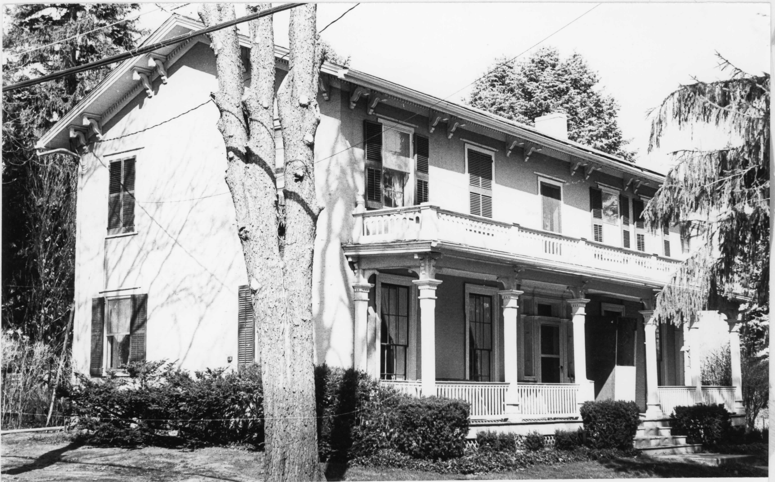
View of east (front) and south elevations