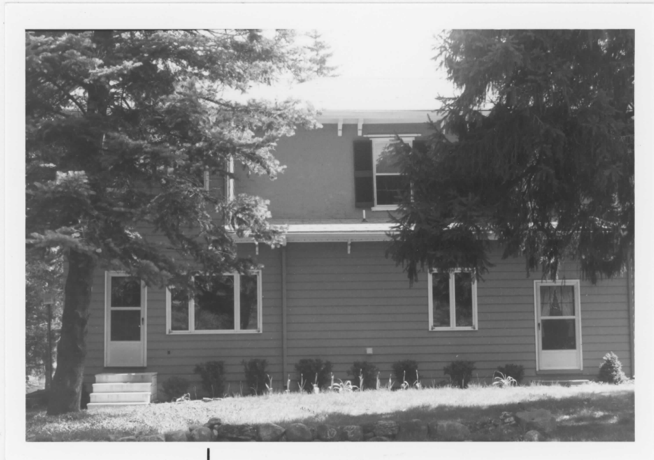
View of west elevation