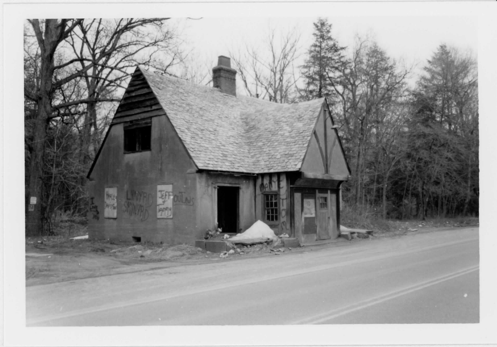
Views of toll house on the Bear Mountain Bridge Road (Rt 6/202) from the north and south

Historic Resources of the Hudson Highlands Bear Mountain Bridge Road (Rt.6/202) and toll house Westchester County, N.Y.