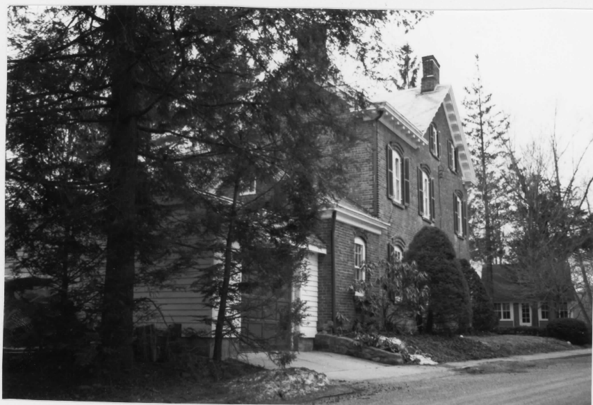
View of east or rear of house

Historic Resources of the Hudson Highlands Residence at 3 Crown Street Nelsonville, Putnam County, N.Y.