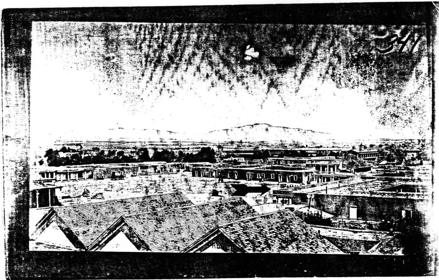
Juan Nepomuceno Garcia House