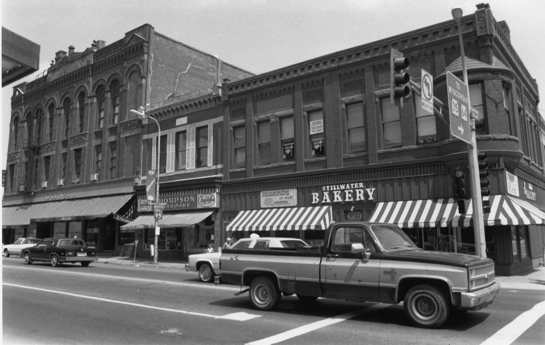
EAST SIDE OF SOUTH MAIN ST. FROM LEFT: 119, 125, 127, & 129 S. MAIN ST. STILLWATER HISTORIC COMMERCIAL DISTRICT STILLWATER, WASHINGTON CO., MN PHOTO # 010282-8