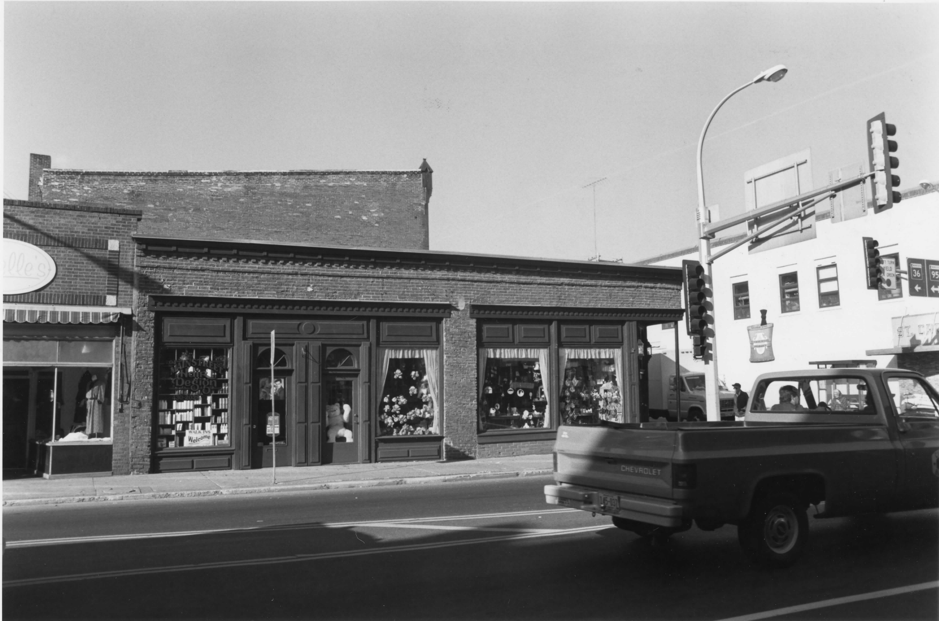
(COMMERCIAL BUILDING) 204 S. MAIN STILLWATER HISTORIC COMMERCIAL DISTRICT STILLWATER, WASHINGTON CO., MN PHOTO# 010067#3