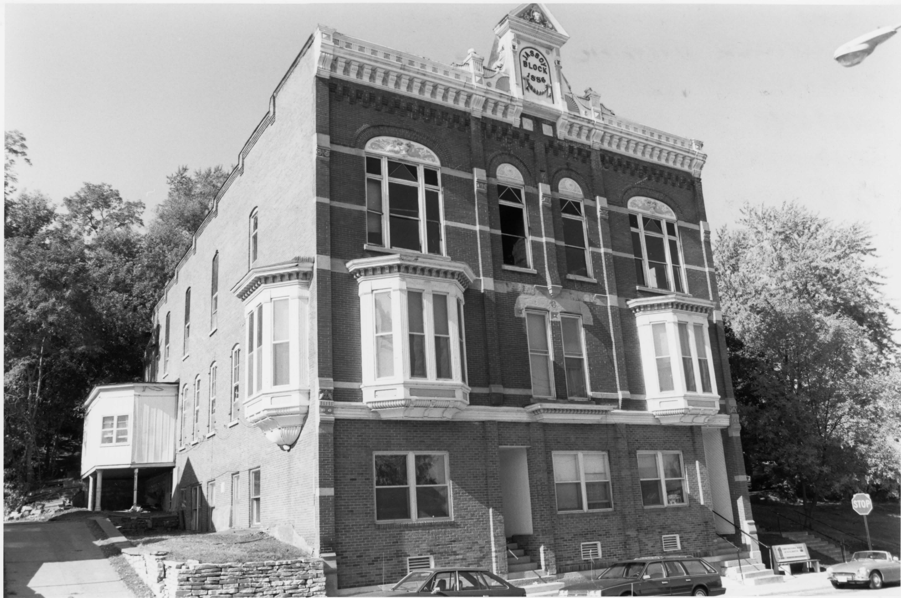
JASSOY BLOCK, 200 S. THIRD STILLWATER 'HISTORIC COMMERCIAL DISTRICT STILLWATER, WASHINGTON CO., MN PHOTO # 010065 - 6