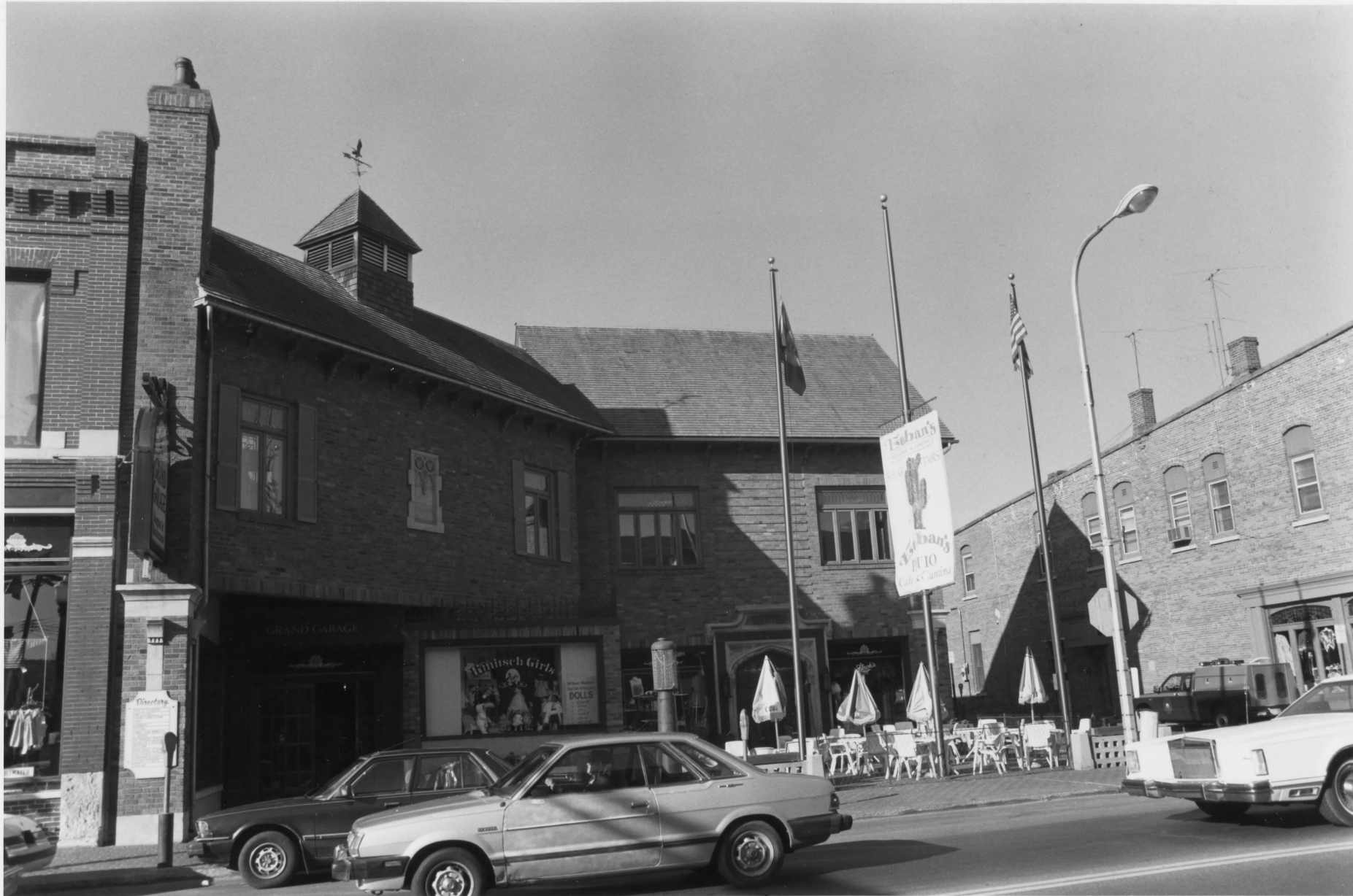
GRAND GARAGE, 324 S. MAIN (NON-CONTRIBUTING) STILLWATER HISTORIC COMMERCIAL DISTRICT STILLWATER, WASHINGTON CO., MN PHOTO # 010066-12