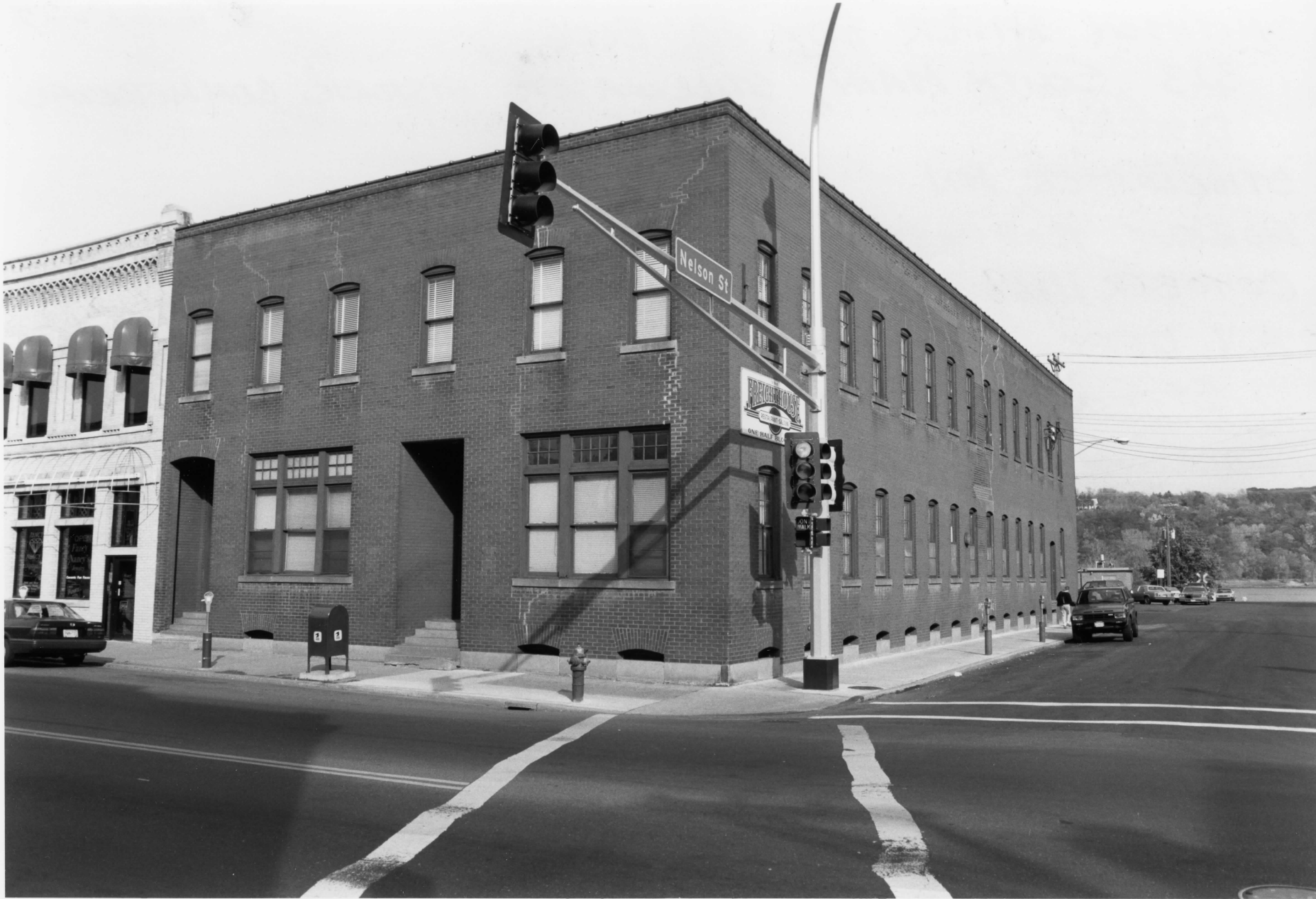
SMITHSON PAPER BOX CO., 323 S. MAIN STILLWATER HISTORIC COMMERCIAL DISTRICT STILLWATER, WASHINGTON CO., MN PHOTO I.D. # 010068-17