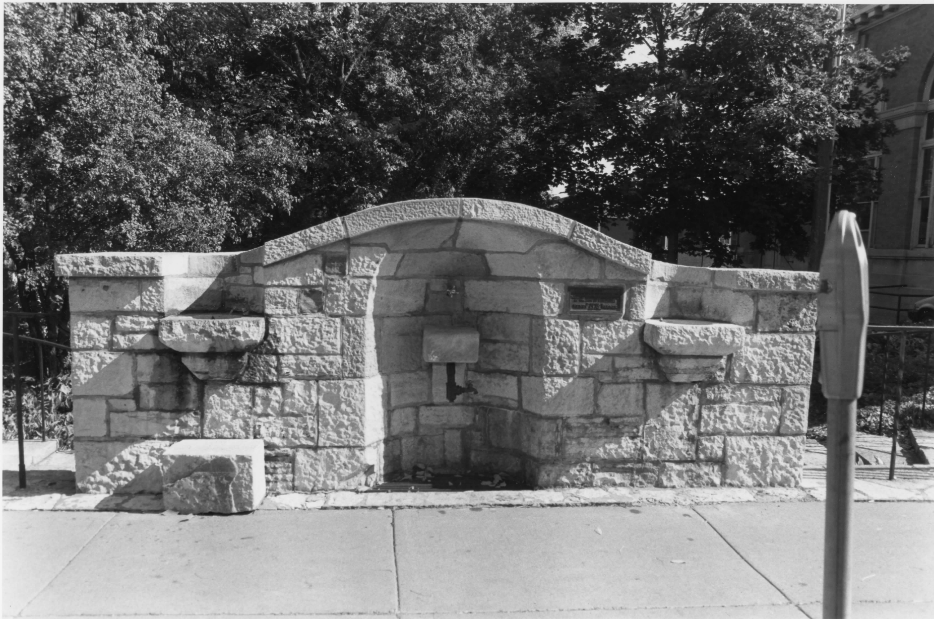
H.C. FARMER SUNKEN GARDEN FOUNTAIN, 113 N. SECOND STILLWATER HISTORIC COMMERCIAL DISTRICT STILLWATER, WASHINGTON CO., MN