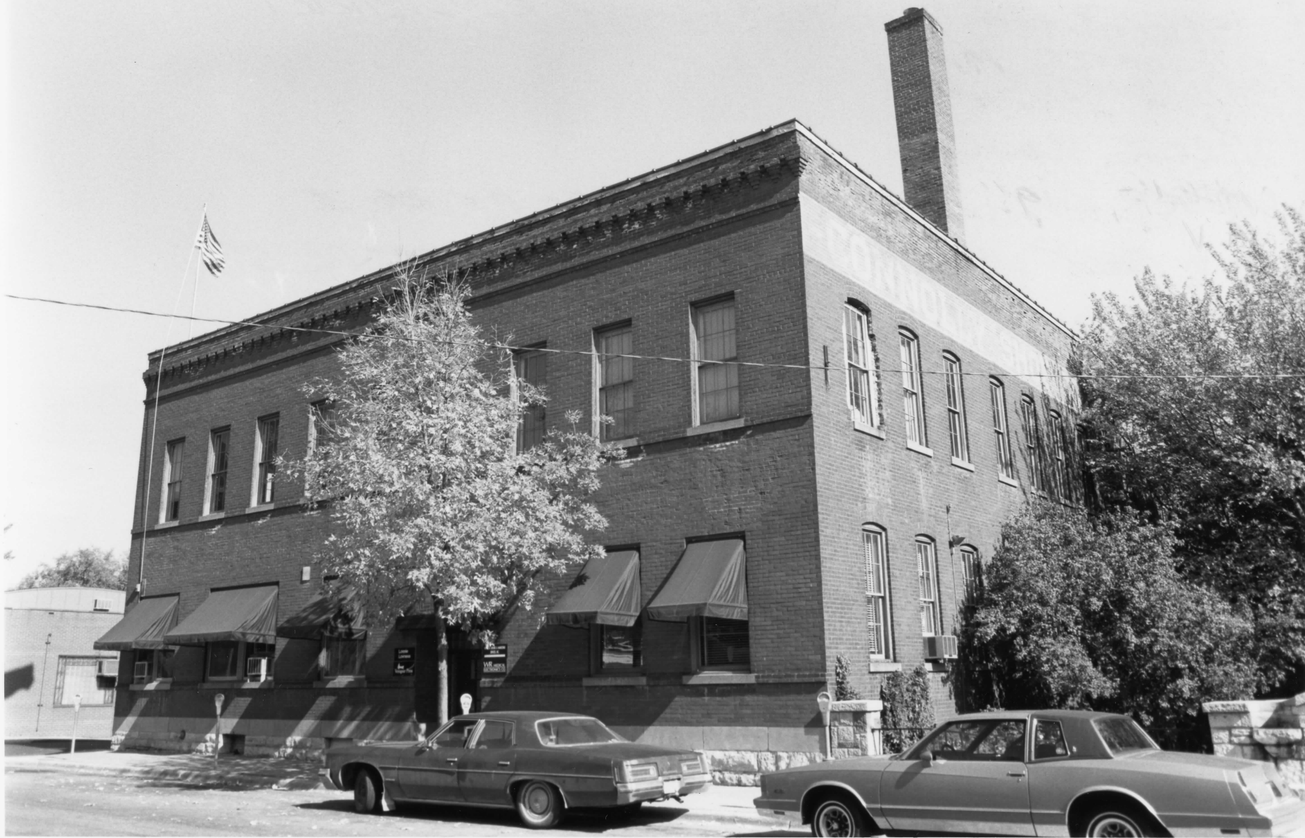
CONNOLLY SHOE CO. BLDG., 123 N. SECOND STILLWATER HISTORIC COMMERCIAL DISTRICT STILLWATER, WASHINGTON CO., MN PHOTO # 010065 - 18