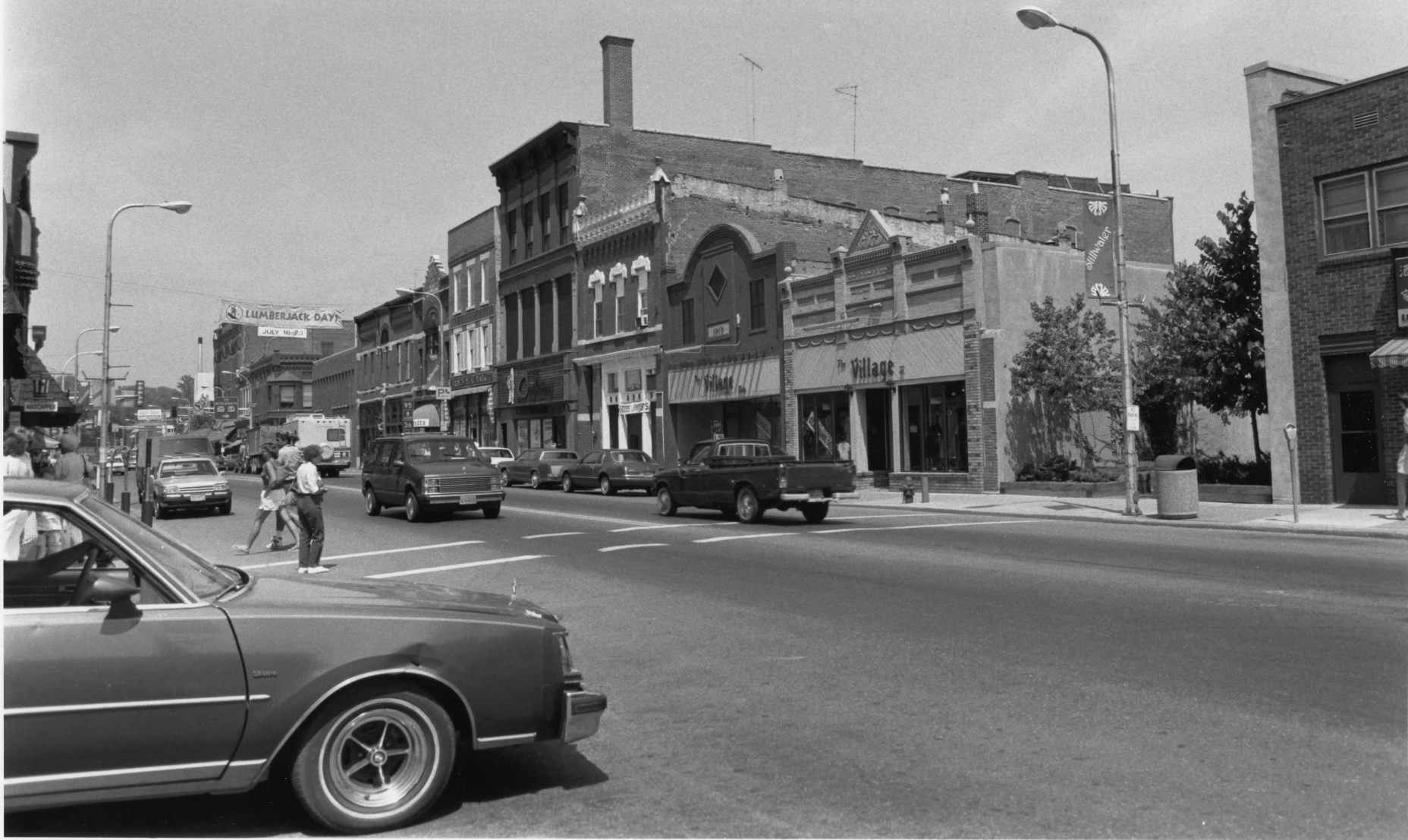
EAST SIDE OF SOUTH MAIN ST., FROM EAST OLIVE STILLWATER HISTORIC COMMERCIAL DISTRICT STILLWATER, WASHINGTON CO., MN PHOTO # 010282 - 10