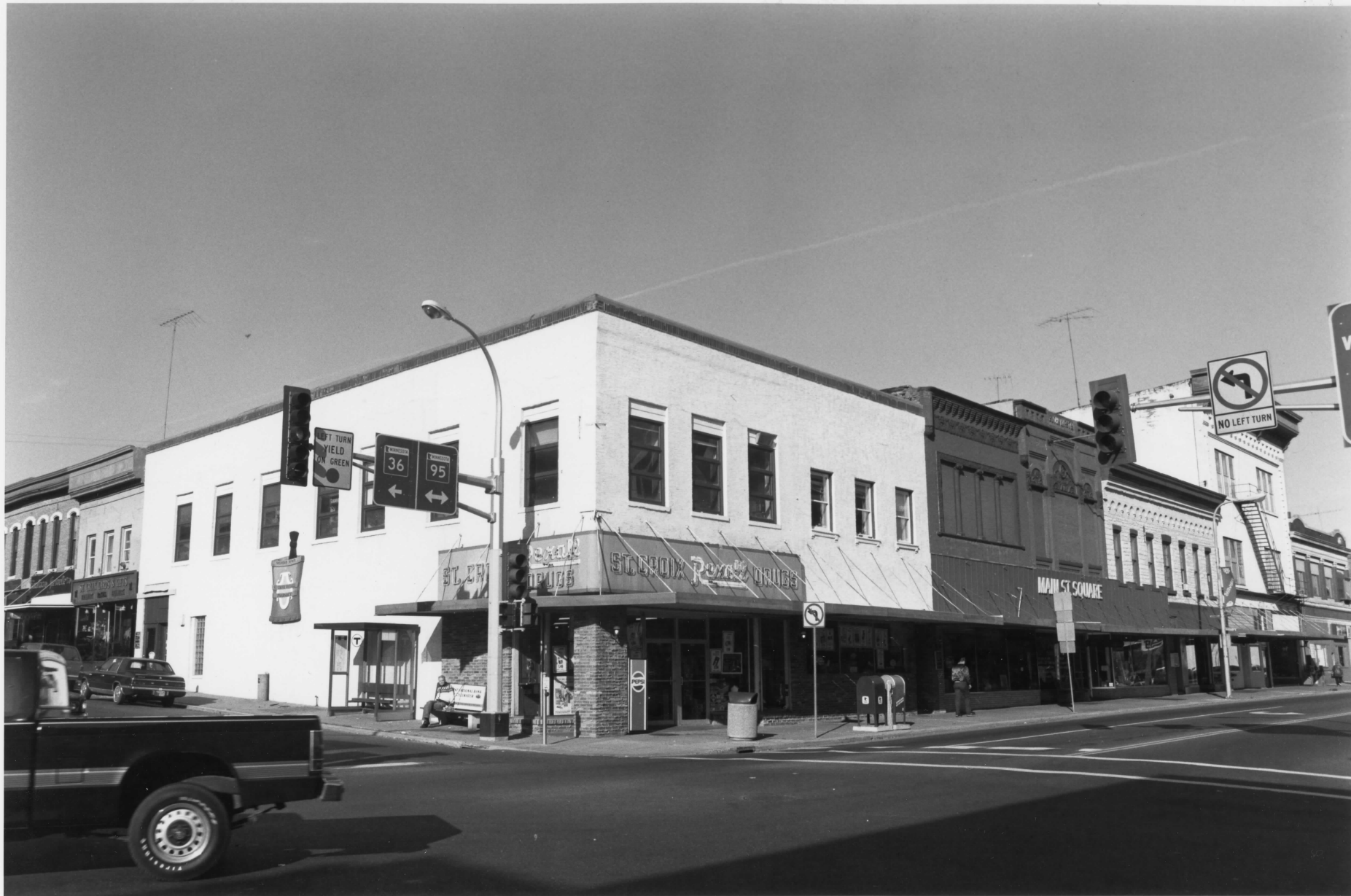
(COMMERCIAL BUILDING) 132 S. MAIN (NON-CONTRIBUTING) STILLWATER HISTORIC COMMERCIAL DISTRICT STILLWATER, WASHINGTON CO., MN PHOTO # 010067-4