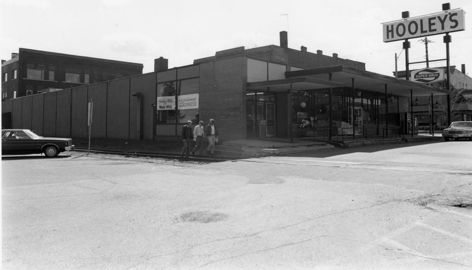
(HOOLEY'S MARKET) 127 S. WATER (NON-CONTRIBUTING) STILLWATER HISTORIC COMMERCIAL DISTRICT STILLWATER, WASHINGTON CO., MN PHOTO # 010044-4