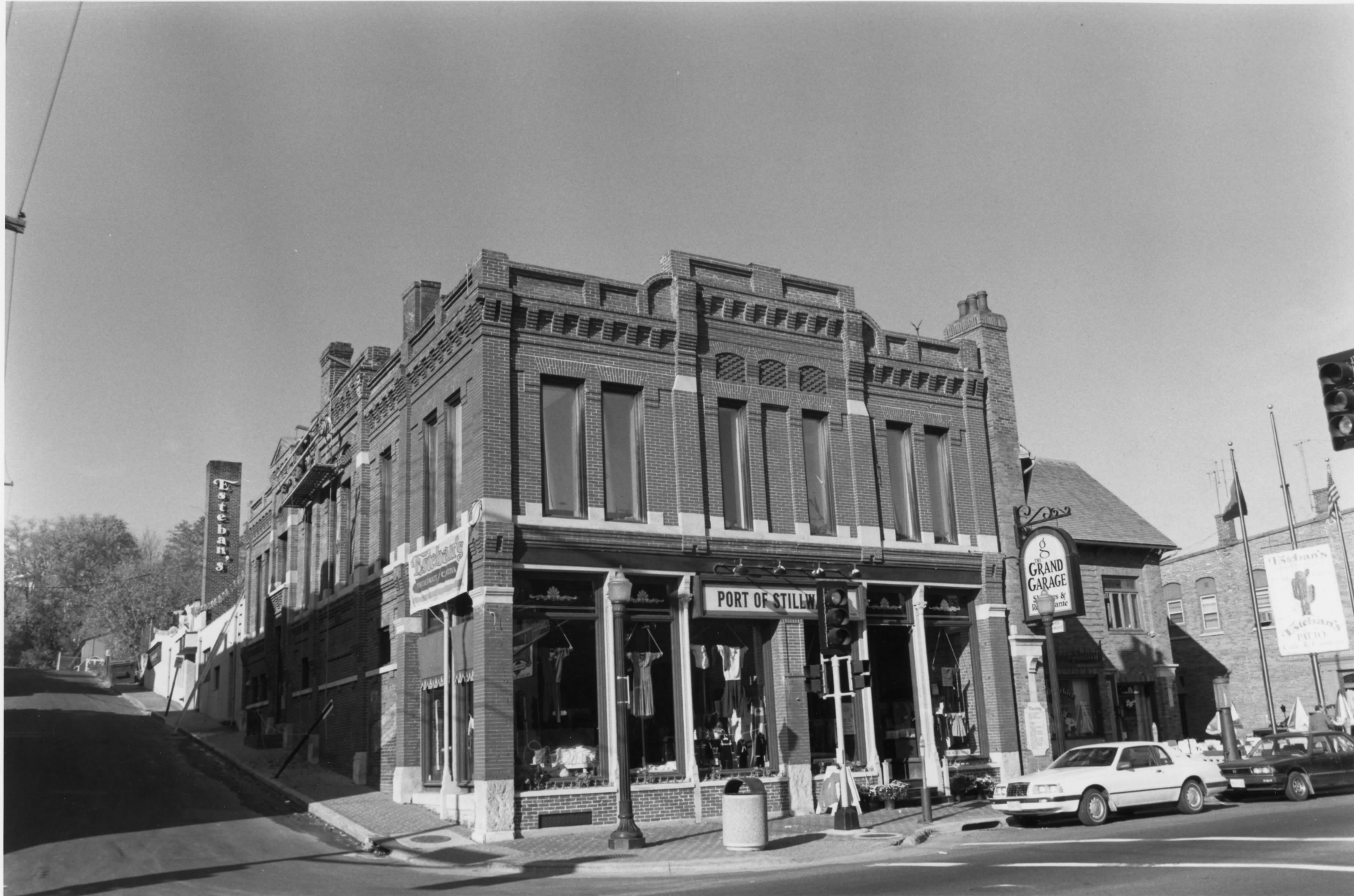
(COMMERCIAL BUILDING) 330 S. MAIN STILLWATER HISTORIC COMMERCIAL DISTRICT STILLWATER, WASHINGTON CO., MN PHOTO # 010066 - 11