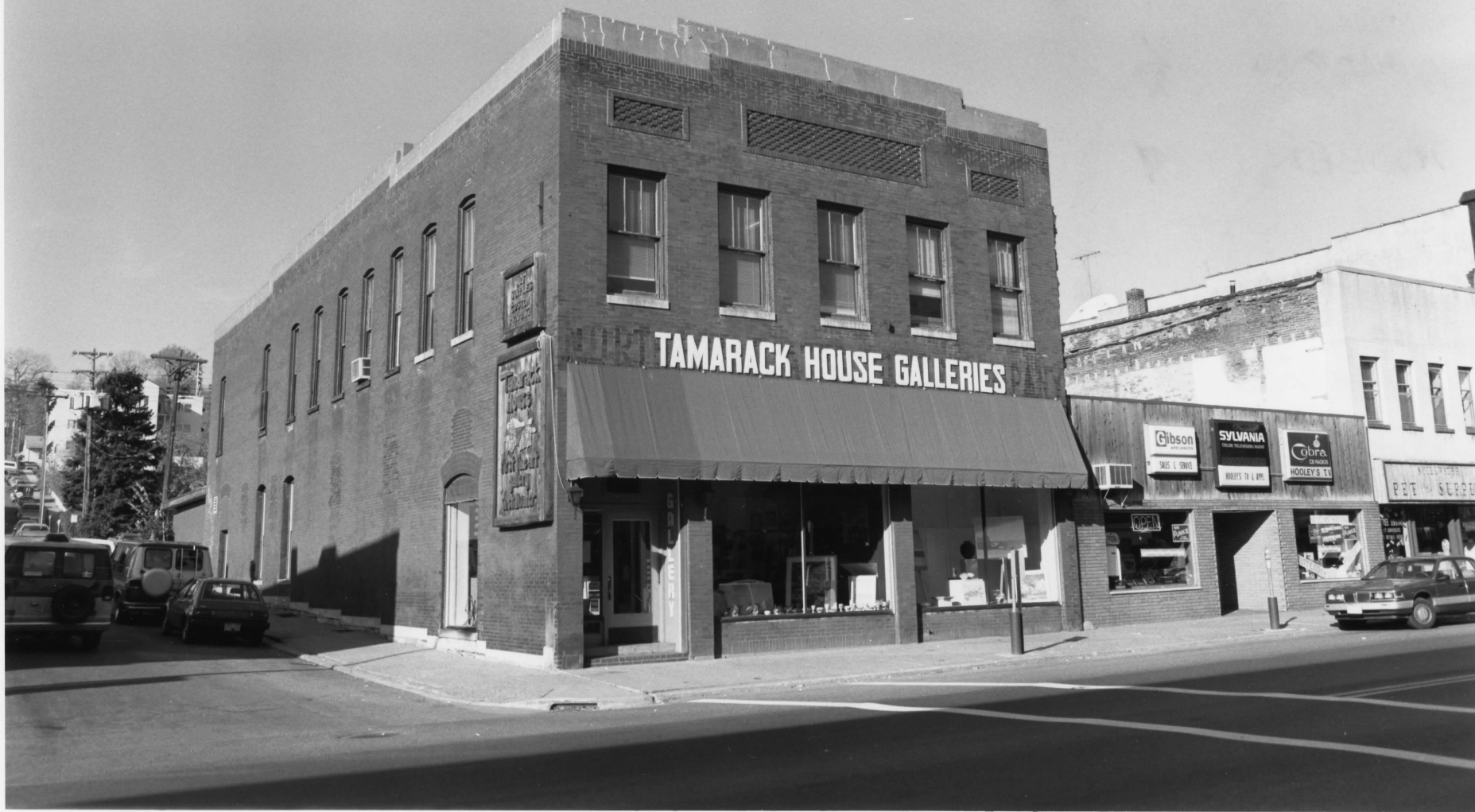
NORTHERN STATES POWER DIVISION OFFICES, 236 S. MAIN STILLWATER HISTORIC COMMERCIAL DISTRICT STILLWATER, WASHINGTON CO., MN PHOTO # 010066-17