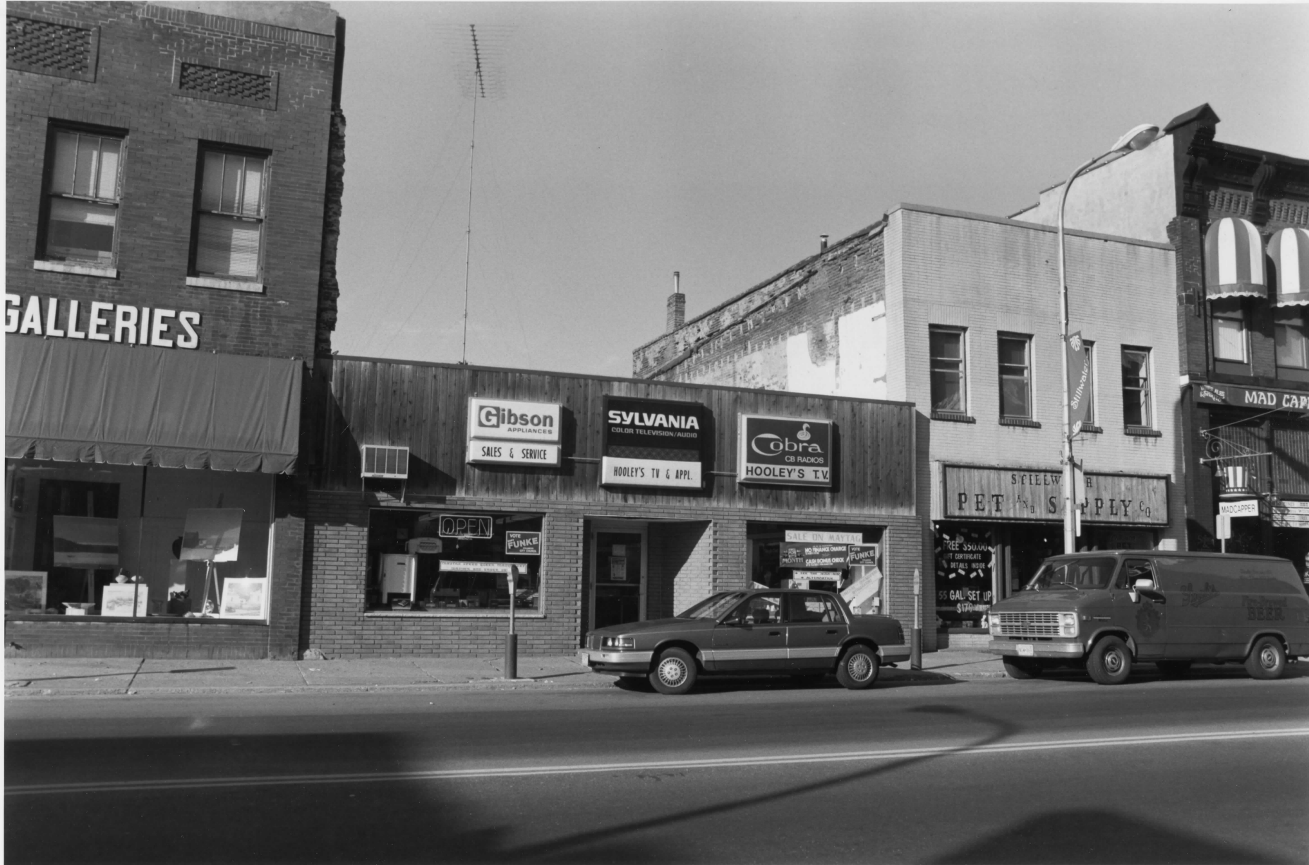
(COMMERCIAL BUILDING) 232 S. MAIN (NON-CONTRIBUTING) STILLWATER HISTORIC COMMERCIAL DISTRICT STILLWATER, WASHINGTON CO., MN PHOTO # 010066-18