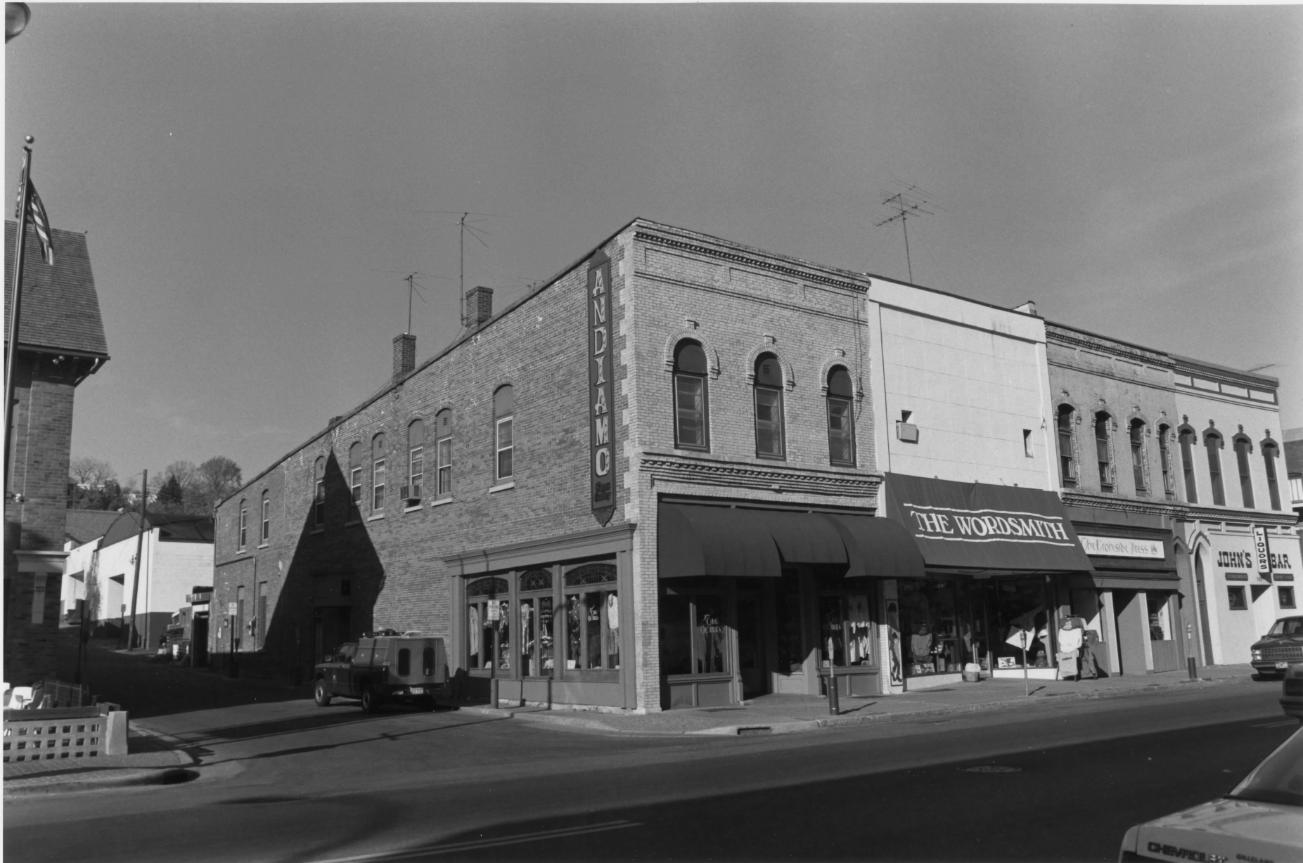
UNION BLOCK, FROM LEFT: 312, 310 (NON-CONTRIBUTING), 308, & 302 S. MAIN ST. STILLWATER, HISTORIC COMMERCIAL DISTRICT STILLWATER, WASHINGTON CO., MN