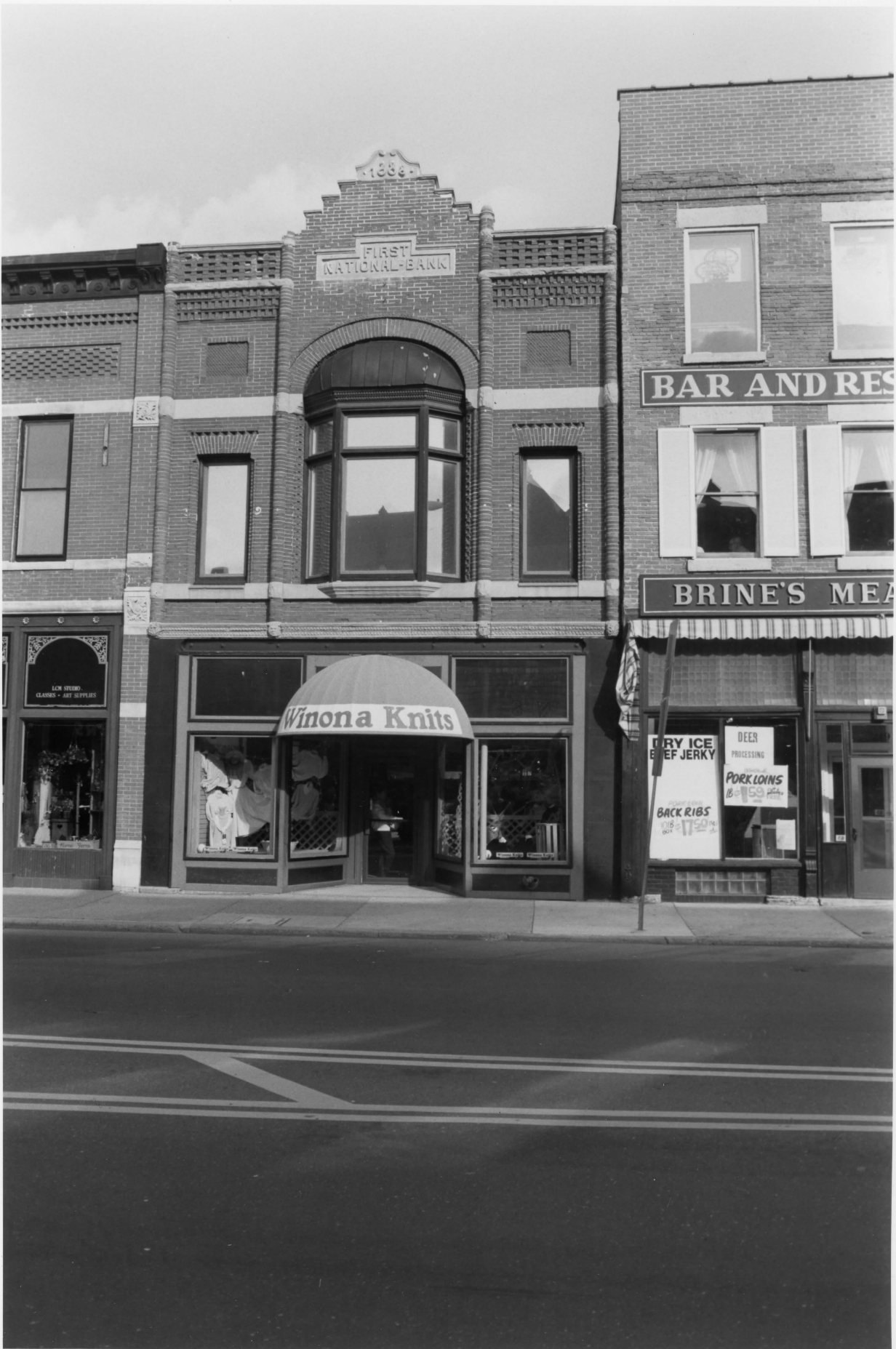
FIRST NATIONAL BANK BUILDING, 215 S. MAIN STREET, WINONA, MINN. COMMERCIAL DISTRICT PHOTO # 010069-5