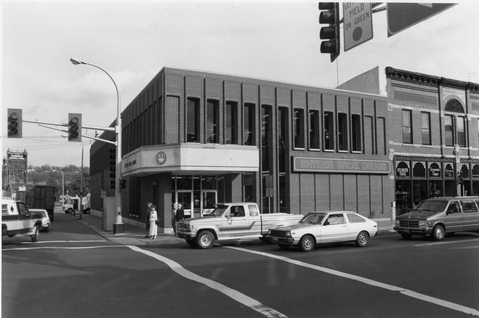
REED'S BLOCK, 201 S. MAIN (NON-CONTRIBUTING) STILLWATER HISTORIC COMMERCIAL DISTRICT STILLWATER, WASHINGTON CO., MN PHOTO* 010069#7