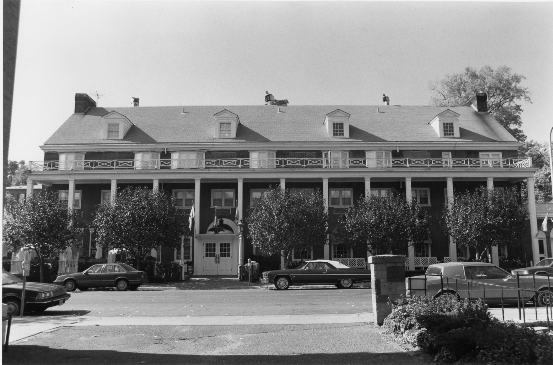
LOWELL INN, 102 N. SECOND STILLWATER HISTORIC COMMERCIAL DISTRICT STILLWATER, WASHINGTON CO., MN PHOTO # 010065-16