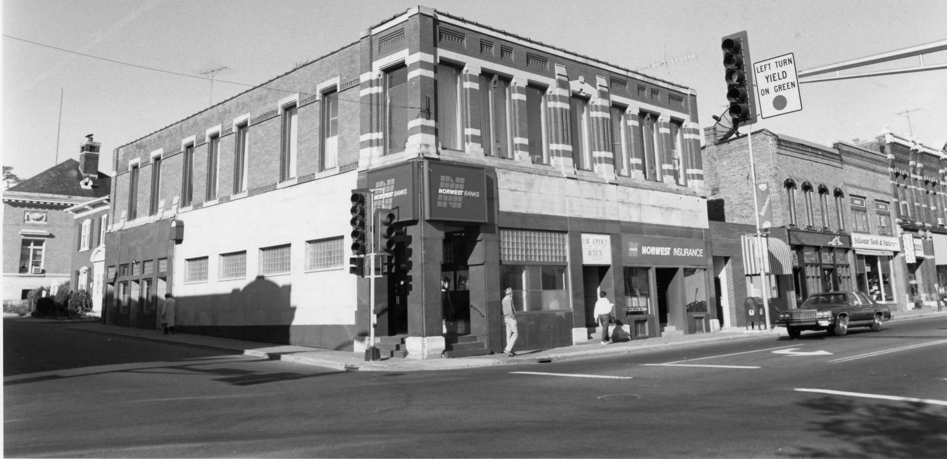
MCKUSICK BLOCK, 102-106 N. MAIN (NON CONTRIBUTING) STILLWATER HISTORIC COMMERCIAL DISTRICT STILLWATER, WASHINGTON CO., MN PHOTO # 010067-10