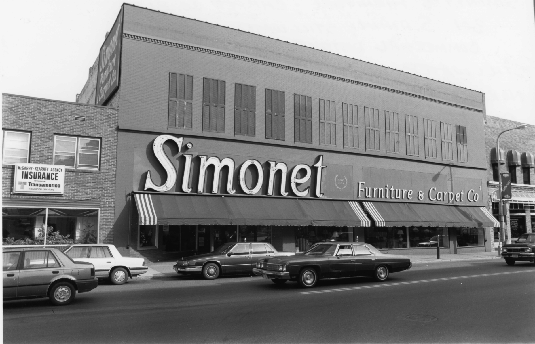
SIMONET FURNITURE; CARPET CO. BLDG., 301 S. MAIN STILLWATER HISTORIC COMMERCIAL DISTRICT STILLWATER, WASHINGTON CO., MN PHOTO # 010068-20