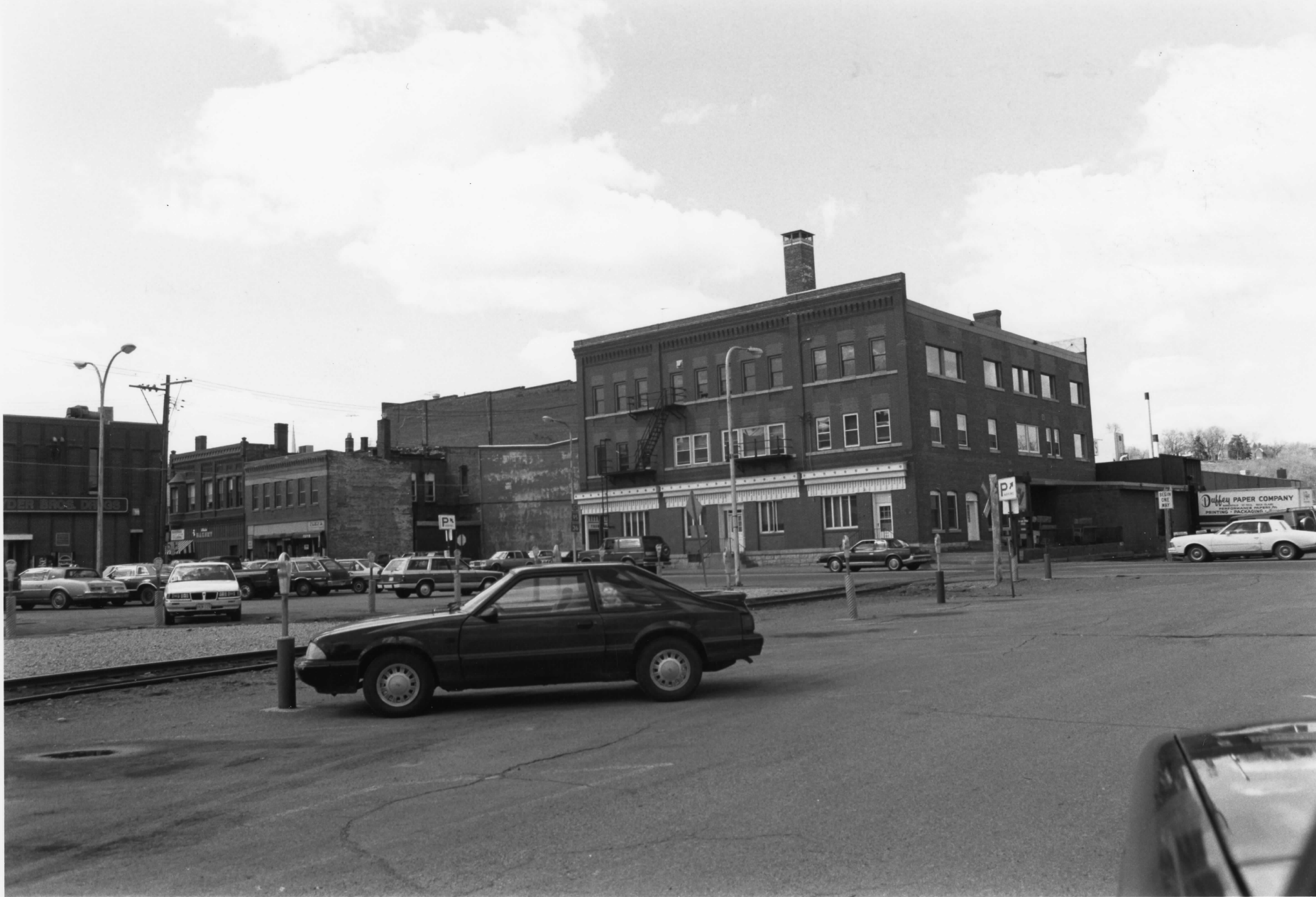
LUMBERMAN'S EXCHANGE, 113-121 S. WATER STILLWATER HISTORIC COMMERCIAL DISTRICT STILLWATER, WASHINGTON CO, MN PHOTO # 010044-5