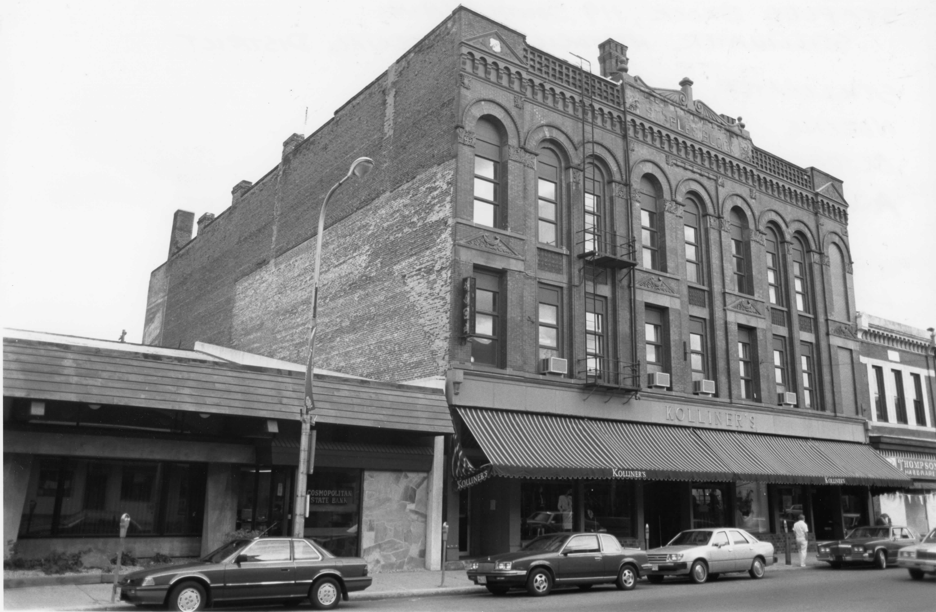
STAPLES BLOCK, 119 S. MAIN ST. (AT LEFT: 101 S. MAIN, NON-CONTRIBUTING) STILLWATER HISTORIC COMMERCIAL DISTRICT STILLWATER, WASHINGTON CO., MN PHOTO # 010069-12