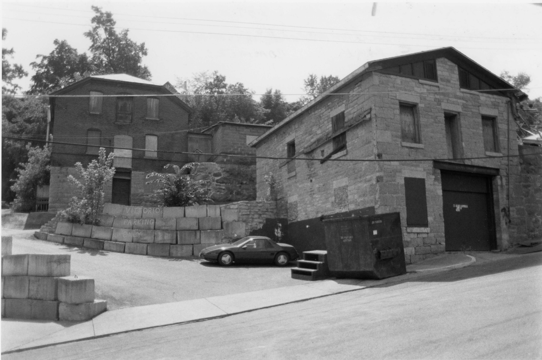
BARN & STORAGE BUILDING, 211½ : 239 E. NELSON STILLWATER HISTORIC COMMERCIAL DISTRICT STILLWATER, WASHINGTON CO., MN PHOTO # 010282-5