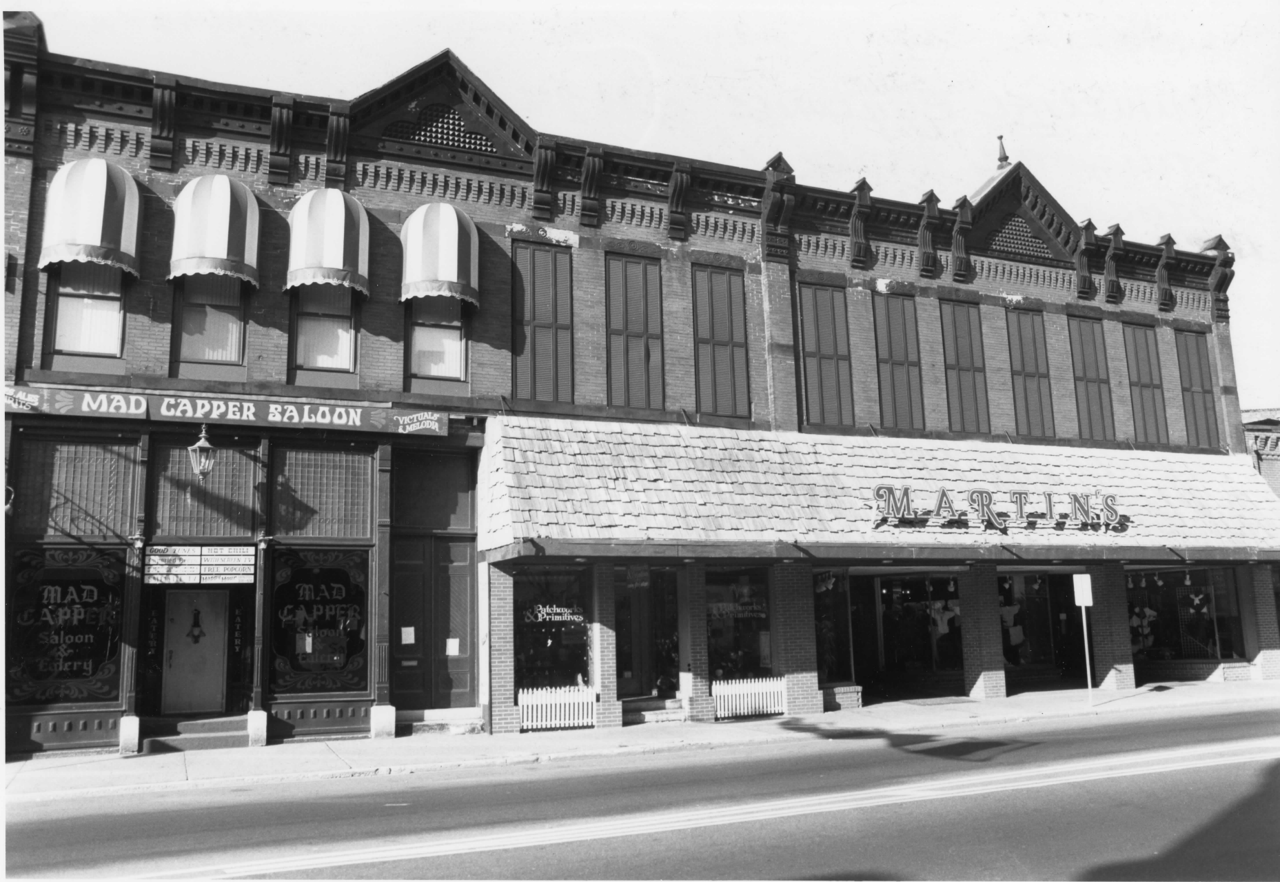
(COMMERCIAL BLDG.) LEFT: 224 S. MAIN ST., RIGHT: 214-218 S. MAIN ST. STILLWATER HISTORIC COMMERCIAL DISTRICT STILLWATER, WASHINGTON CO., MN PHOTO # 010066-22