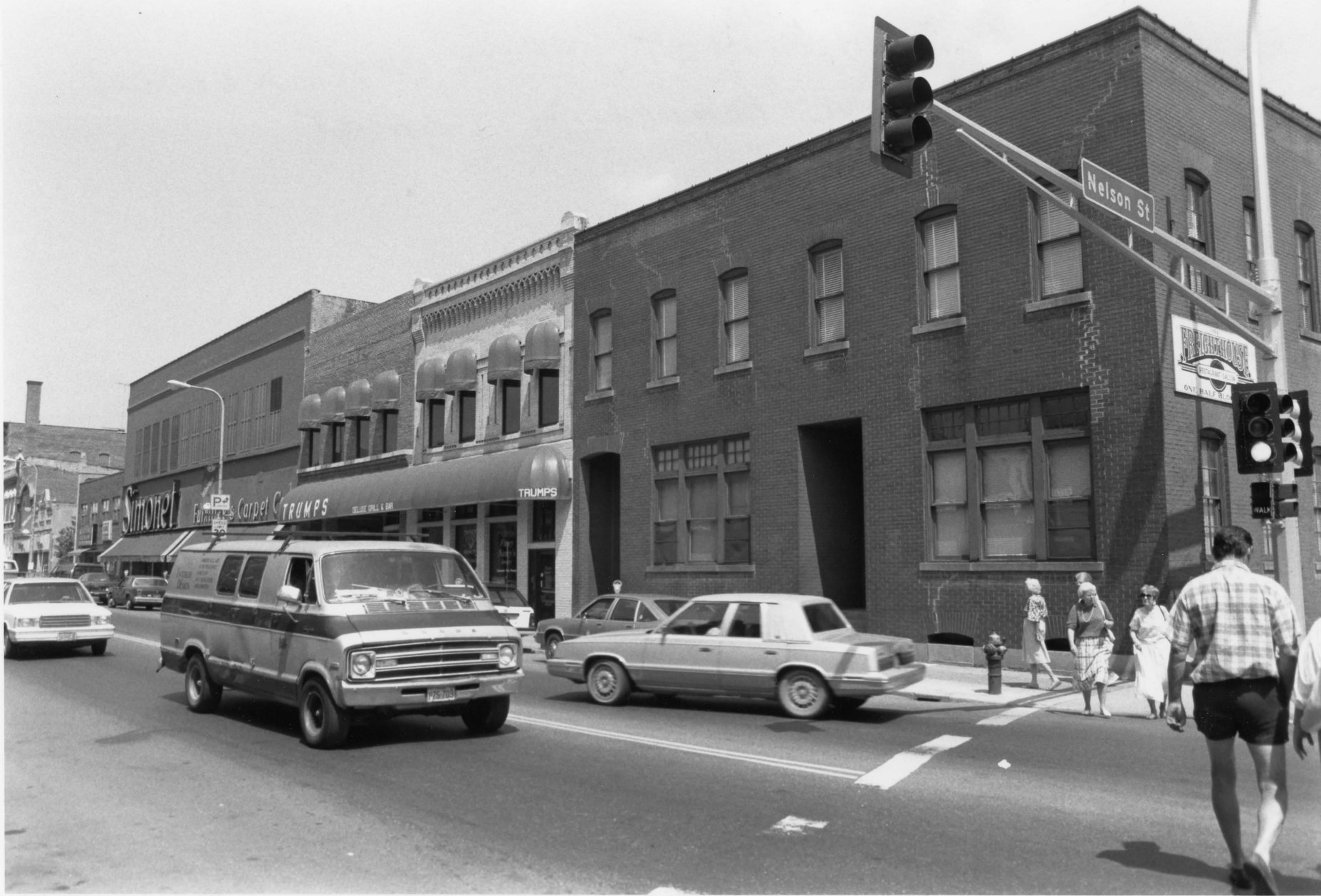
EAST SIDE OF SOUTH MAIN ST., FROM EAST NELSON STILLWATER HISTORIC COMMERCIAL DISTRICT STILLWATER, WASHINGTON CO., MN