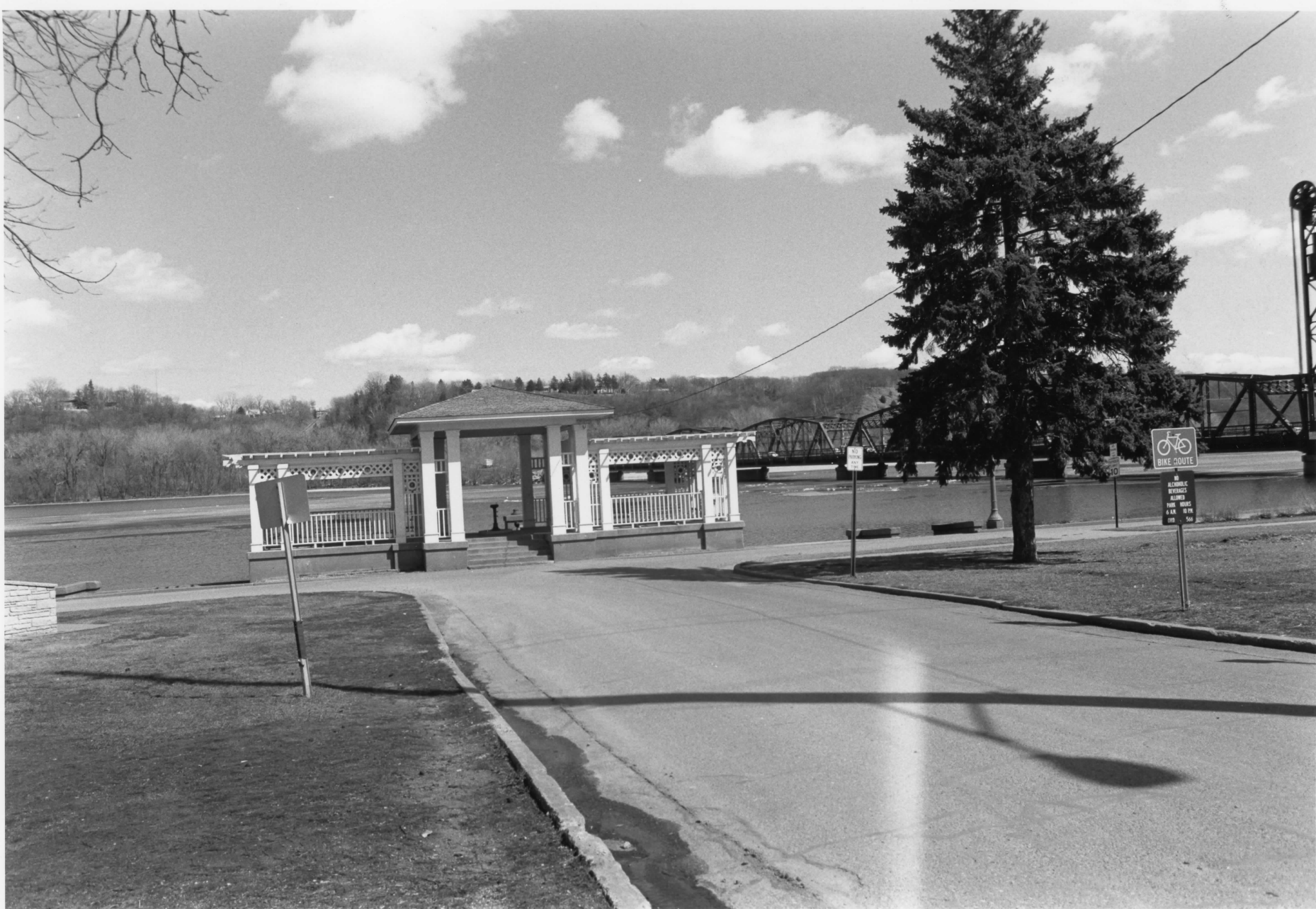
LOWELL PARK & PAVILION STILLWATER HISTORIC COMMERCIAL DISTRICT STILLWATER, WASHINGTON CO., MN PHOTO # 010044-1