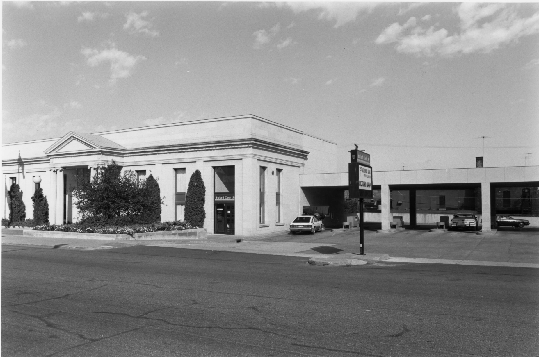
BANK ADDITION, 213 E. CHESTNUT. (NON-CONTRIBUTING) STILLWATER HISTORIC COMMERCIAL DISTRICT STILLWATER, WASHINGTON CO., MN PHOTO # 010063-14