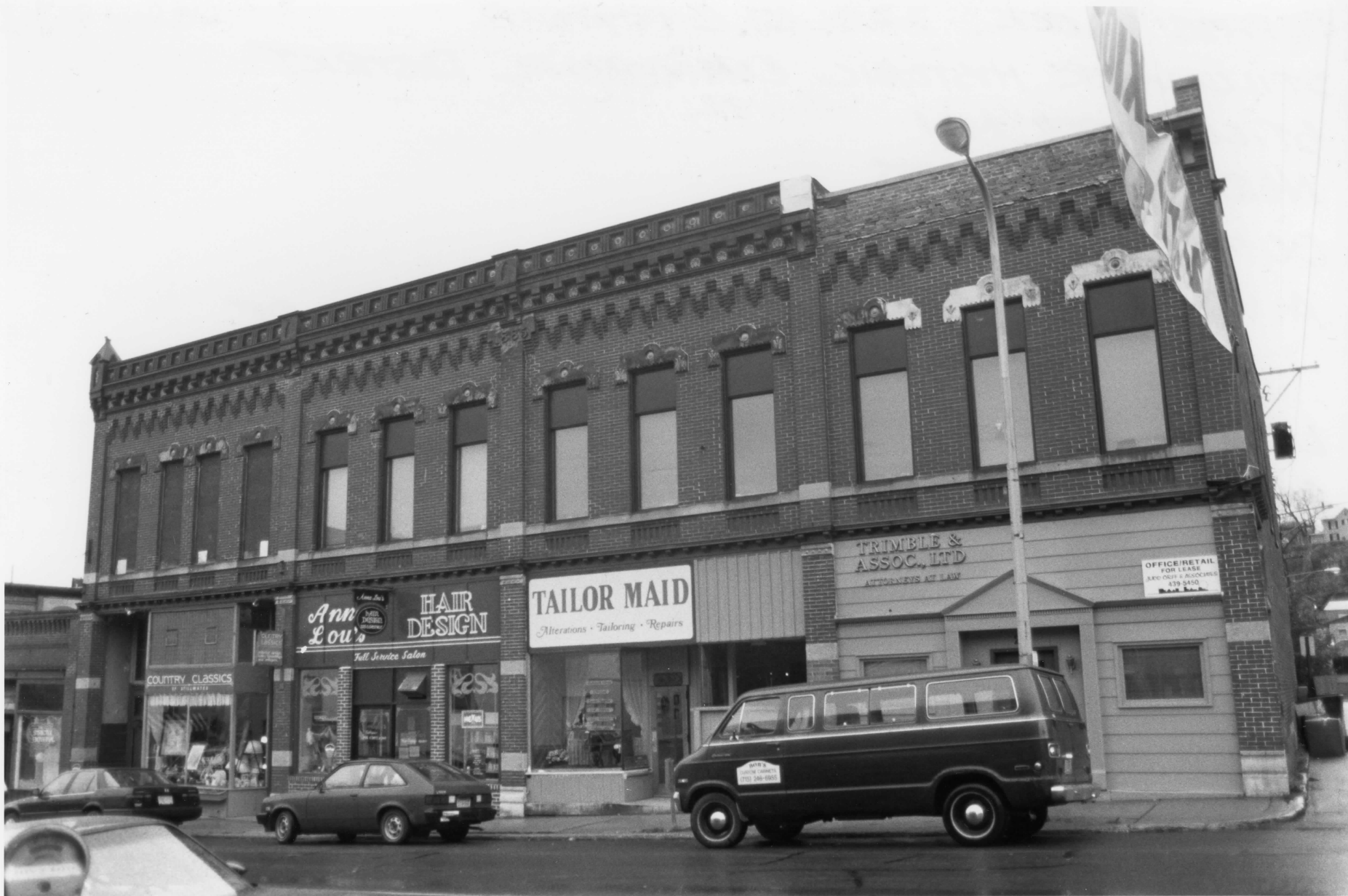
TEPASS BLOCK, 223 E. CHESTNUT STILLWATER HISTORIC COMMERCIAL DISTRICT STILLWATER, WASHINGTON CO., MN PHOTO # 010070-3