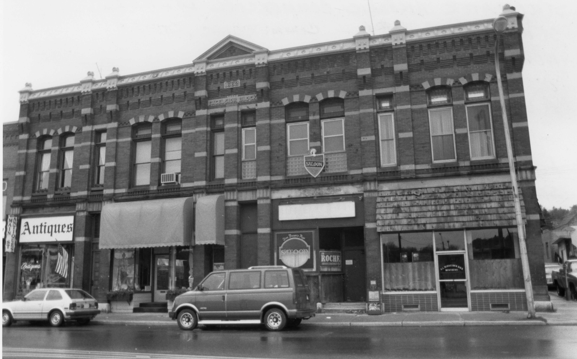
EXCESIOR BLOCK, 118-126 N. MAIN STILLWATER HISTORIC COMMERCIAL DISTRICT STILLWATER, WASHINGTON CO., MN PHOTO# 010070-10