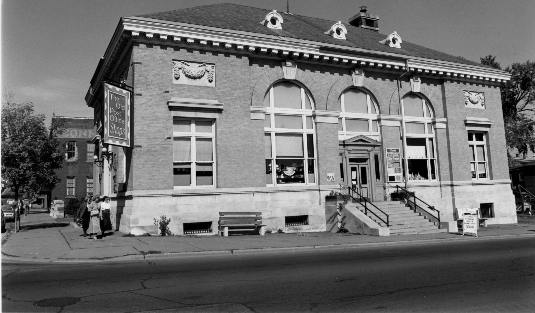
OLD FEDERAL BUILDING, 220 E. MYRTLE STILLWATER HISTORIC COMMERCIAL DISTRICT STILLWATER, WASHINGTON CO., MN PHOTO # 010065 - 22