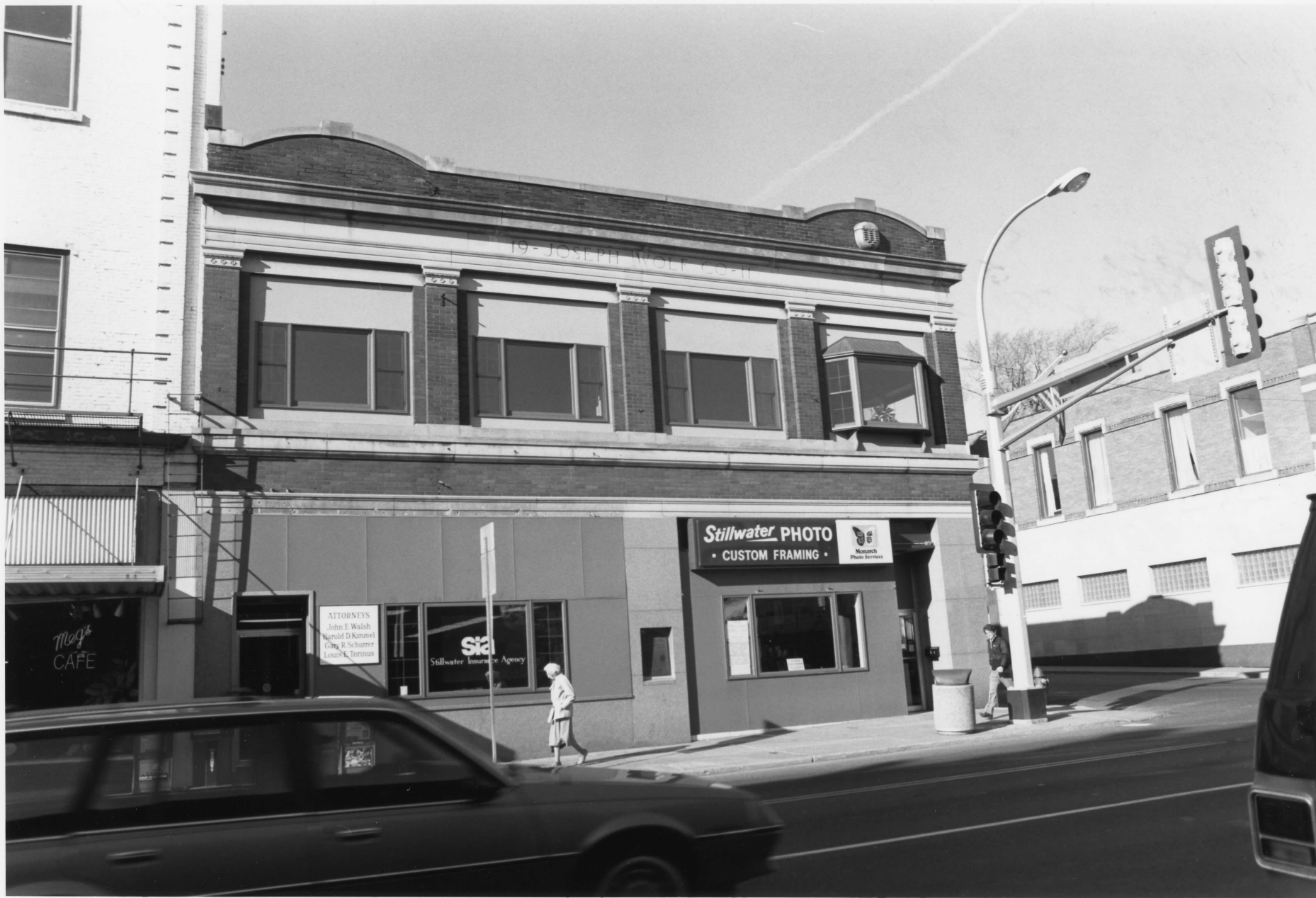
JOSEPH WOLF CO. BUILDING, 102 S. MAIN STILLWATER HISTORIC COMMERCIAL DISTRICT STILLWATER, WASHINGTON CO., MN PHOTO # 010067-9