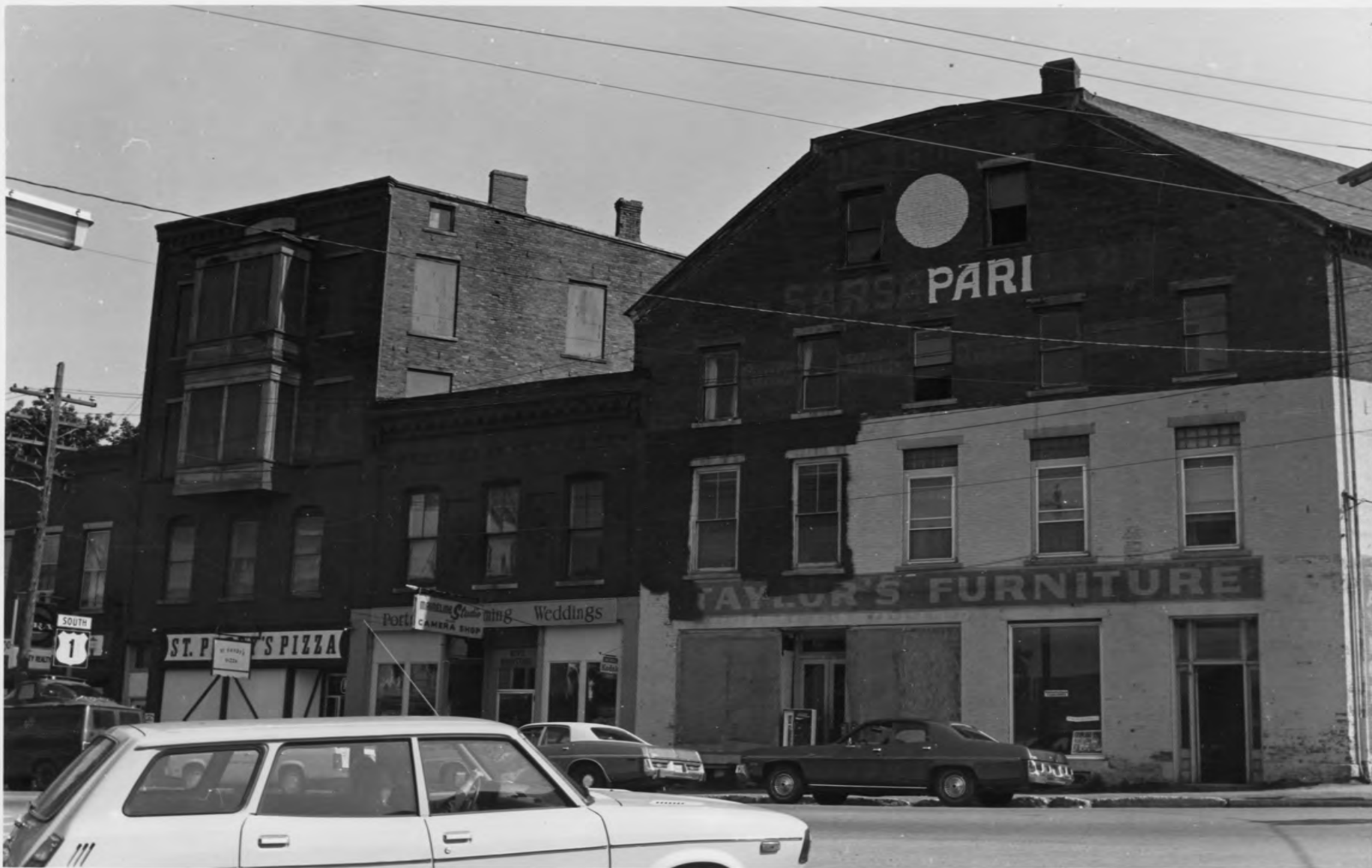
Calais Historic District