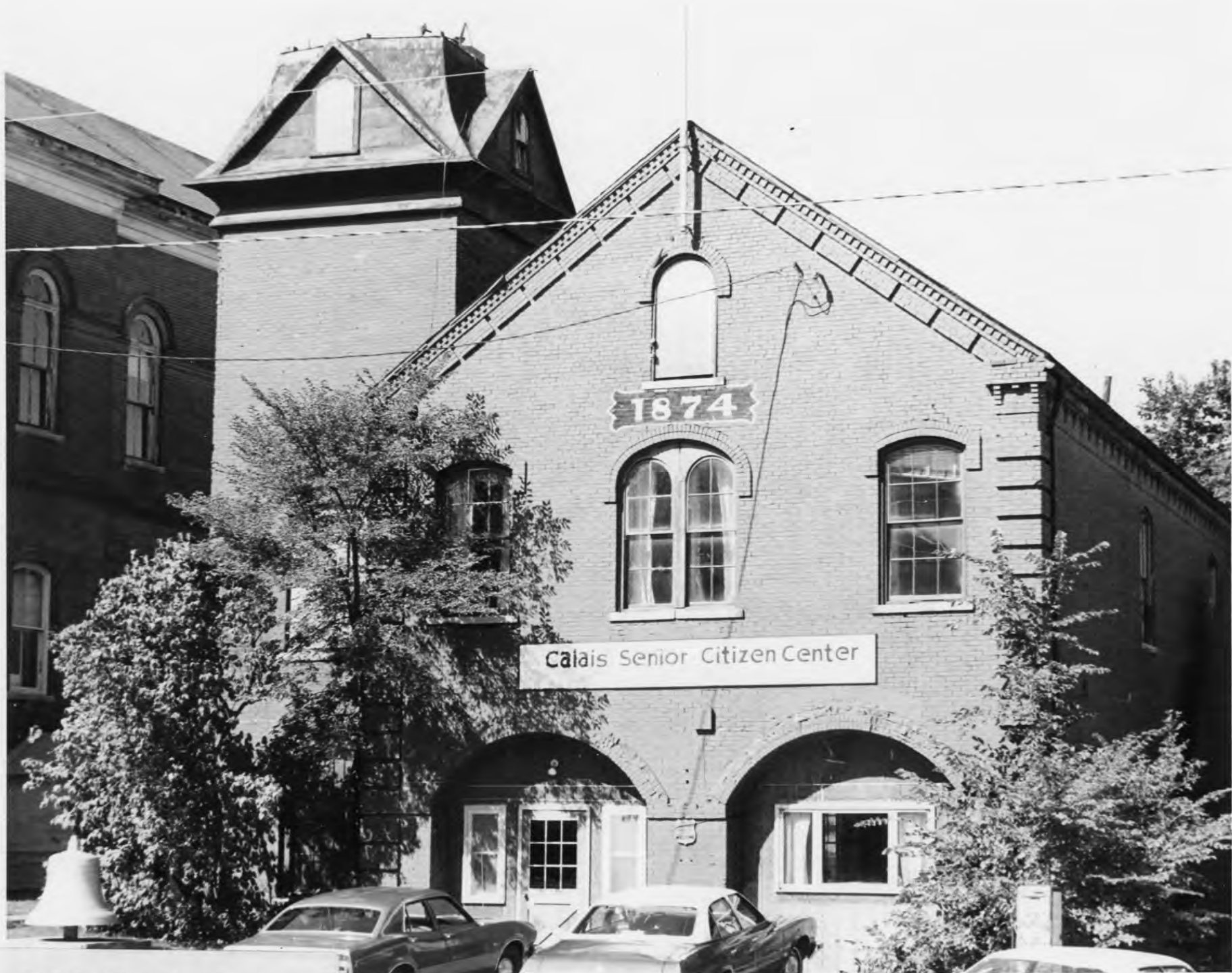
Calais Historic District