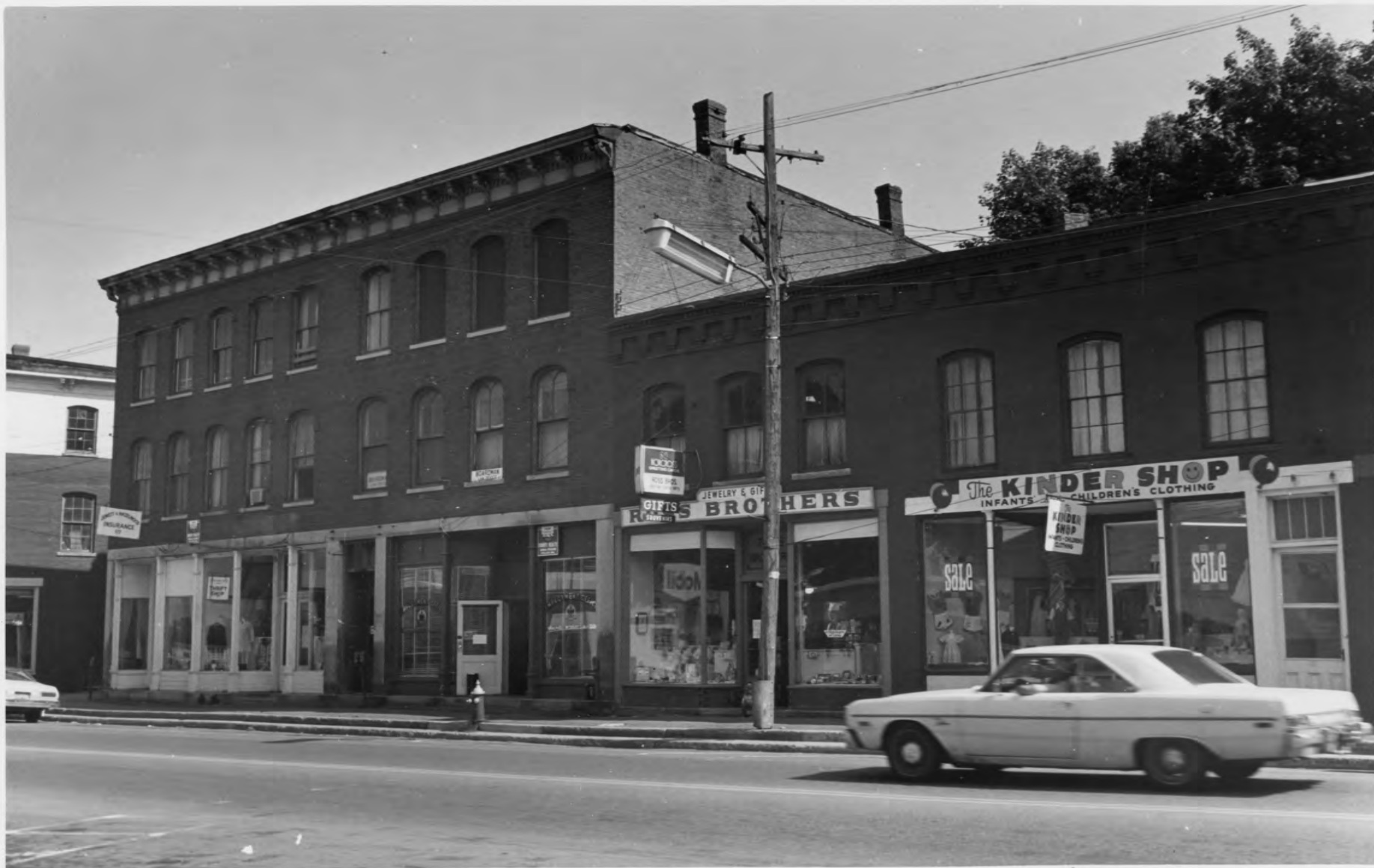
Calais Historic District