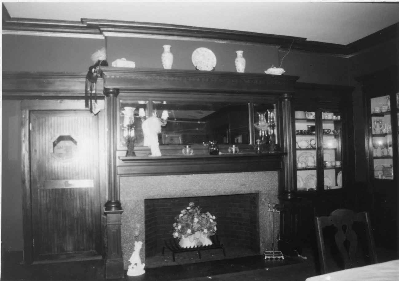
MOODY MANSION, KENNEBEC CO., ME