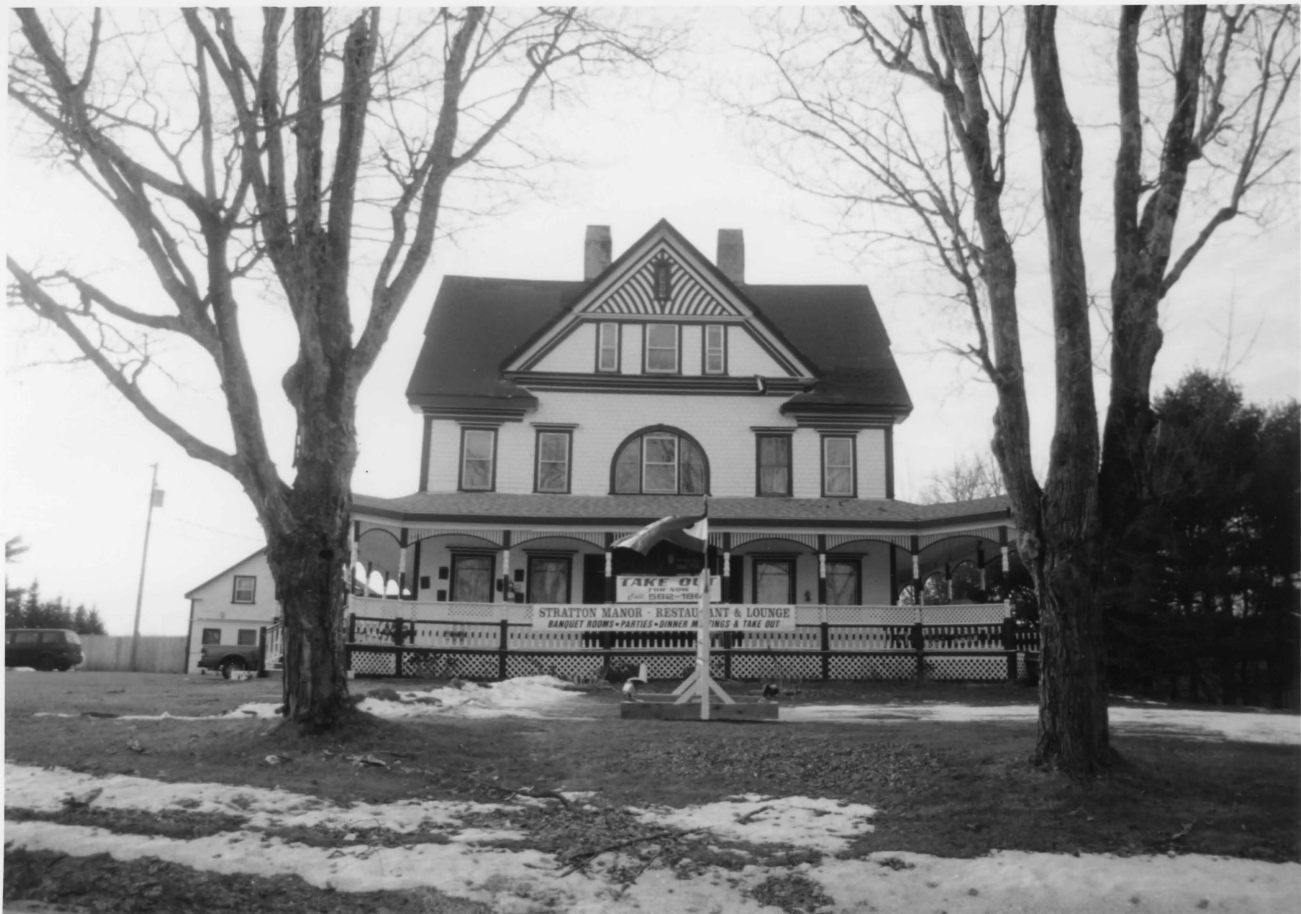
MOODY MANSION ; KENNEBEC CO., ME