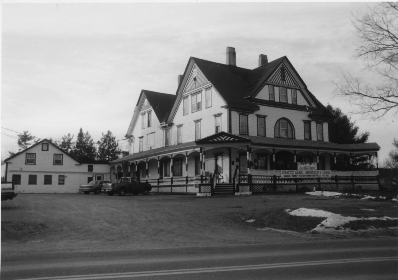
MOODY MANSION ; KENNEBEC CO., ME