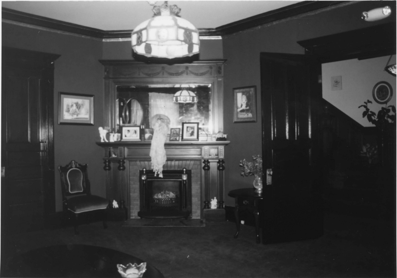
MOODY MANSION ; KENNEBEC CO., ME