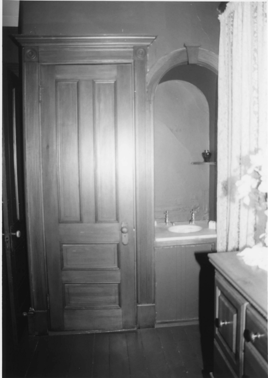
MOODY MANSION; KENNEBEC CO., ME