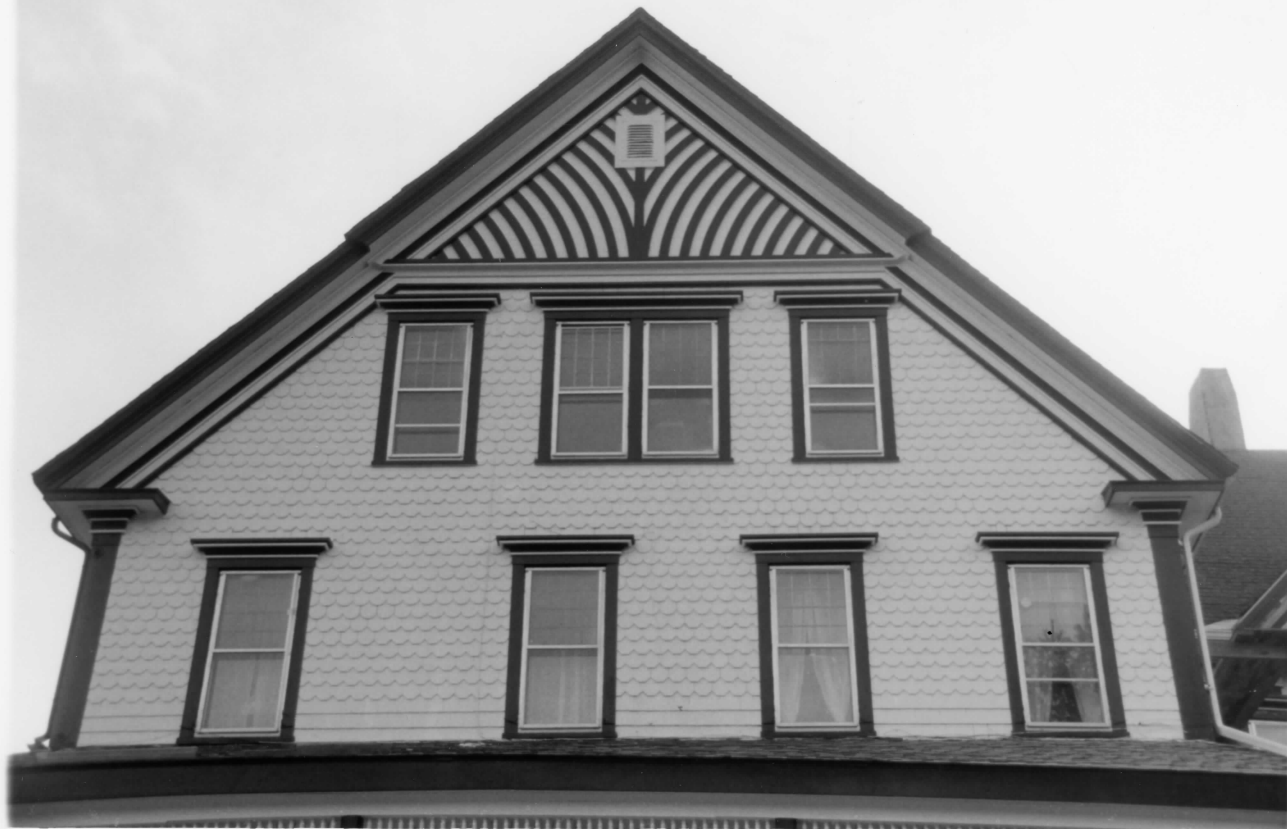
MOODY MANSION ; KENNEBEC CO., ME