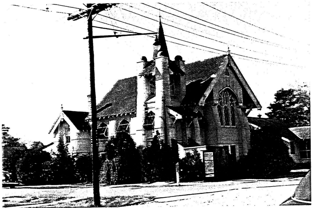
Circa 1950 view Fourth Church of Christ, Scientist Orleans Parish, LA