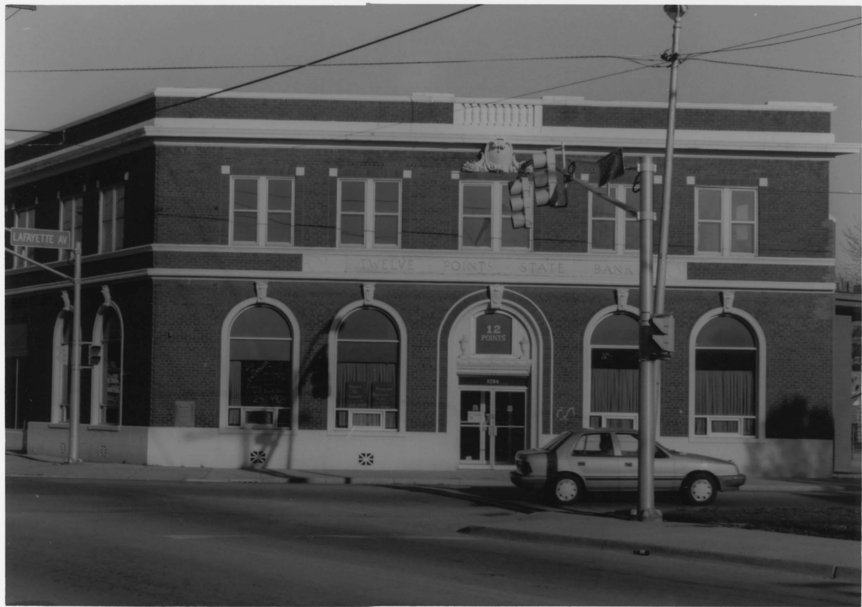
TWELVE PTS. STATE BANK, 12 PTS. H.D., VIGO CO., IN, PHOTO NO. 5