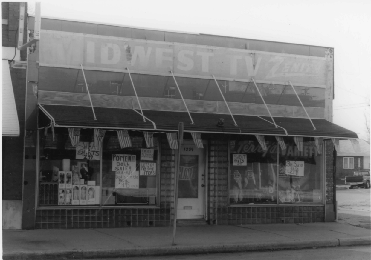
1239 LAFAYETTE AVE., 12 PTS. H.P., VIGO CO., IN., PHOTO NO. 24