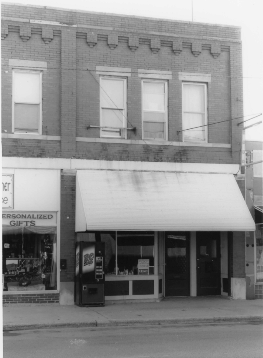
1241 LAFAYETTE AVE, 12 TH S.H.D., VIGO CO., IN, PHOTO No. 23