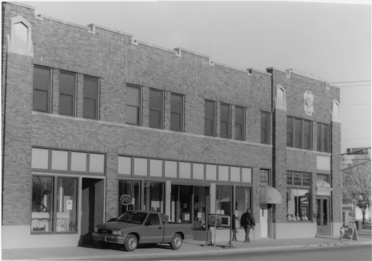
2070 13 TH ST., 12 PTS. H.D., VIGO CO., IN , PHOTO NO. 9