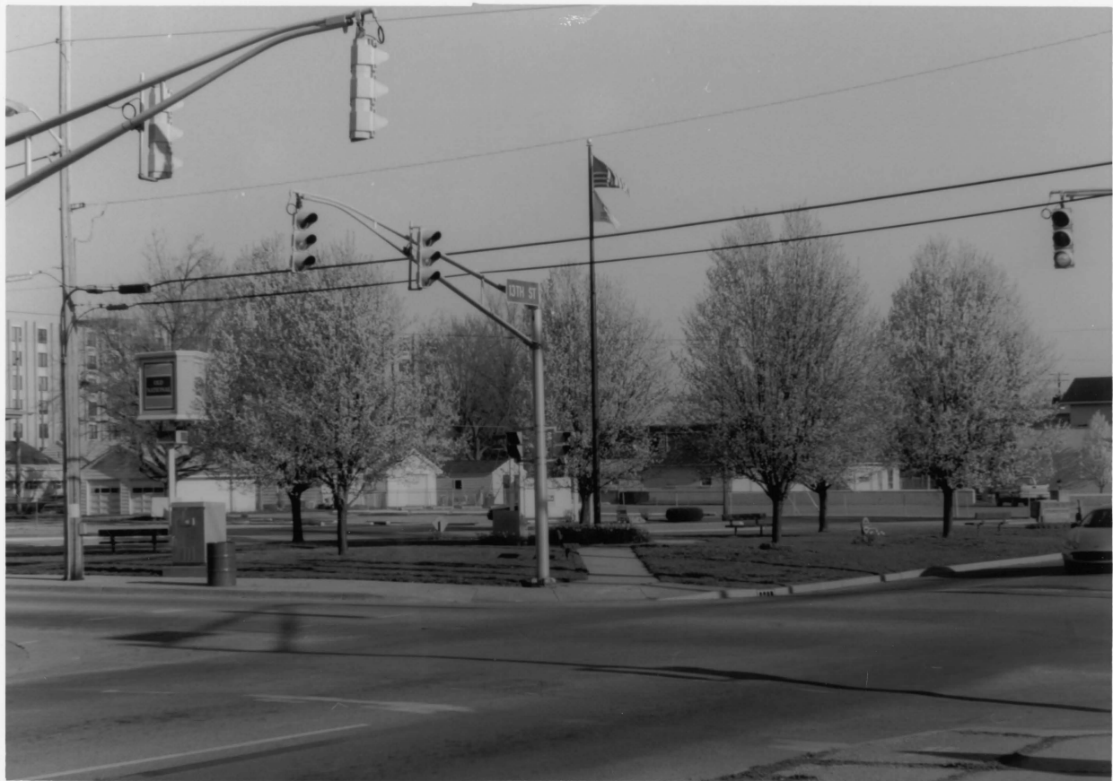
TWELVE PTS. PARK, 12 PTS. H.D., VIGO Co., IN. PHOTO No. 7