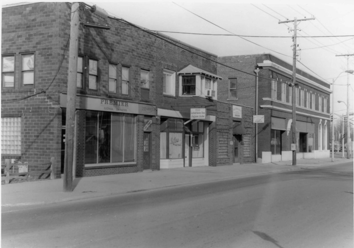
1240, 1242-1244, 1250-1256 MAPLE AVE 12 PTS. H.D, VIGO Co., IN PHOTO No. 1