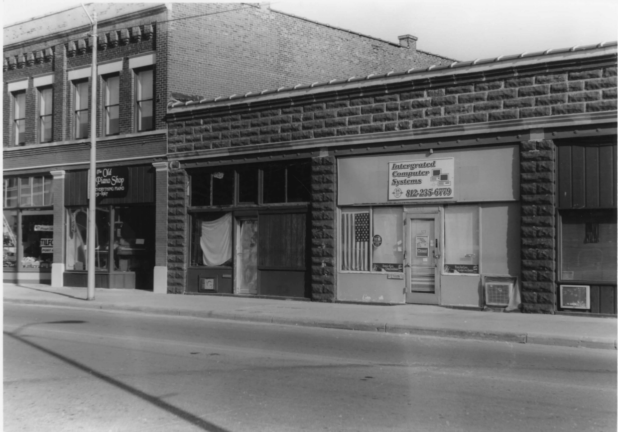
L-R: 1277, 1275, 1273 LAFAYETTE AVE, 12 PTS. H.D., VIGO CO., IN, PHOTO NO. 13