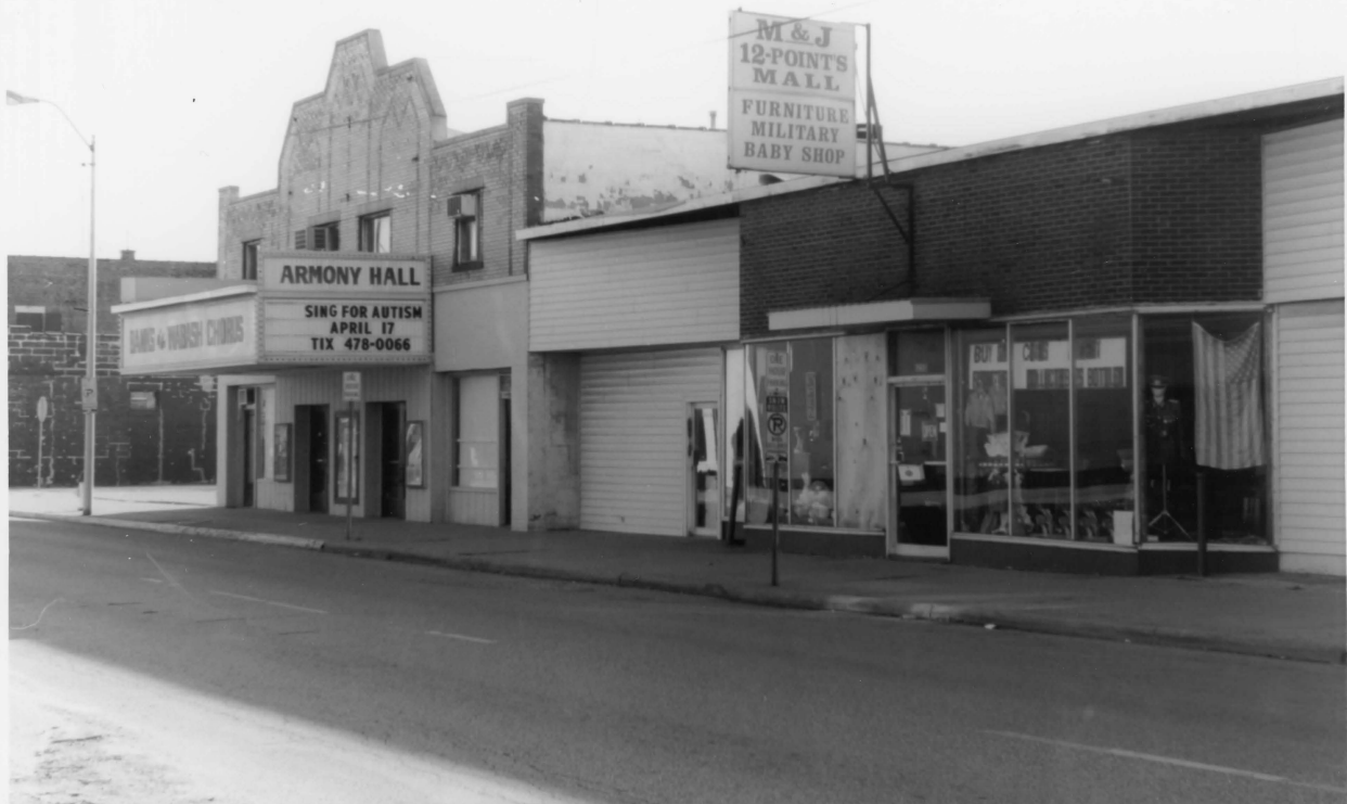
HARMONY HALL, 1257-59 LAFAYETTE AVE, 127PS. H.D., VIGO CO., IN, PHOTO No. 19