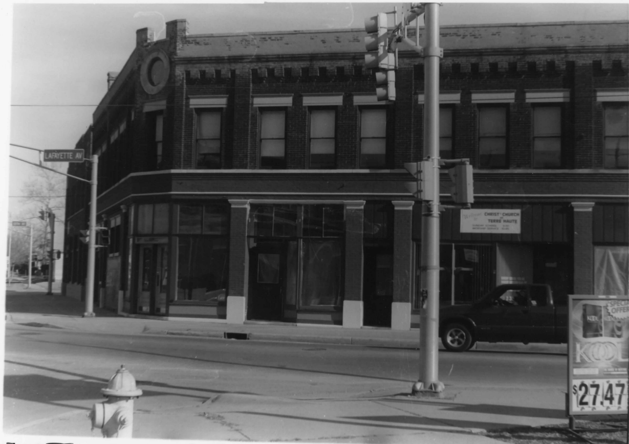
TWELVE PTS. HOTEL, 1277-85 LAFAYETTE AVE, 12 PTS. H.D., VIGO CO, IN, PHOTO No. 10