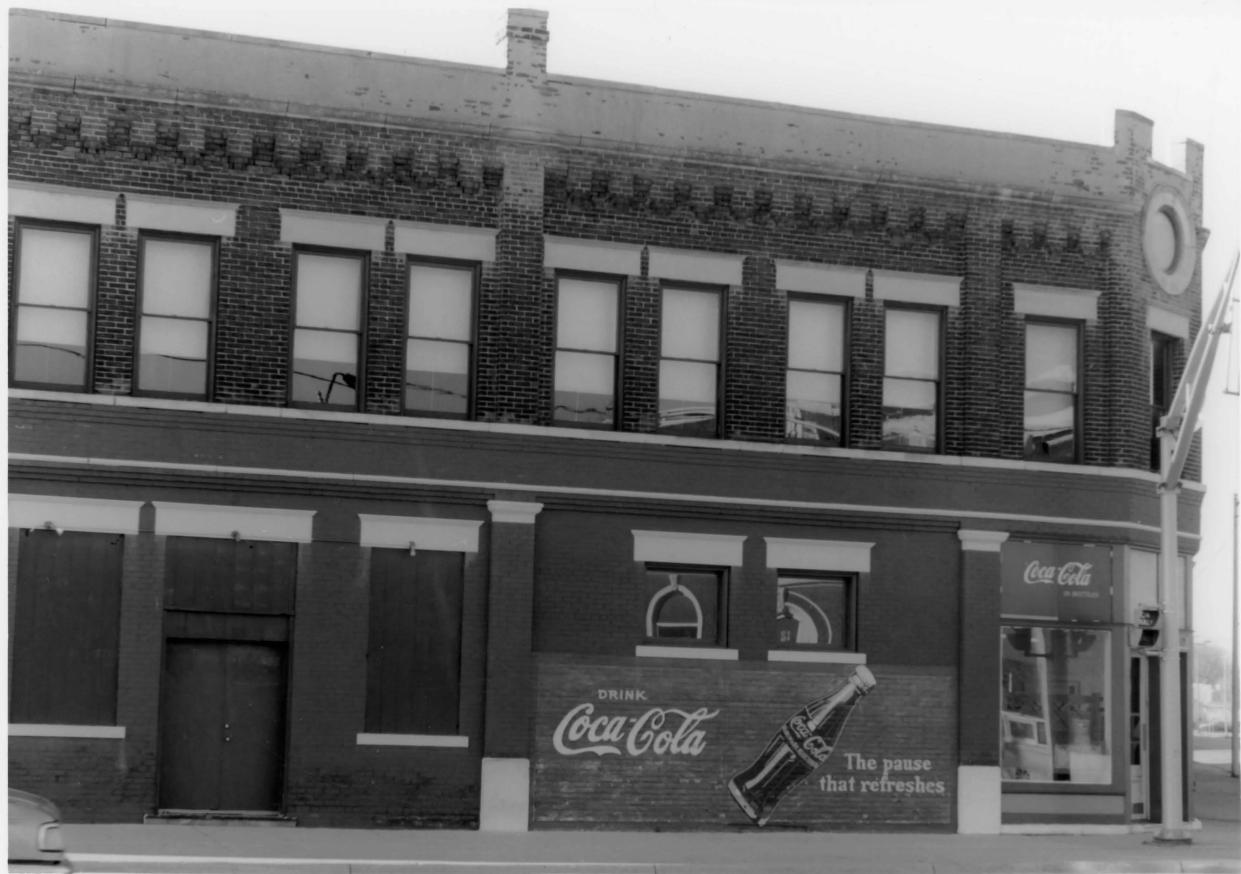
TWELVE FT. S. HOTEL, 12 PTS. H. D, VICO CO; IN PHOTO No. 6