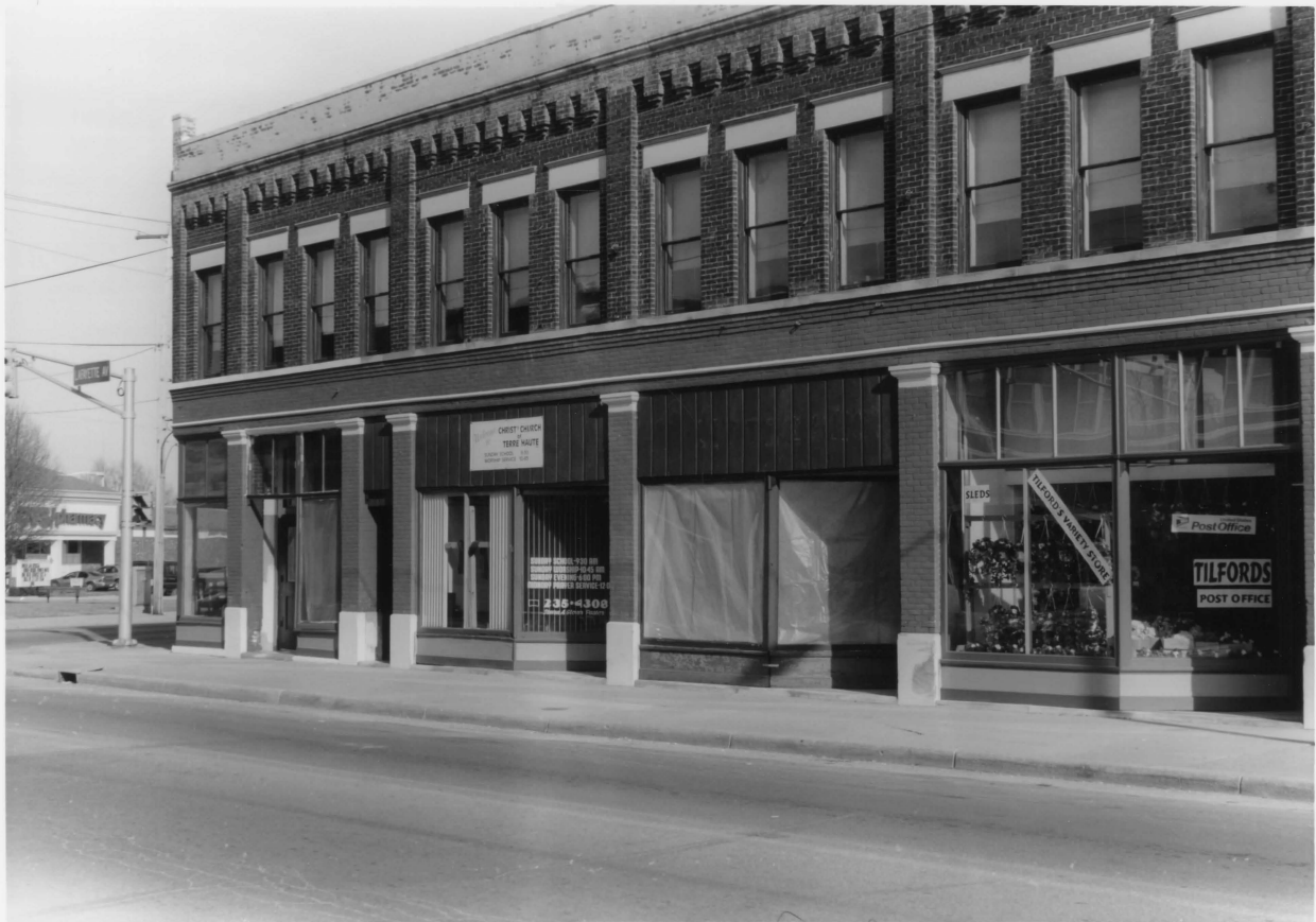
TWELVE PTS. HOTEL, 12 PTS. H.D., VIGO CO., IN., PHOTO NO. 11