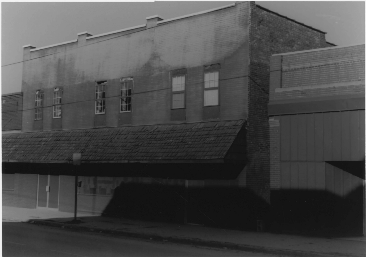
1236-B, 1240 LAFAYETTE AVE., 12 Pts. H.D., VIGO CO., IN, PHOTO NO. 21