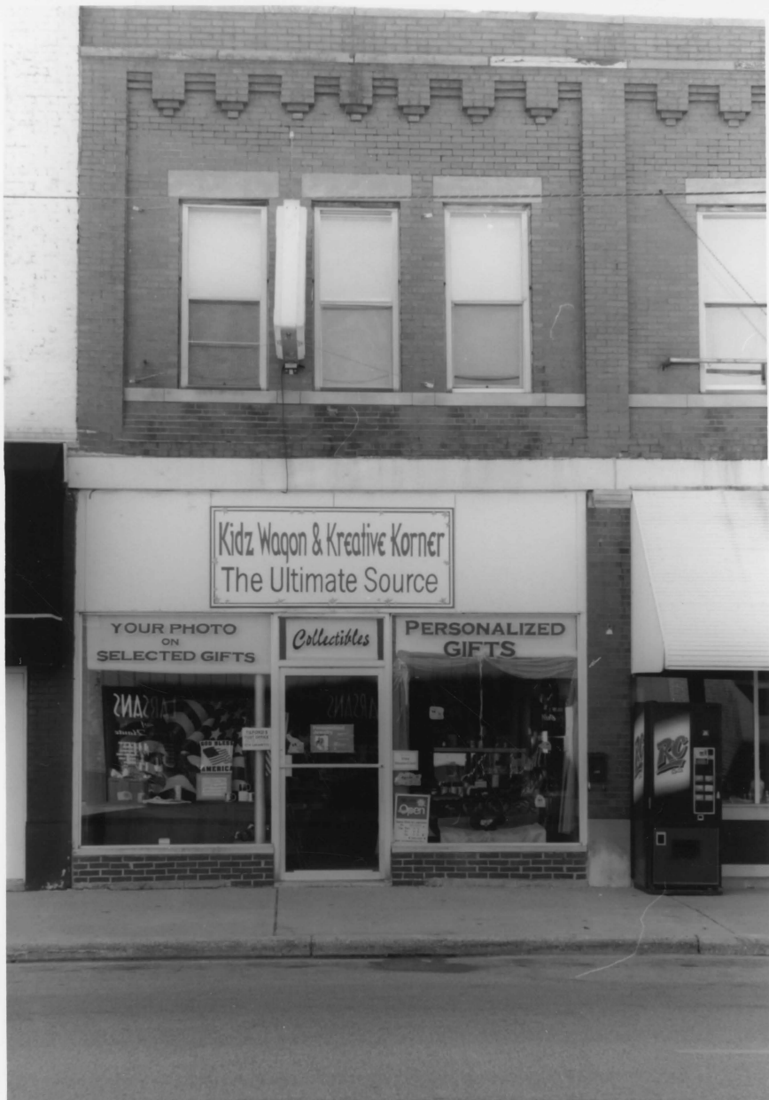
1243 LAFAYETTE AVE, 12 PTS. H.D., VIGO CO, IN, PHOTO No. 22