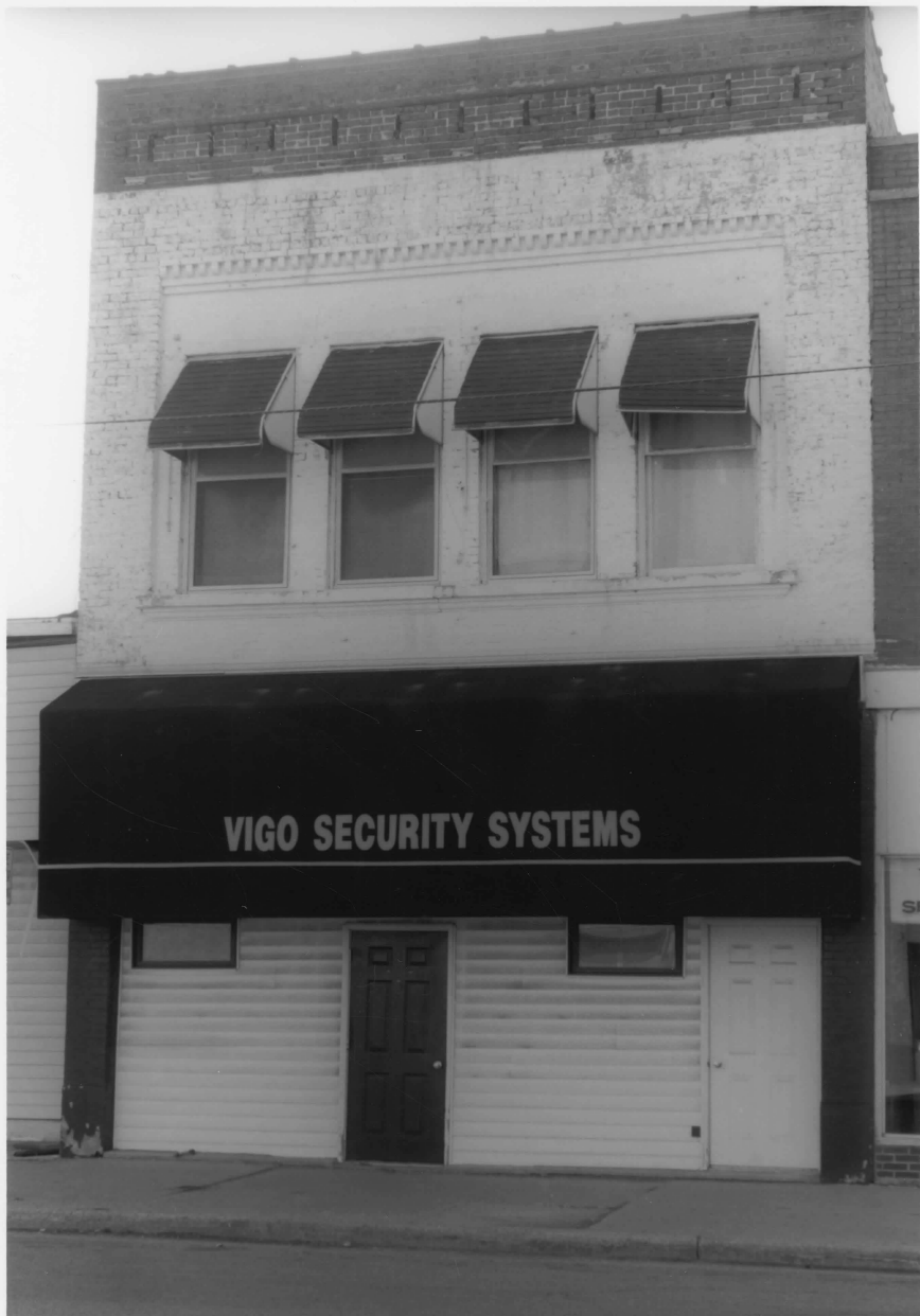
1245 LAFAYETTE AVE., 12 PTS. H.D., VIGO CO., IN, PHOTO No. 20