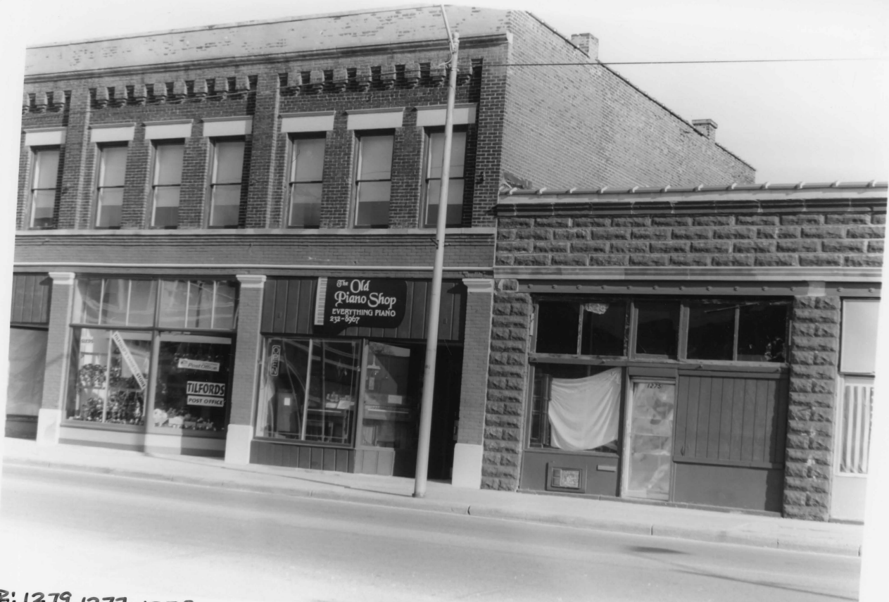
-R: 1279, 1277, 1275 LAFAYETTE AVE., 12 PTS. H.D., VIGO CO.: IN. PHOTO NO. 12