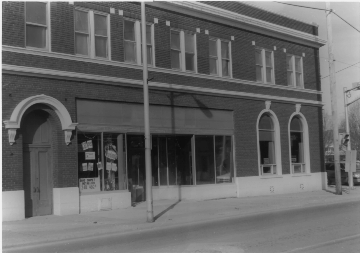
TWELVE POINTS STATE BANK, 1250-56 MAPLE AVE, 12 PTS. H.D, VILCO CO.; IN PHOTO