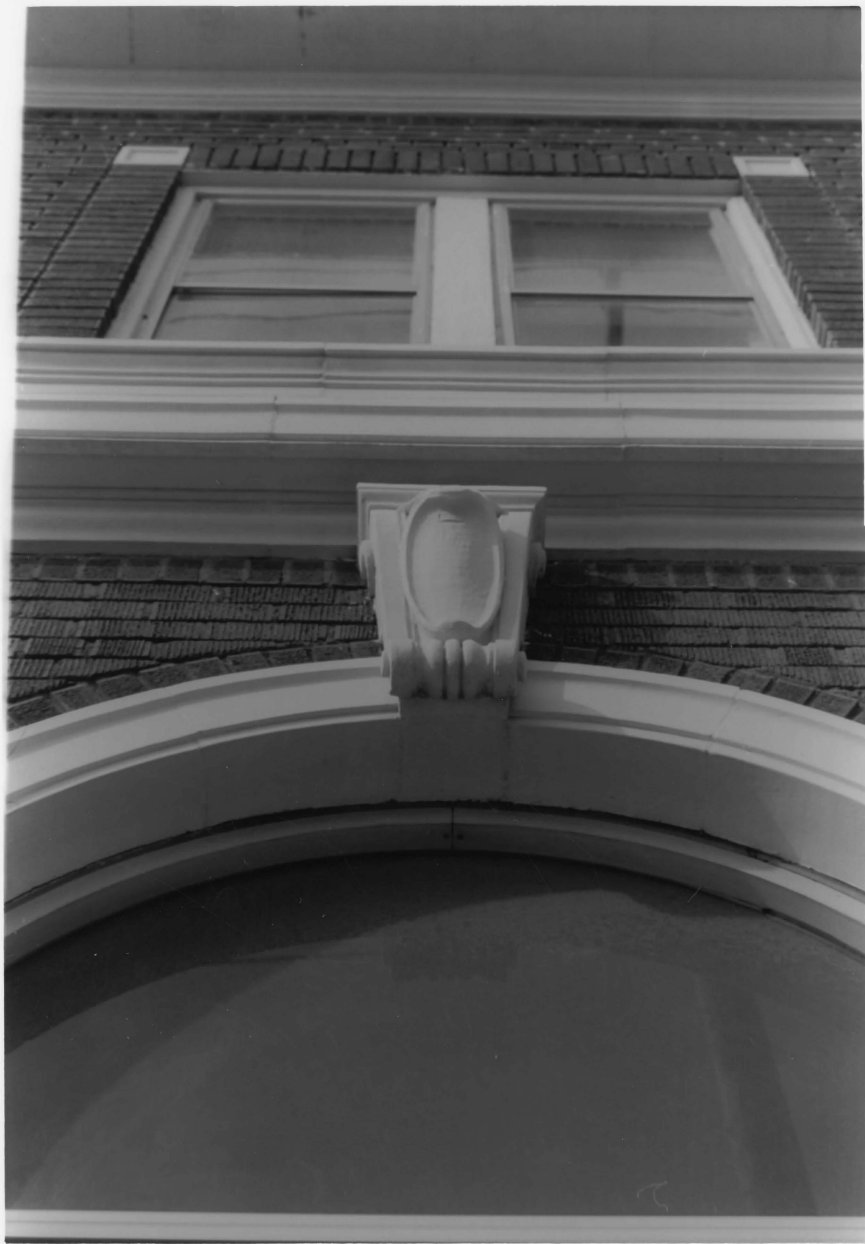
TWELVE PTS. STATE BANK, 12 PTS. H.D., VIGO CO., IN PHOTO No. 4