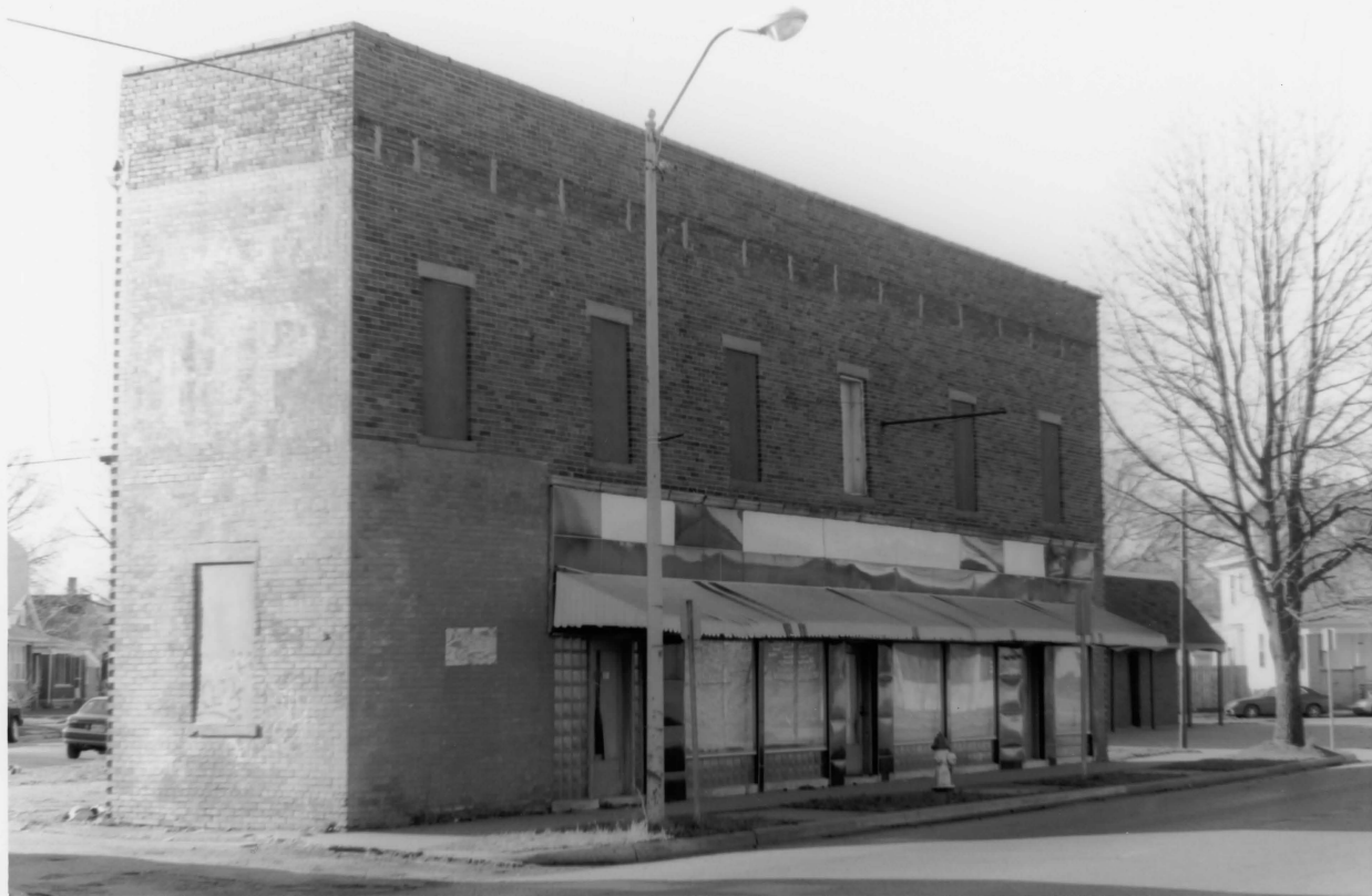
1231 LAFAYETTE AVE, 12 PPS. H. D., VIGO CO., IN, PHOTO NO. 25