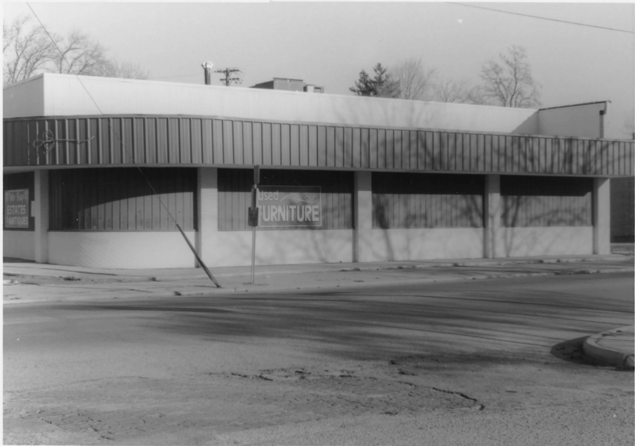
1210 LAFAYETTE AVE., 12 PTS. H.D., VIGO Co., IN, PHOTO No. 28