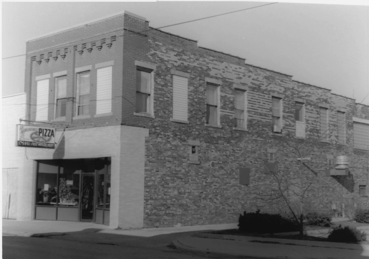
1250 LAFAYETTE AVE., 12 PTS. H. D., VIGO Co., IN, PHOTO No. 16