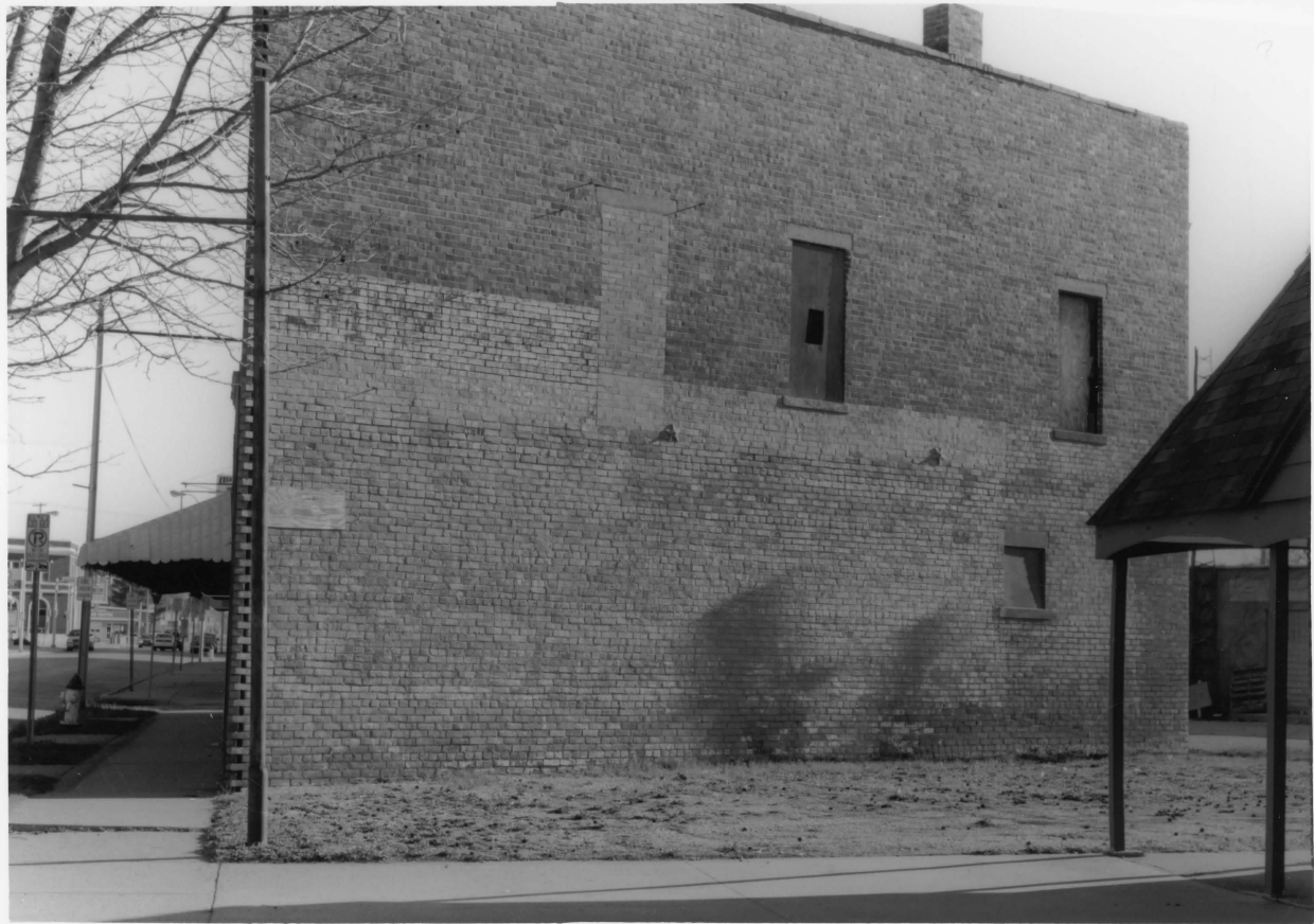
1231 LAFAYETTE AVE, 12 PTS. H.D., VIGO CO, IN, PHOTO NO. 27