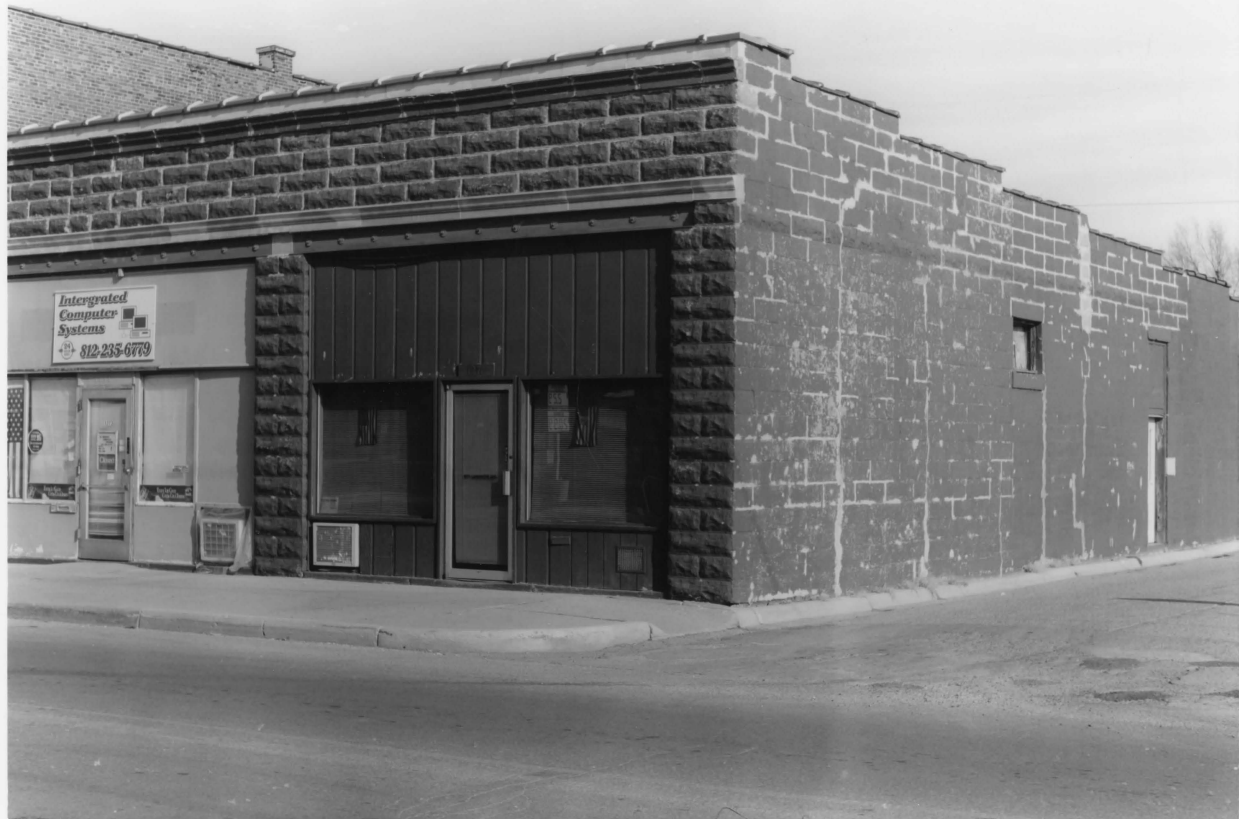
L-R: 1273, 1271 LAFAYETTE AVE., 12 PTS. H.D., VIGO CO., IN, PHOTO NO. 14