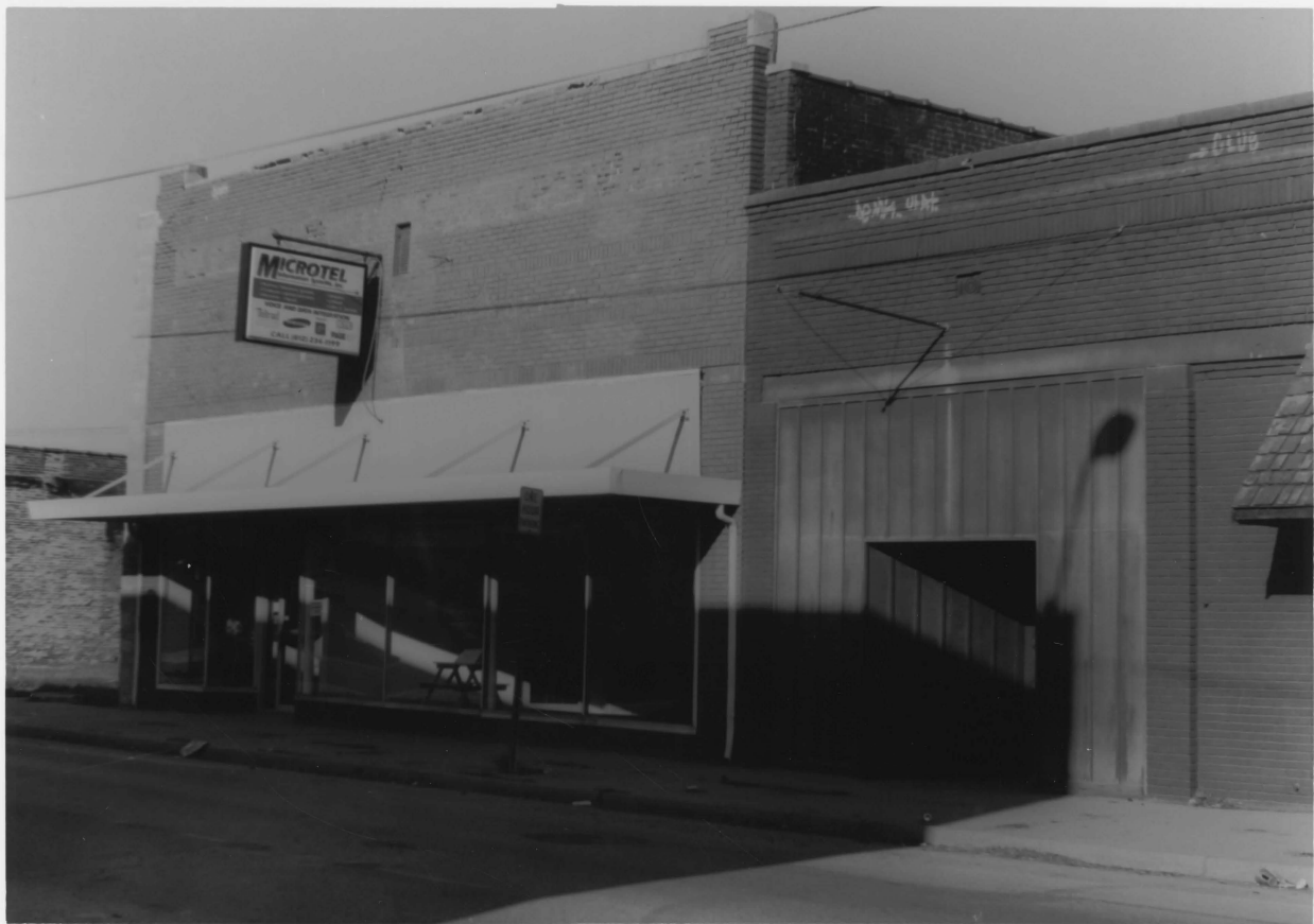
L-R: 1222, 1226 LAFAYETTE AVE, 12 PTS; H.D., VIGO CO., IN, PHOTO NO. 26