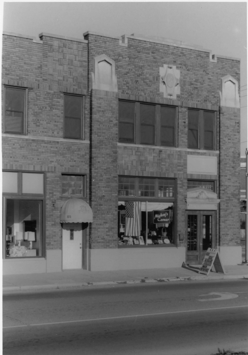
2070 13 TH ST., 12 P.B.H.D, VIGO CO., IN, PHOTO NO. 8