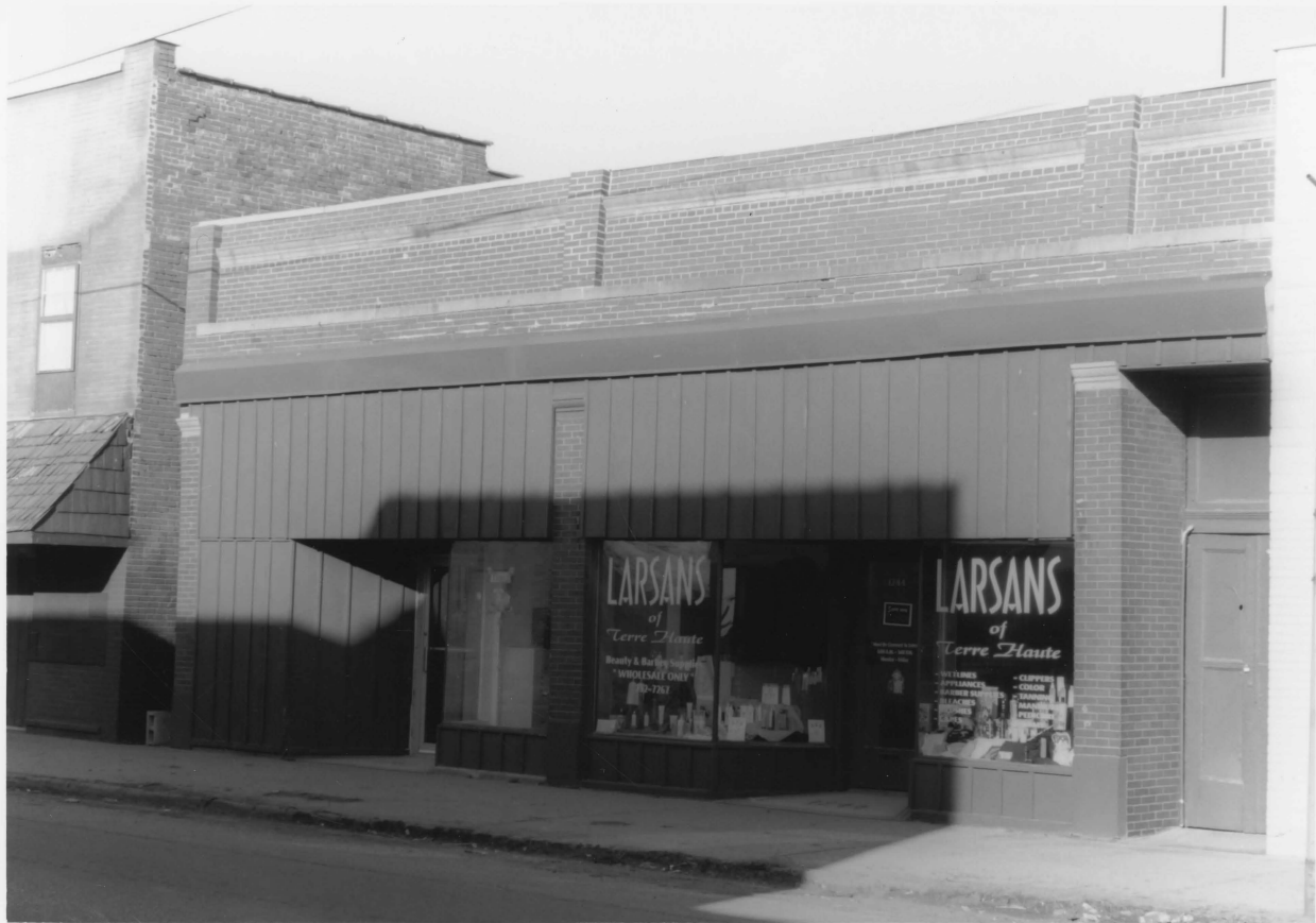
1244 LAFAYETTE AVE, 12 PTS. H.P., VIGO CO., IN, PHOTO NO. 18 1242