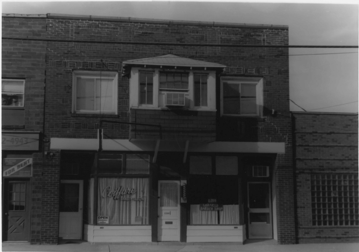
1242-1244 MAPLE AVE, 12 PTS. H.D, VIGO Co., IN PHOTO No. 2