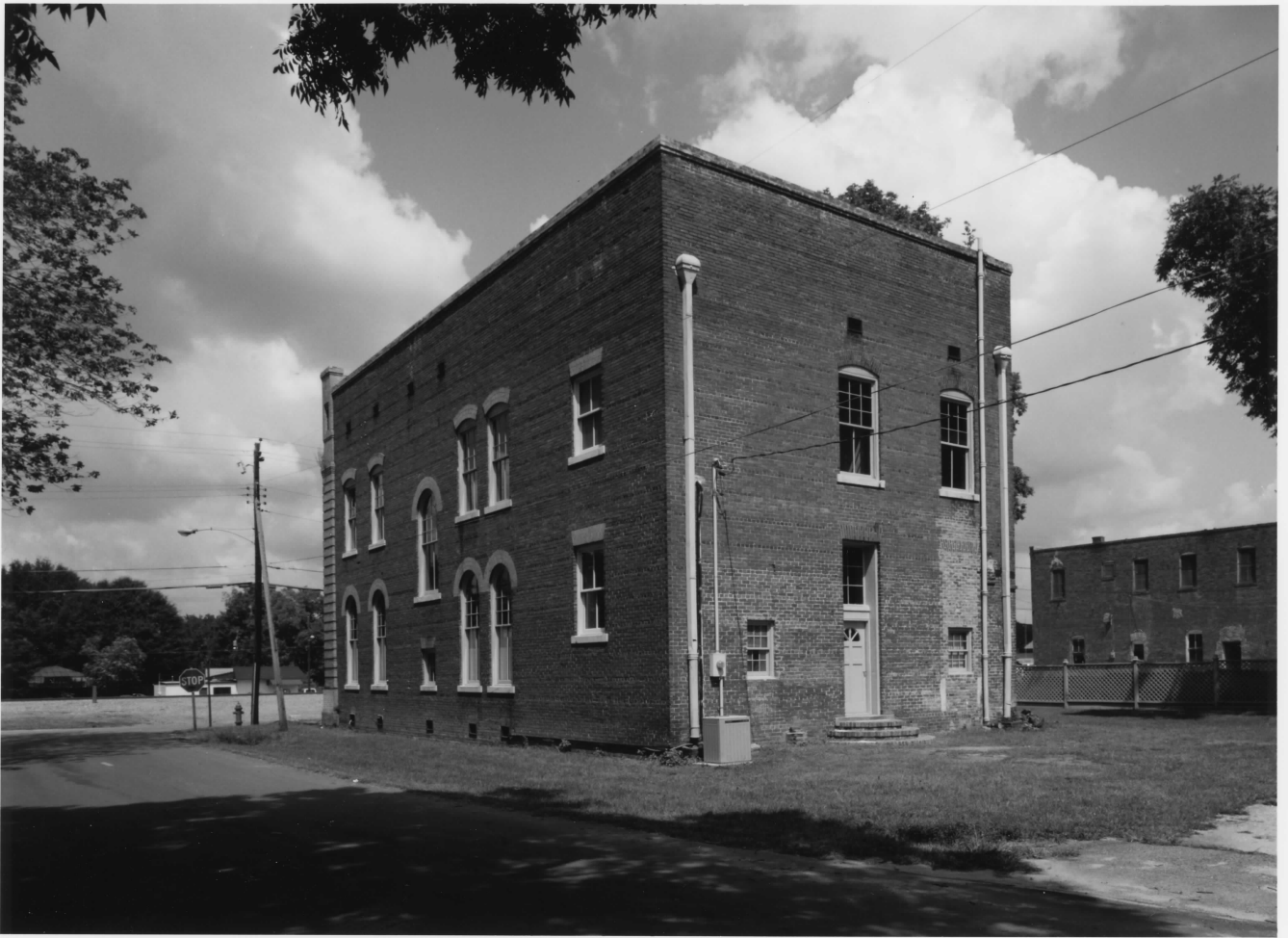
Wrightsville and Tennille Railroad Company Building Tennille, Washington Co., GA #2 of 5