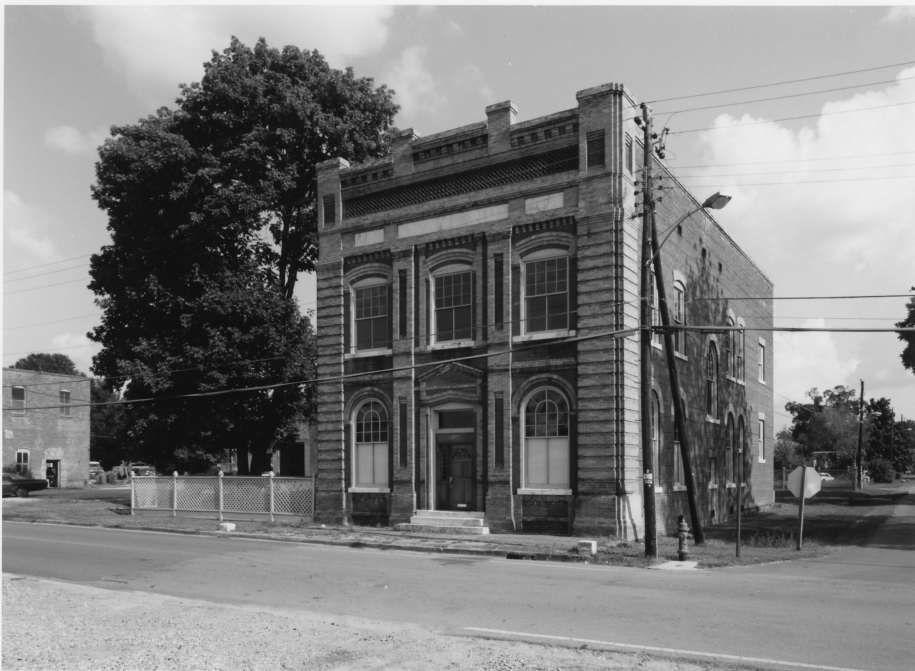
Wrightsville and Tennille Railroad Company Building Tennille, Washington Co., GA