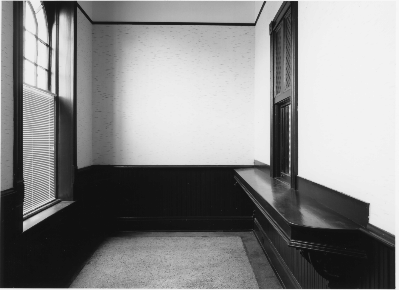
Wrightsville and Tennille Railroad Company Building Tennille, Washington Co., GA #30 of 5