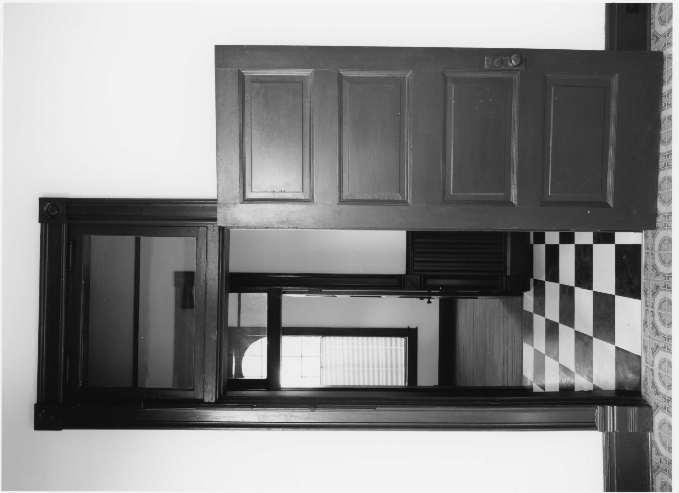
Wrightsville and Tennille Railroad Company Building Tennille, Washington Co., GA #5 of 5