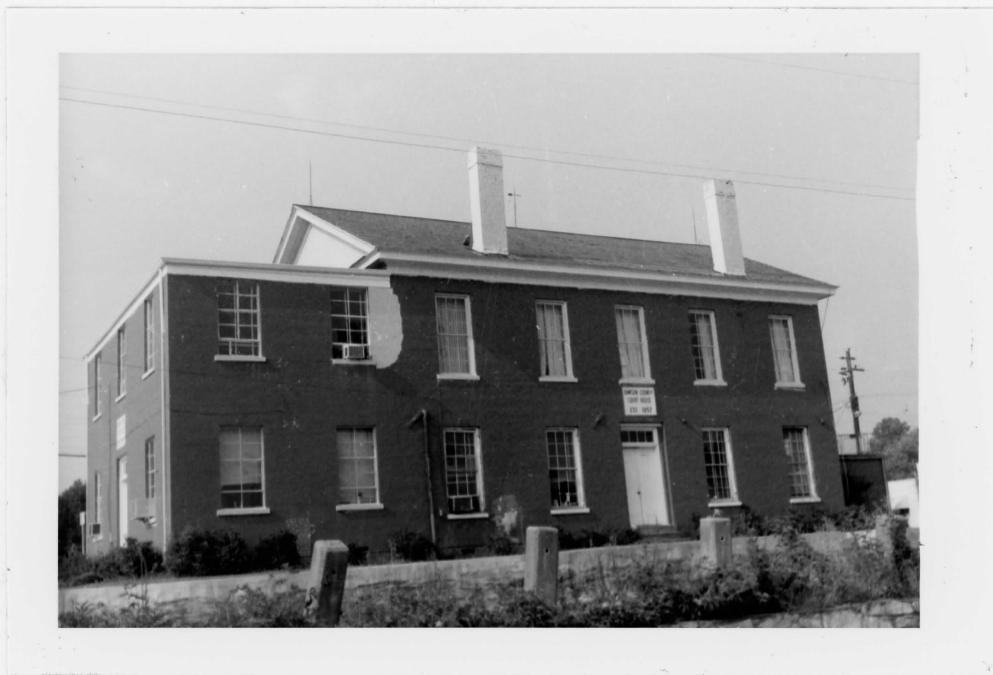
DAWSON COUNTY COURTHOUSE