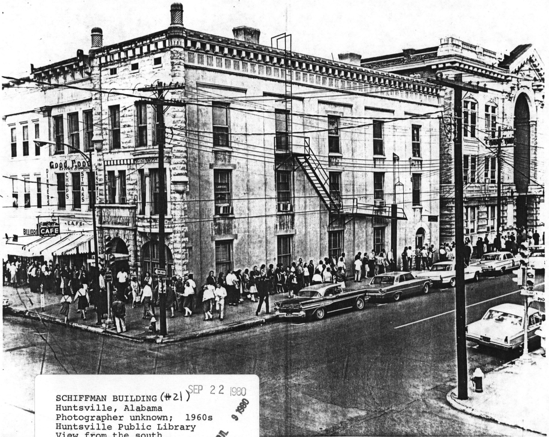
SCHIFFMAN BUILDING (#21) SEP 22 1980 Huntsville, Alabama Photographer unknown; 1960s Huntsville Public Library View from the south JUL 9 1980