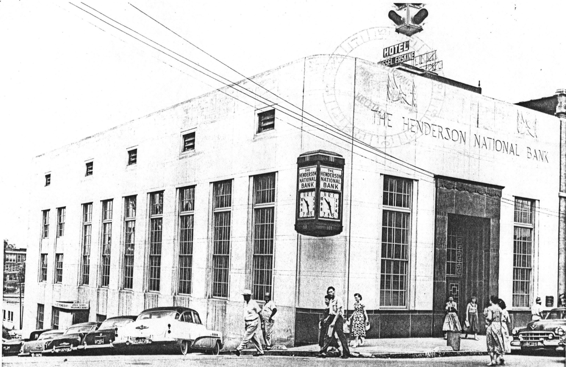
HENDERSON NATIONAL BANK (#9) Huntsville, Alabama ca. 1955 View from the southeast