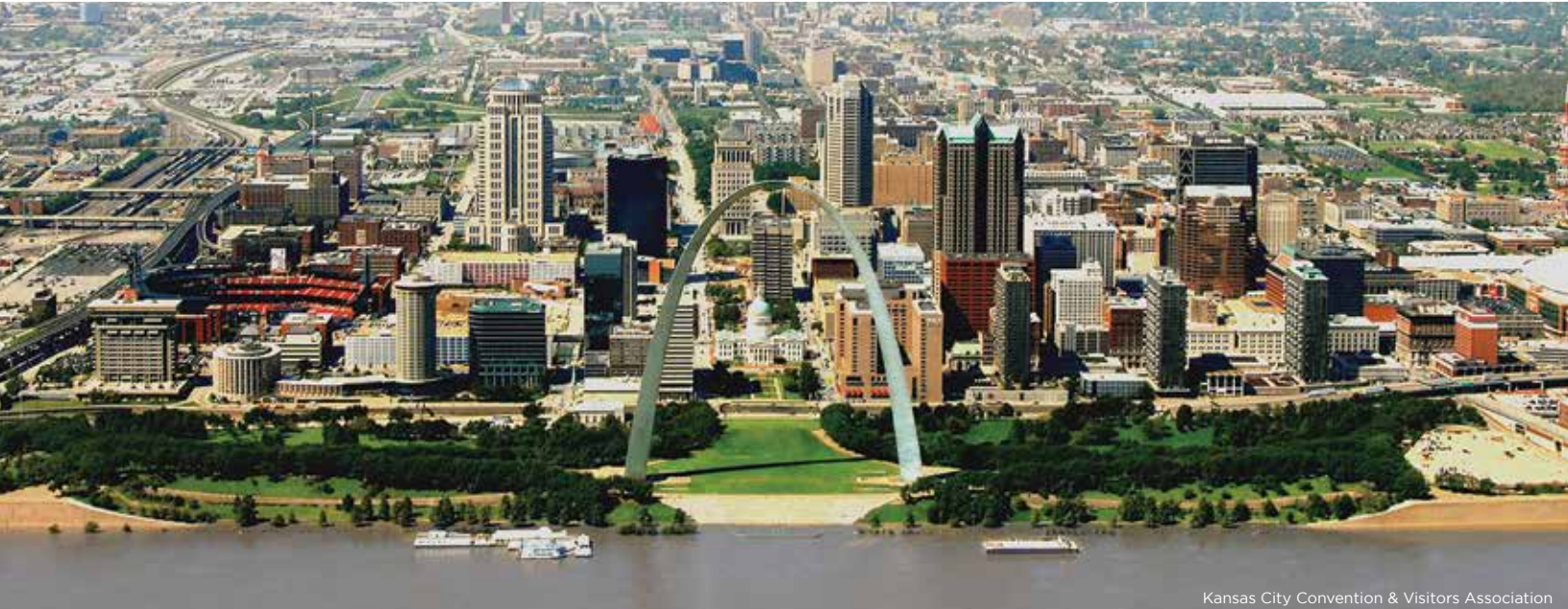
Kansas City Convention & Visitors Association

Missouri Economic Development Financing Association