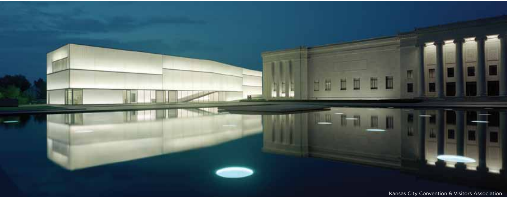
Kansas City Convention & Visitors Association