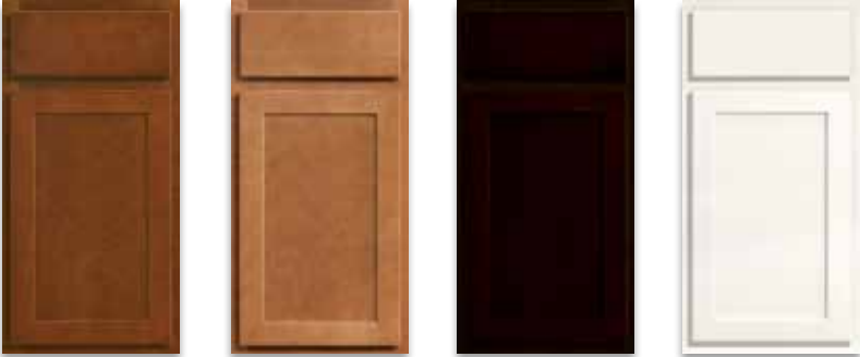
Clove Mirage Twilight Cotton Paint