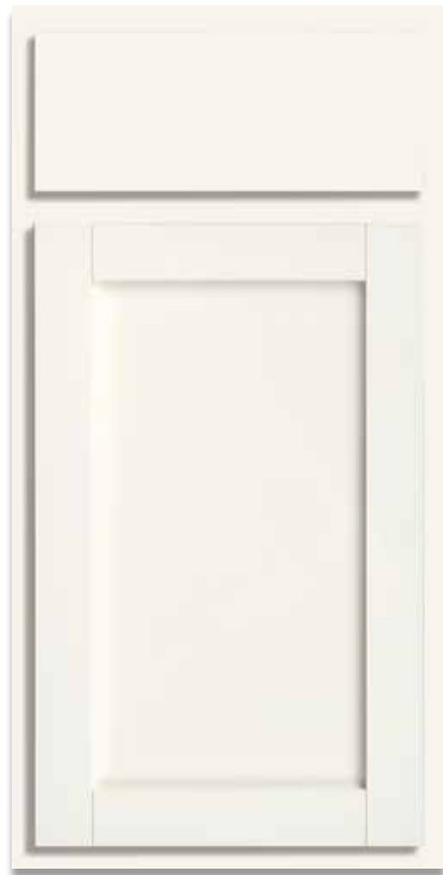
Door Style: McDurmon Wood Type: Laminate Finish: White