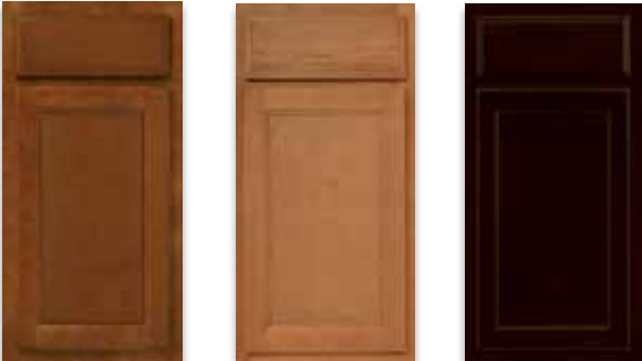
Clove Mirage Twilight