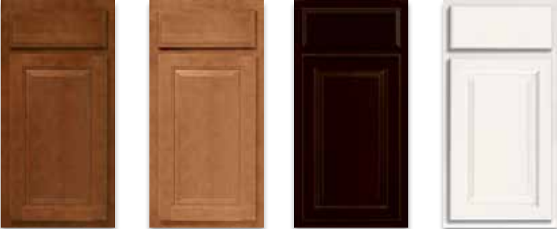
Clove Mirage Twilight Cotton Paint