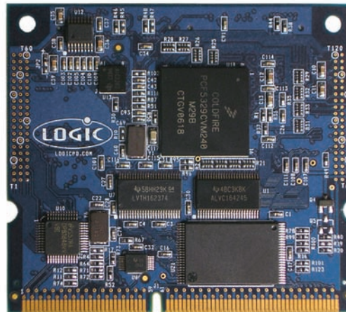
FREESCALE MCF5329 FIRE ENGINE

The MCF5329 Fire Engine is ideal for applications in the medical, point-of-sale, industrial, and security markets. From patient