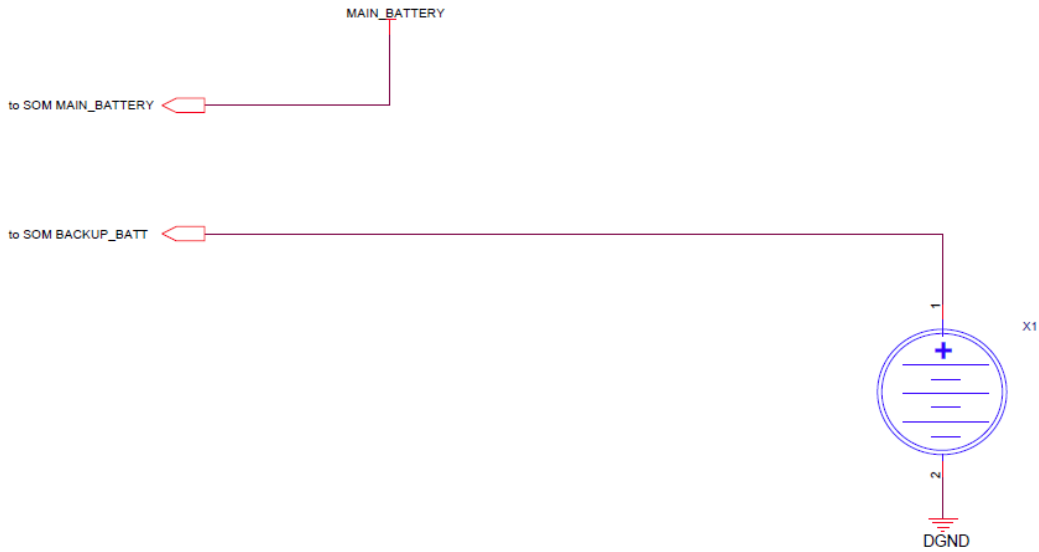
Figure 3.1: Backup Battery Configuration for MAIN_BATTERY without Switch

If MAIN_BATTERY is not controlled by a switch before the SOM and is instead left on at all times, the backup battery should be connected as shown in Figure 3.1 below. Software must be configured to control the backup battery charging enable bit of the TPS65950 depending on whether the backup battery is rechargeable or non-rechargeable.