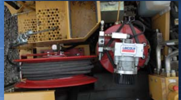
TOP VIEW OF REEL-N-FLOW INSTALLATION