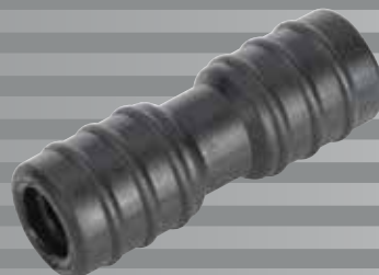
Model MVA7218 ATF adapter connector