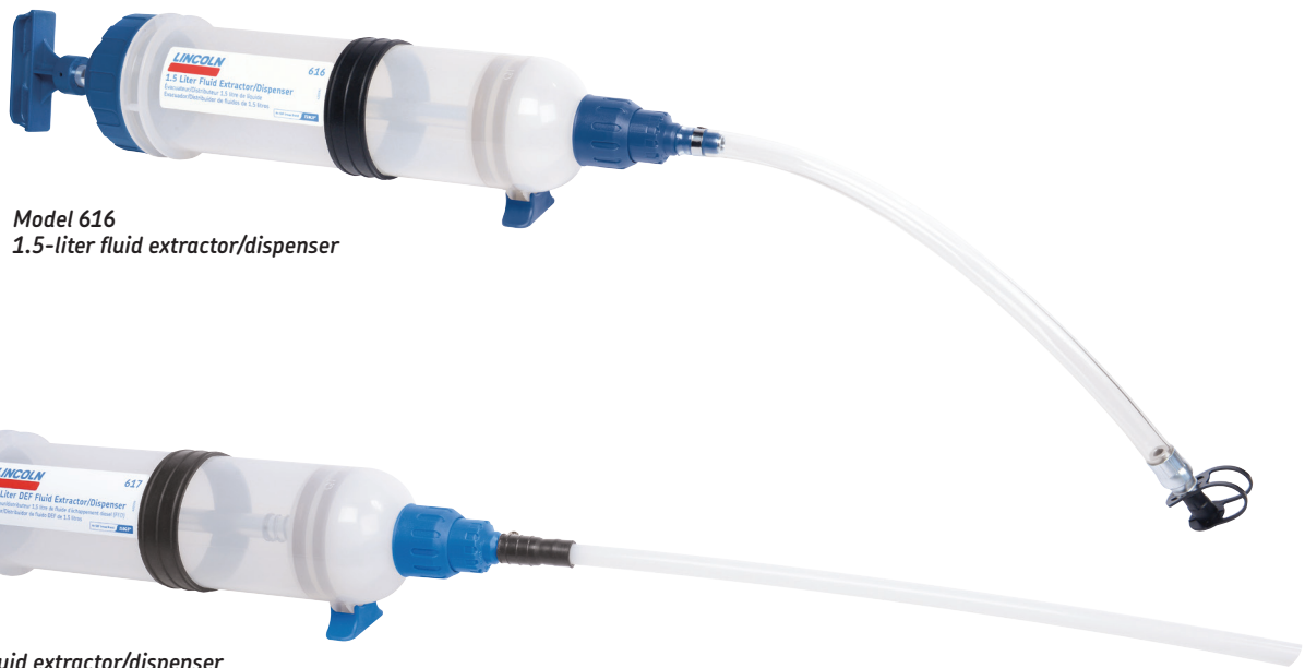
Model 616 1.5-liter fluid extractor/dispenser